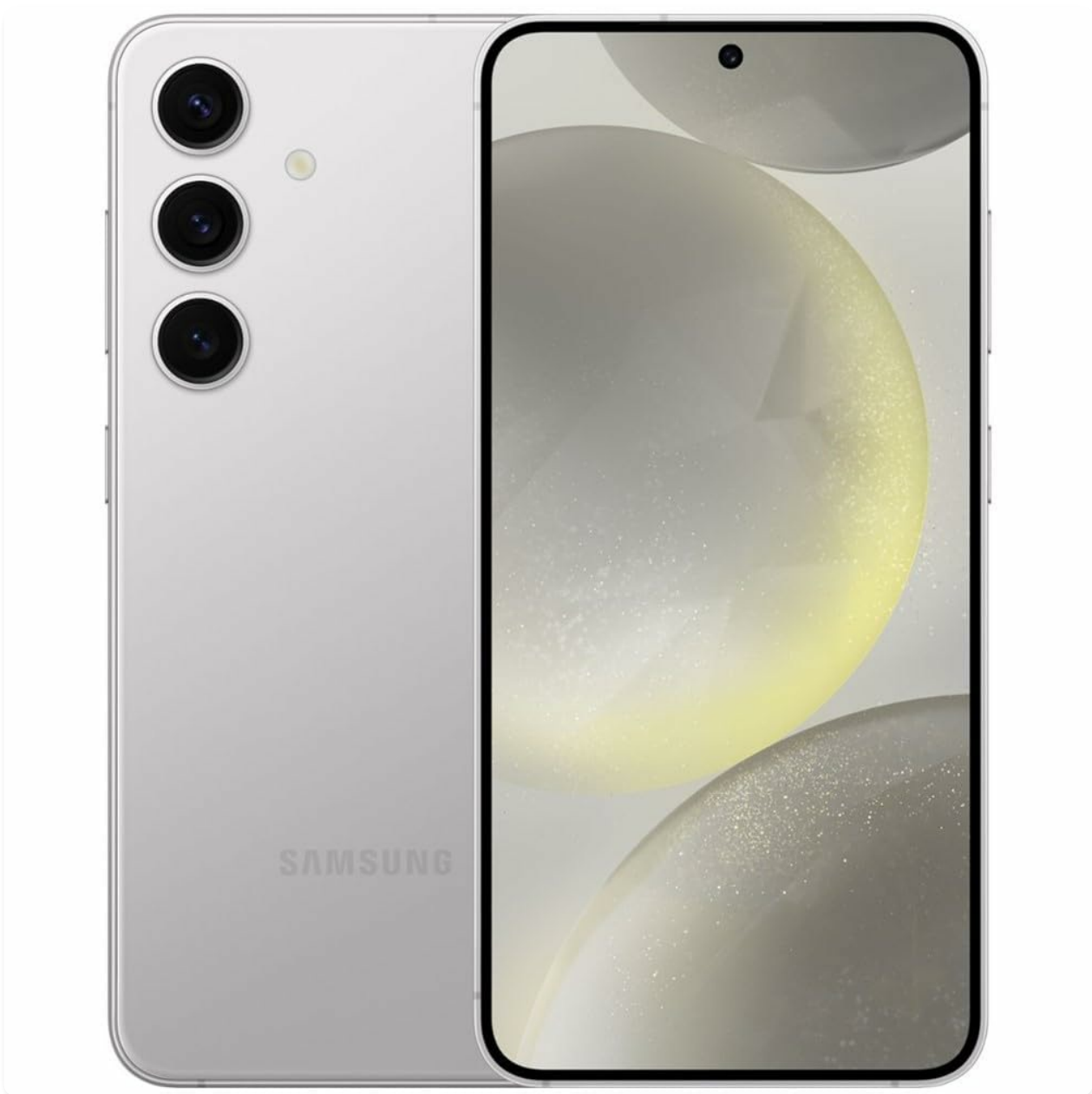
Figure 1: Samsung Galaxy S24+ Plus 5G in Marble Gray, showcasing its sleek design.