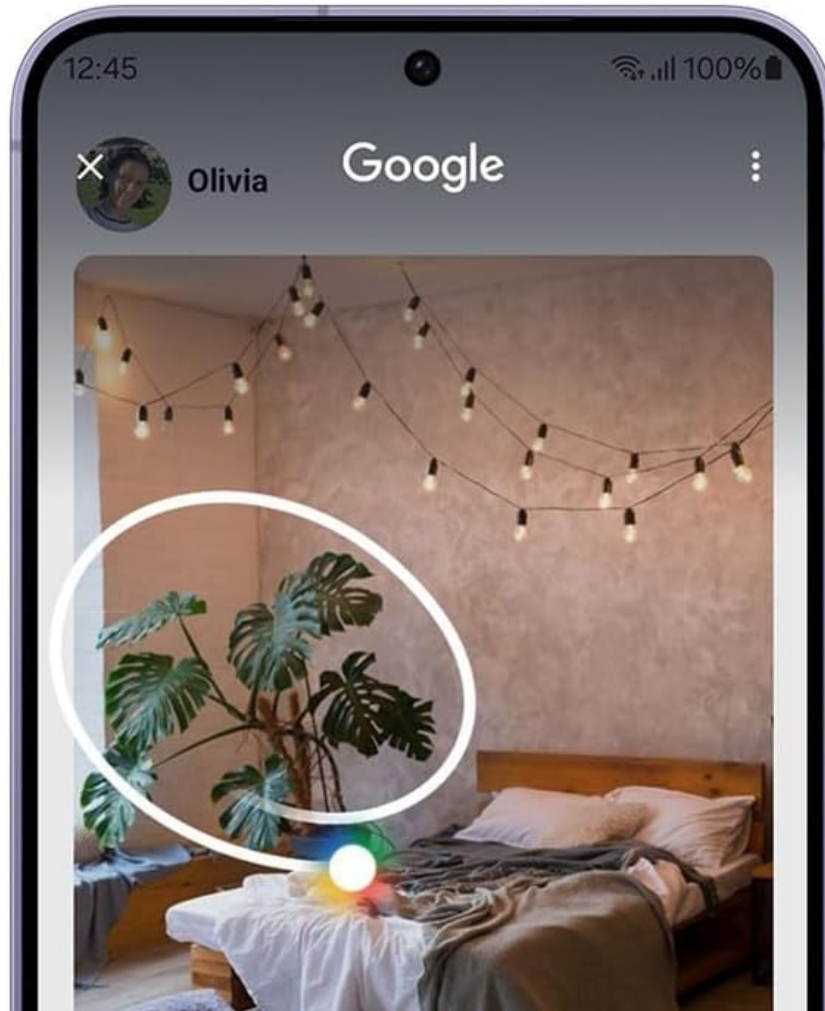
Figure 3: The Circle to Search with Google feature on the Samsung Galaxy S24+ Plus 5G, allowing users to circle an object on screen to search for information.

What's your favorite influencer wearing? Where'd they go on vacation? What's that word mean? Don't try to describe it- use Circle to Search with Google and get the answer in snap. With Galaxy S24+, simply circle it on your screen and learn more.