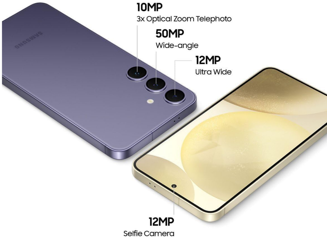
Figure 2: Detailed view of the Samsung Galaxy S24+ Plus 5G camera system, highlighting the 10MP 3x Optical Zoom Telephoto, 50MP Wide-angle, 12MP Ultra Wide, and 12MP Selfie Camera.