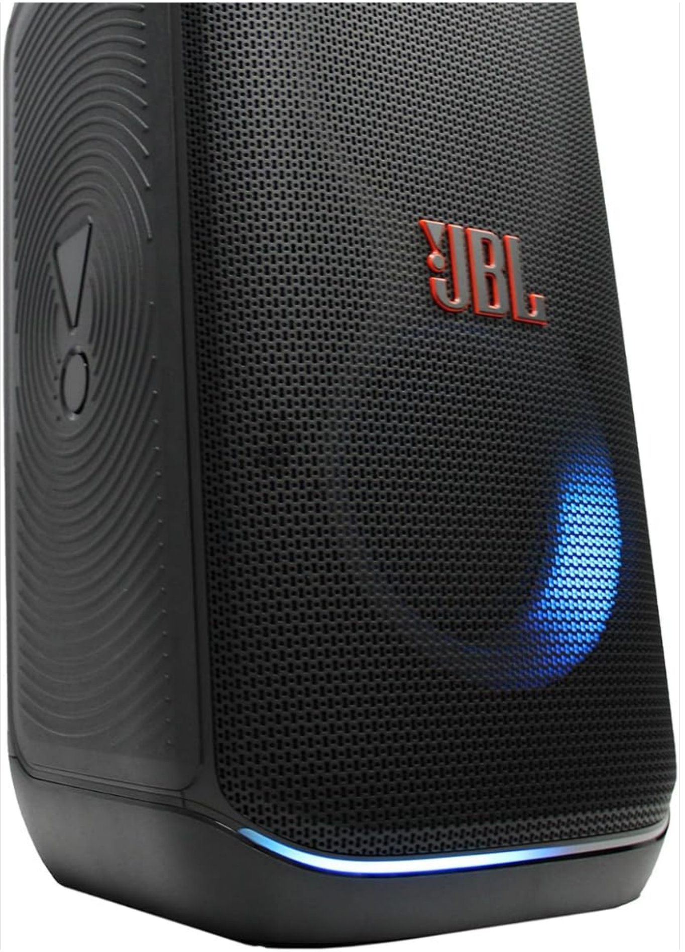
Image: Side view of the JBL PartyBox Club 120 speaker, showing its robust design and a blue light effect.