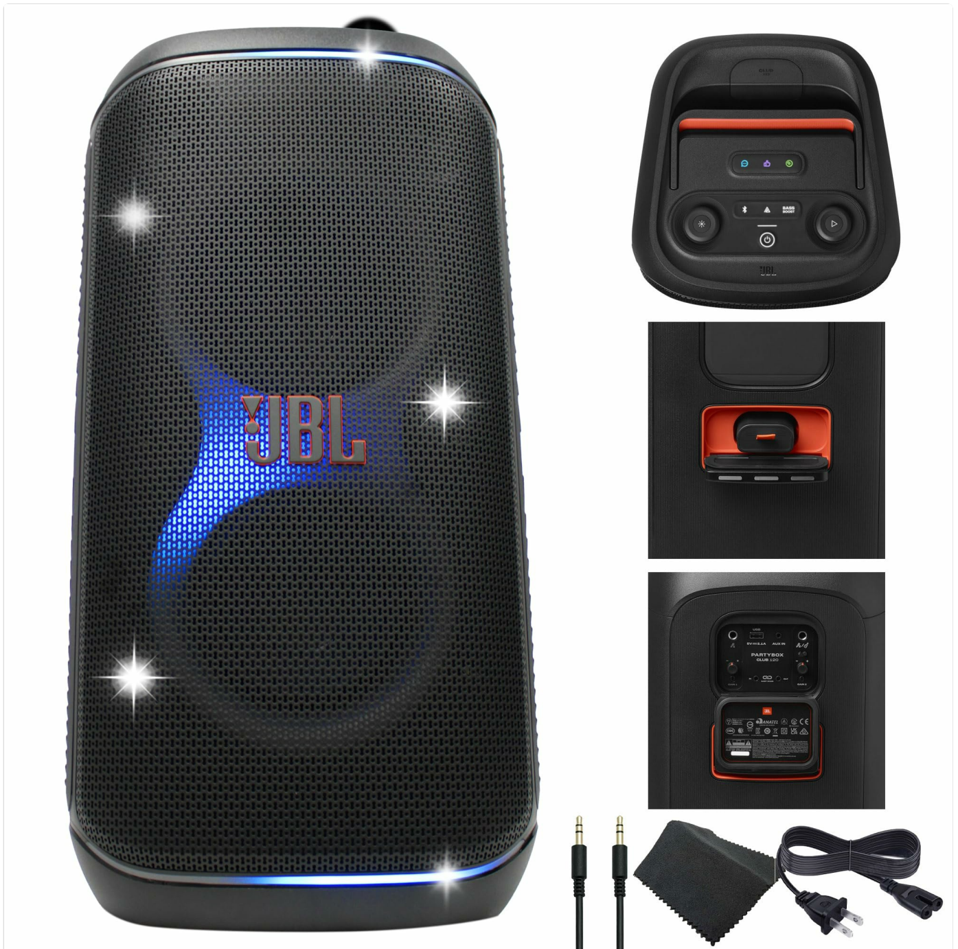
Image: Front view of the JBL PartyBox Club 120 speaker, showcasing its grille and illuminated JBL logo.