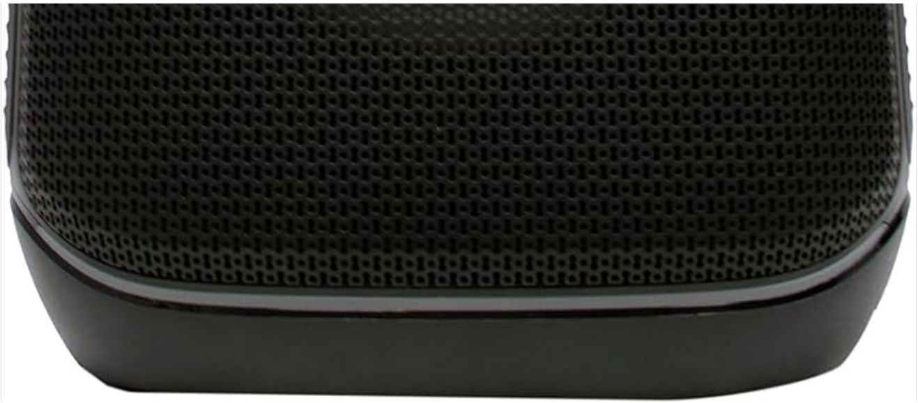
Image: Front view of the JBL PartyBox Club 120 speaker, displaying dynamic multi-color lighting effects.