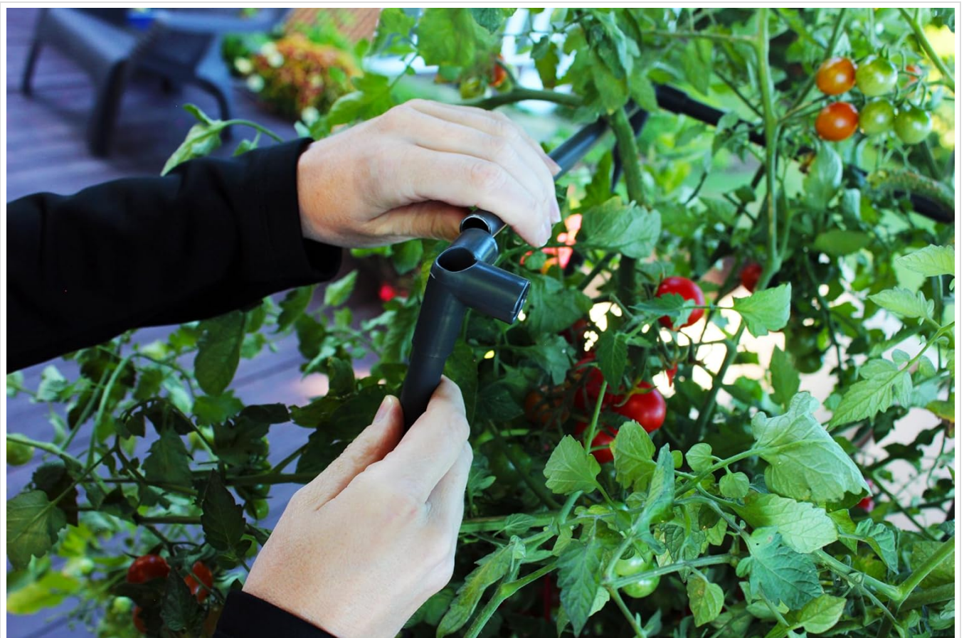
Figure 3: Close-up view of hands connecting a trellis component, demonstrating the snap-together assembly.