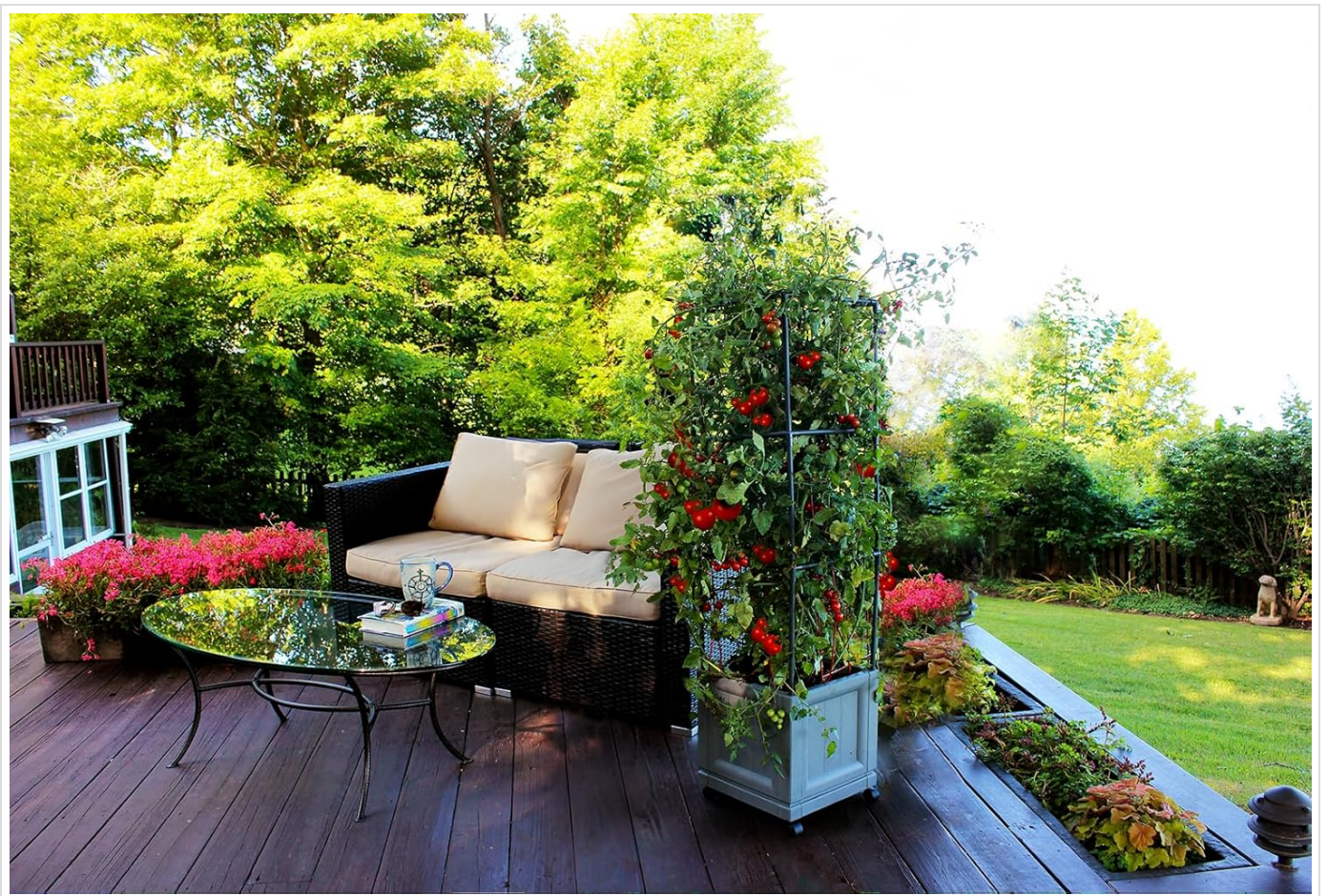
Figure 5: The Trellis Tower positioned on a deck, demonstrating its portability and suitability for various outdoor living spaces.