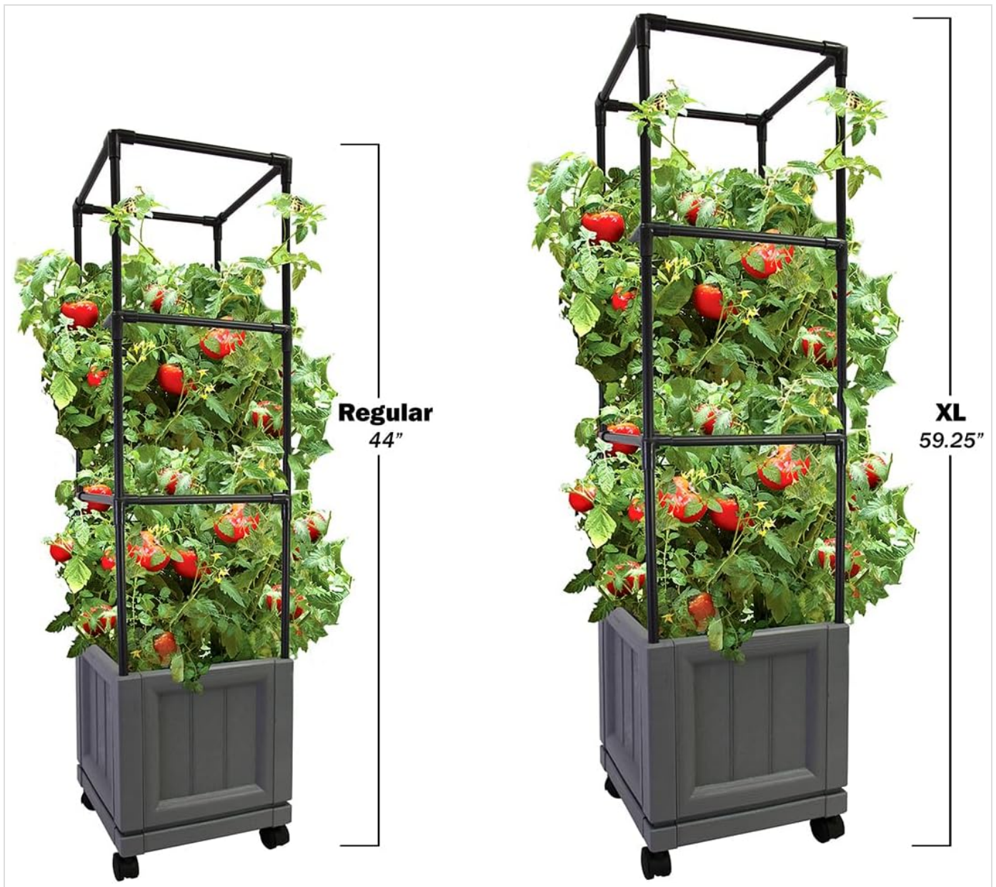
Figure 4: Size comparison between the Regular (44 inches tall) and XL (59.25 inches tall) versions of the Trellis Tower, illustrating the vertical growth support.

Once assembled, the Trellis Tower is ready for soil and planting. The overall dimensions are approximately 11.75"D x 11.75"W x 44.75"H for the Regular size.