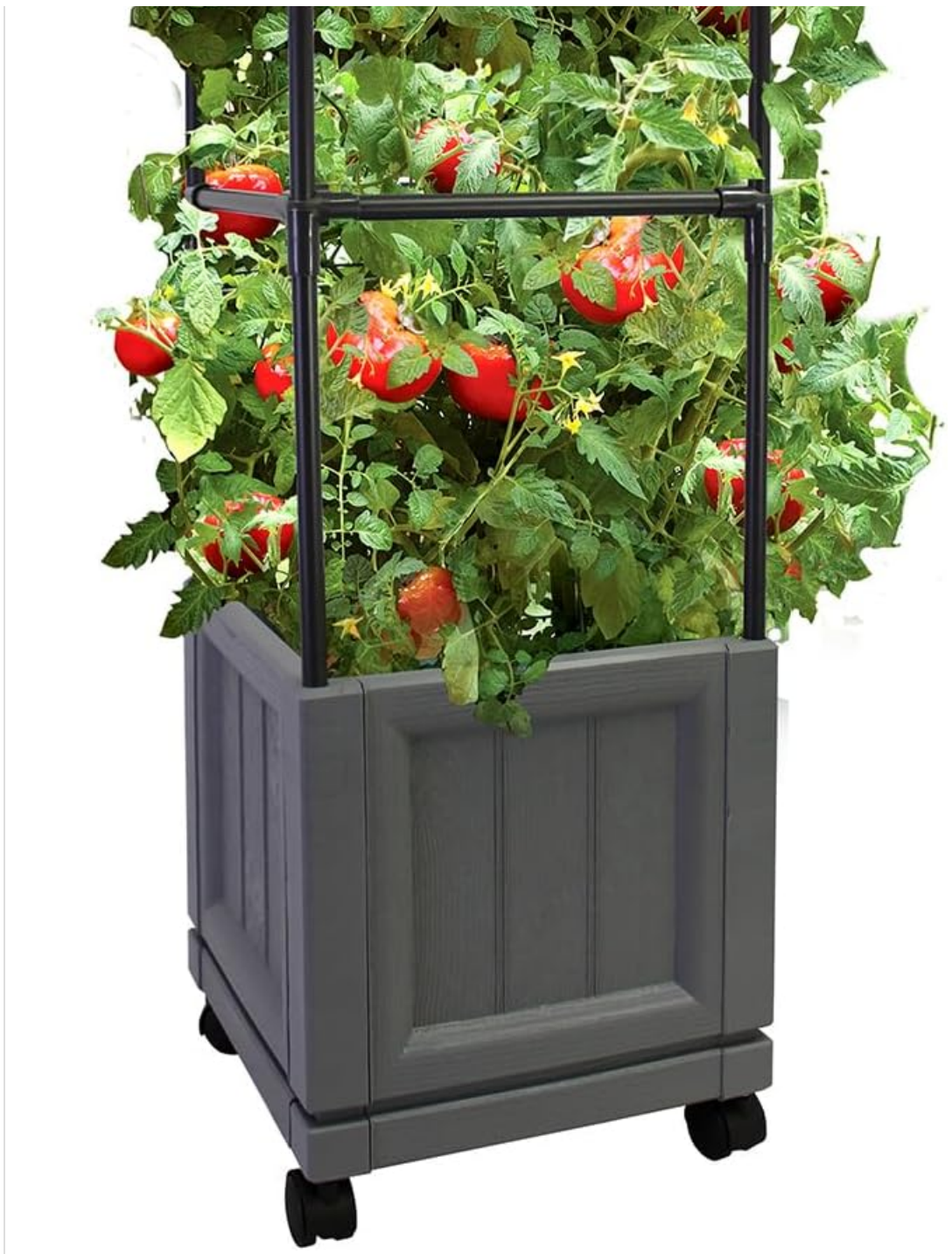
Figure 1: The City Picker's Trellis Tower, showcasing its vertical design and integrated plant support for growing vine plants like tomatoes.