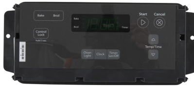
Figure 2: Front view of the Whirlpool W11122560 Oven Control Board, highlighting the user interface with 'Bake', 'Broil', 'Start', 'Cancel', 'Temp/Time', 'Oven Light', 'Clock', and 'Timer Set/Off' buttons.