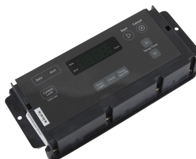
Figure 1: Angled view of the Whirlpool W11122560 Oven Control Board, showing the display and control buttons.

The Whirlpool W11122560 Oven Control Board is a genuine OEM replacement part designed to ensure the proper functioning of your oven's temperature regulation and control panel. It replaces several previous part numbers, ensuring broad compatibility with select Whirlpool oven models.