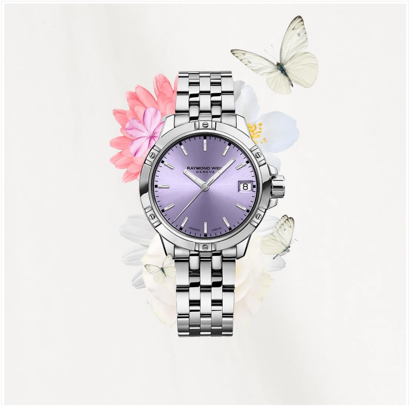
Figure 2.1: Detailed front view of the watch, showcasing the lavender dial with sunray finish, luminous hands, and date window.