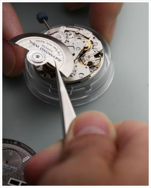
Figure 5.1: Illustration of a watch movement, emphasizing the precision and care required for internal maintenance.