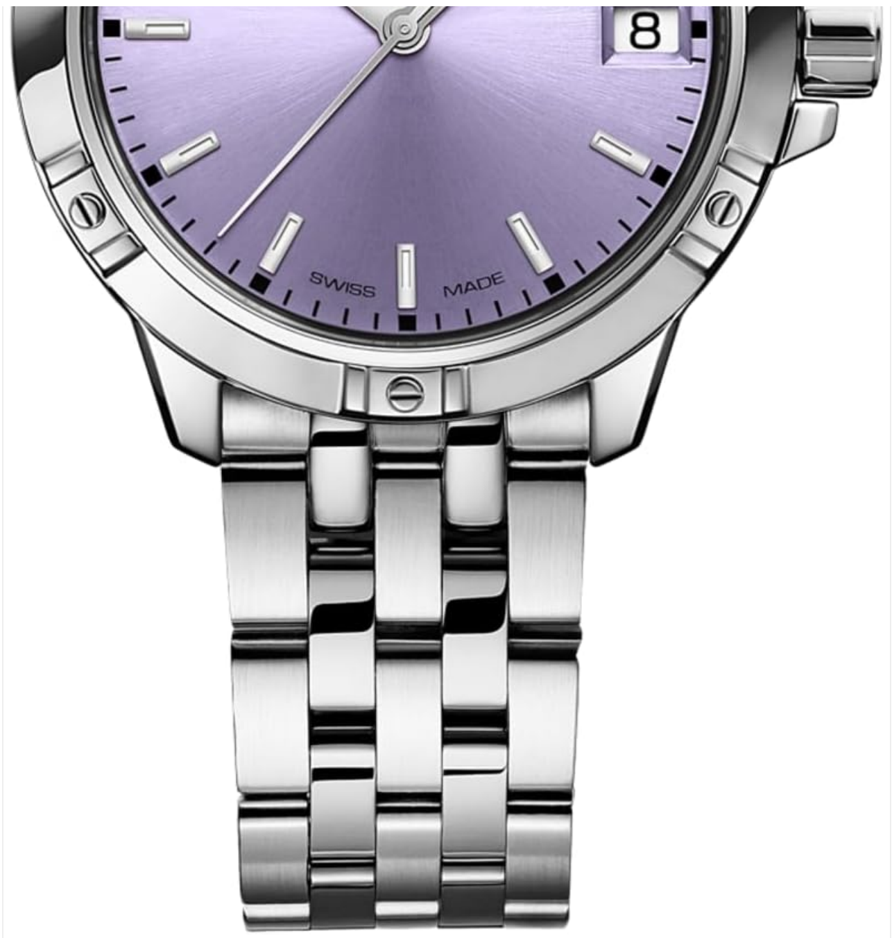
Figure 1.1: Front view of the RAYMOND WEIL Tango Classic Women's Watch. This image displays the watch's lavender dial, stainless steel case, and ergonomic 5-row stainless steel bracelet.