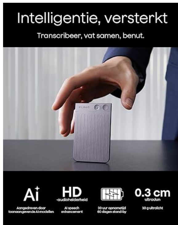
Image: Plaud Note design and battery performance details.