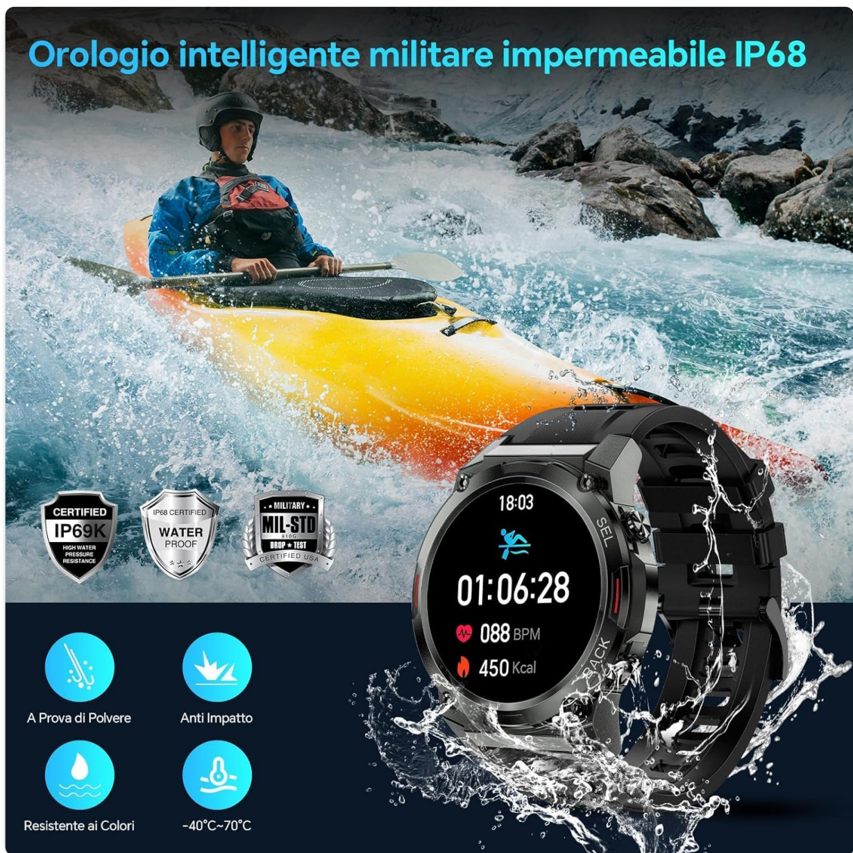
Figure 9: The smartwatch submerged in water, illustrating its IP68 waterproof and dustproof capabilities, suitable for various water activities.