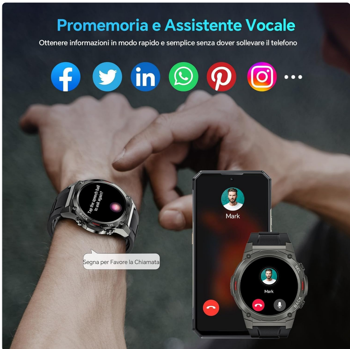
Figure 4: The smartwatch demonstrating its Bluetooth calling capability and displaying icons for various social media notifications.