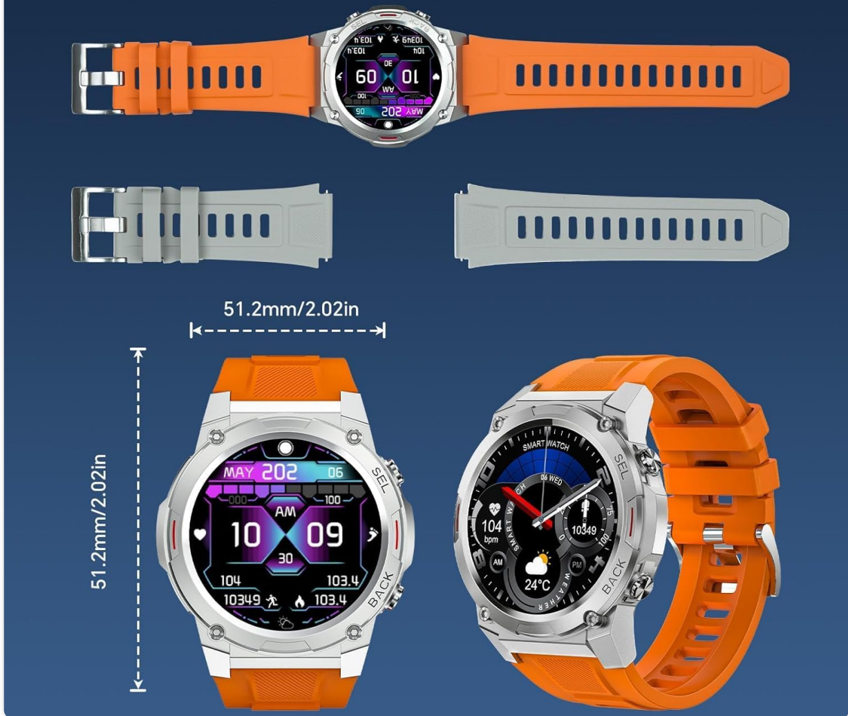
Figure 2: Components of the OBA OUKITEL BT50 package, illustrating the smartwatch body and the two interchangeable strap options.