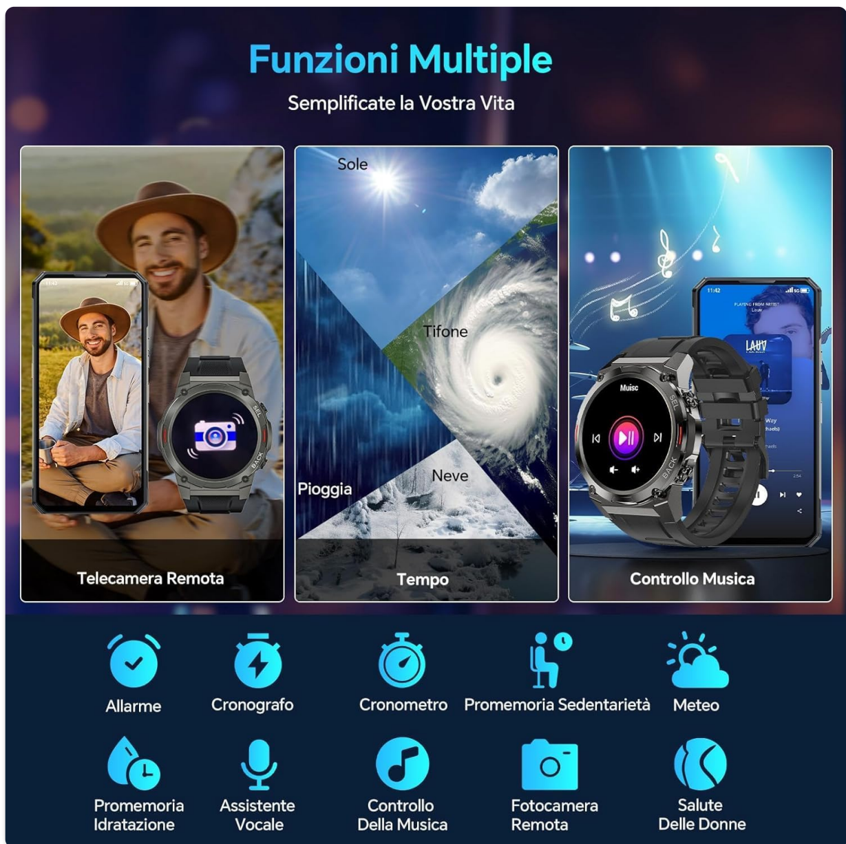
Figure 8: The smartwatch showcasing its multi-functional capabilities, including remote camera control, weather display, and music playback management.