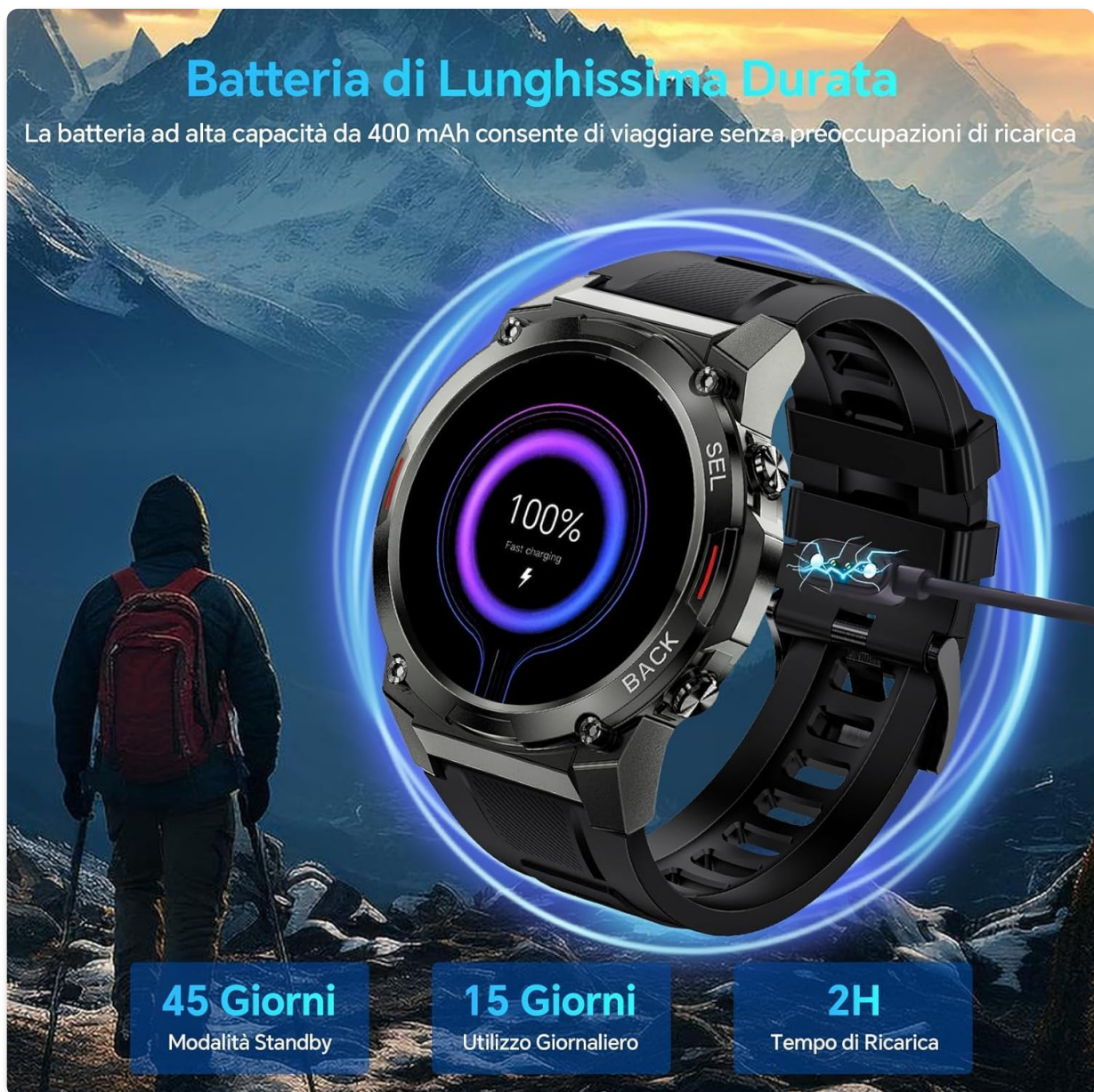
Figure 3: The smartwatch connected to its magnetic charging cable, indicating a full charge and highlighting its extended battery life.