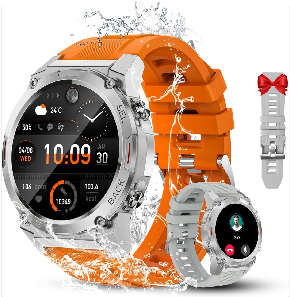
Figure 1: OBA OUKITEL BT50 Smartwatch, showcasing its robust design, vibrant display, and the included white and orange strap options.