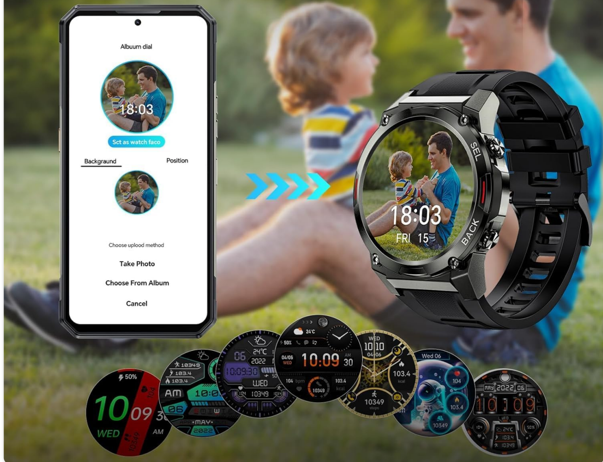
Figure 7: A selection of the 200+ customizable watch faces available for the OUKITEL BT50, demonstrating personalization options.

Con l'app "FitCloudPro" è possibile esplorare una varietà di splendidi quadranti con temi diversi e personalizzare il proprio quadrante!