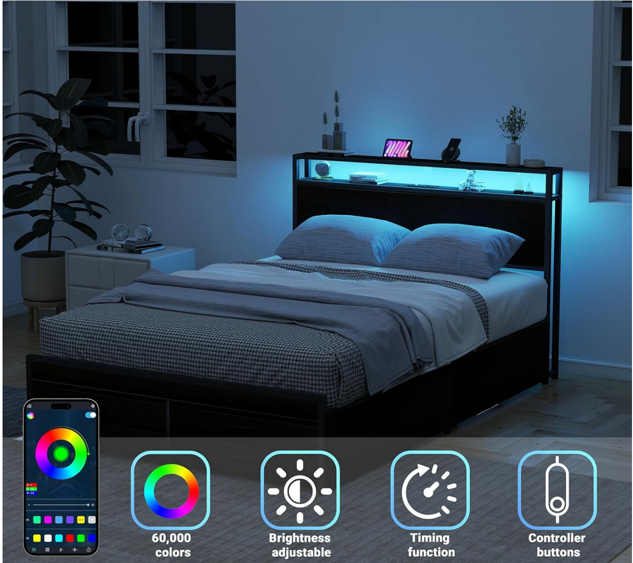
Image: The headboard displaying different RGB LED light colors, with icons illustrating control features.