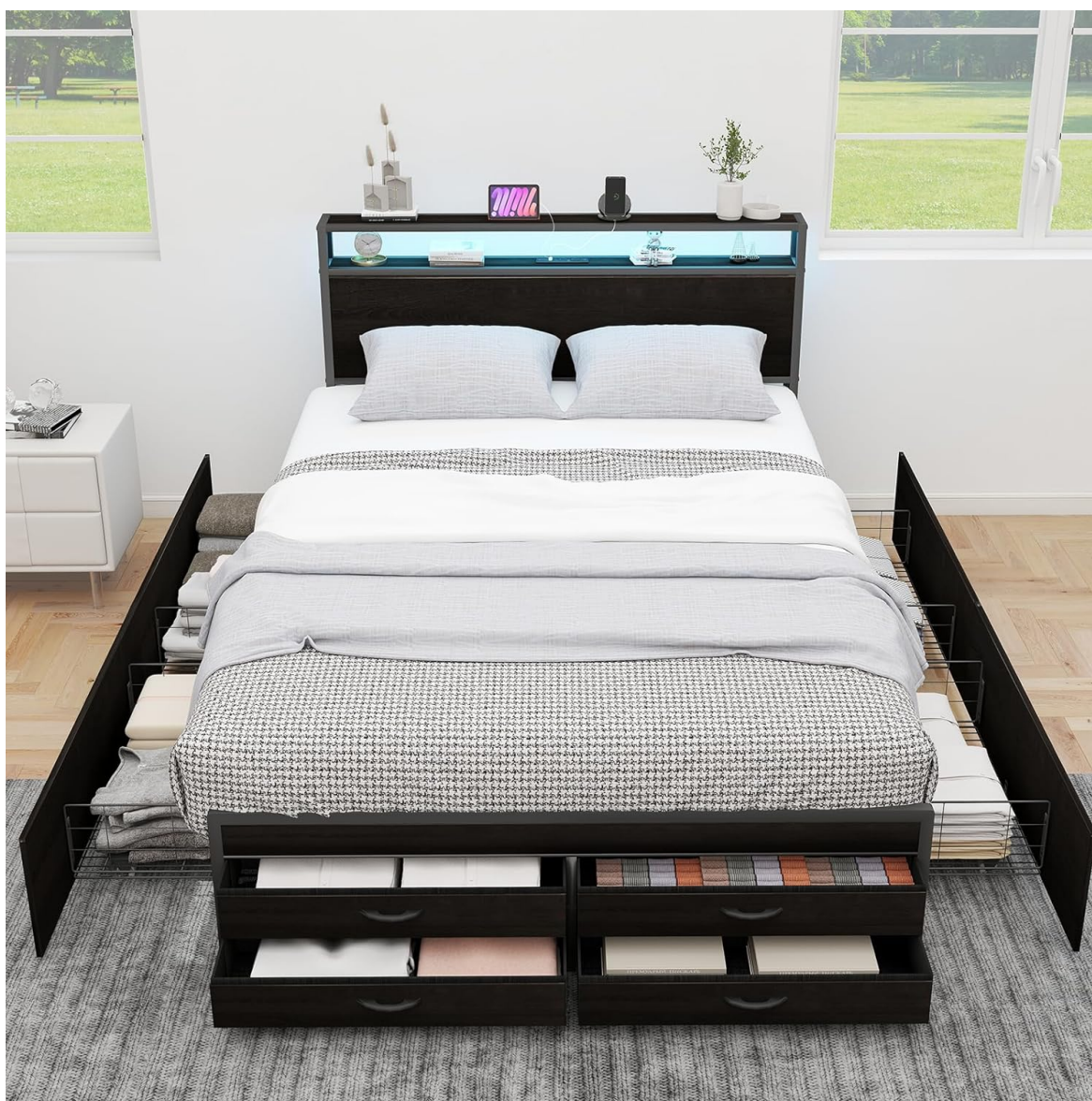
Image: Close-up of the headboard with integrated LED lighting and charging ports.

Attach the headboard sections together, ensuring the charging station and LED light strip are correctly positioned. Connect any necessary wiring for the LED lights and charging ports as per the specific instructions provided with the headboard components.