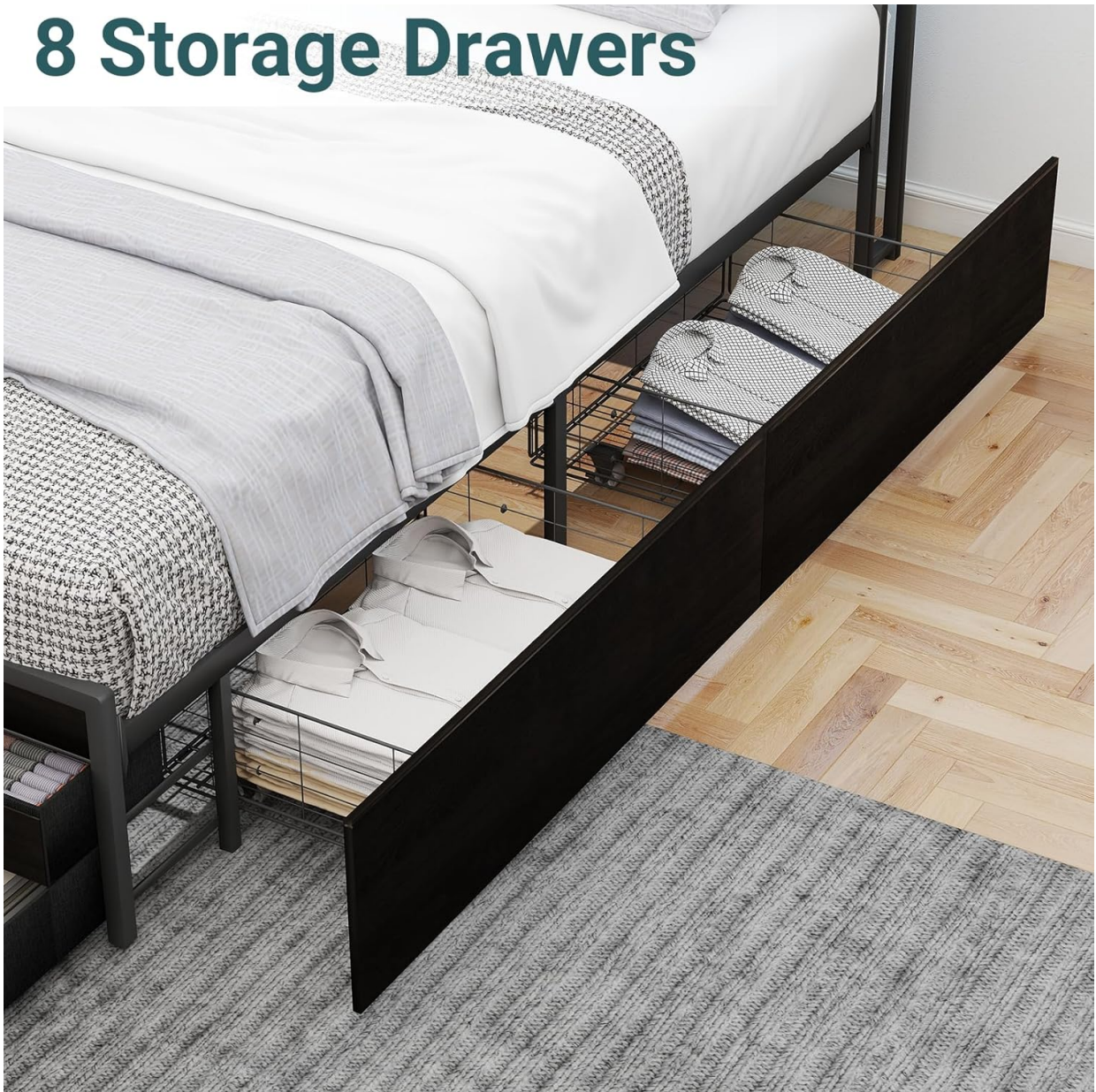
Image: An overhead view of the bed with all eight storage drawers open, revealing organized contents.