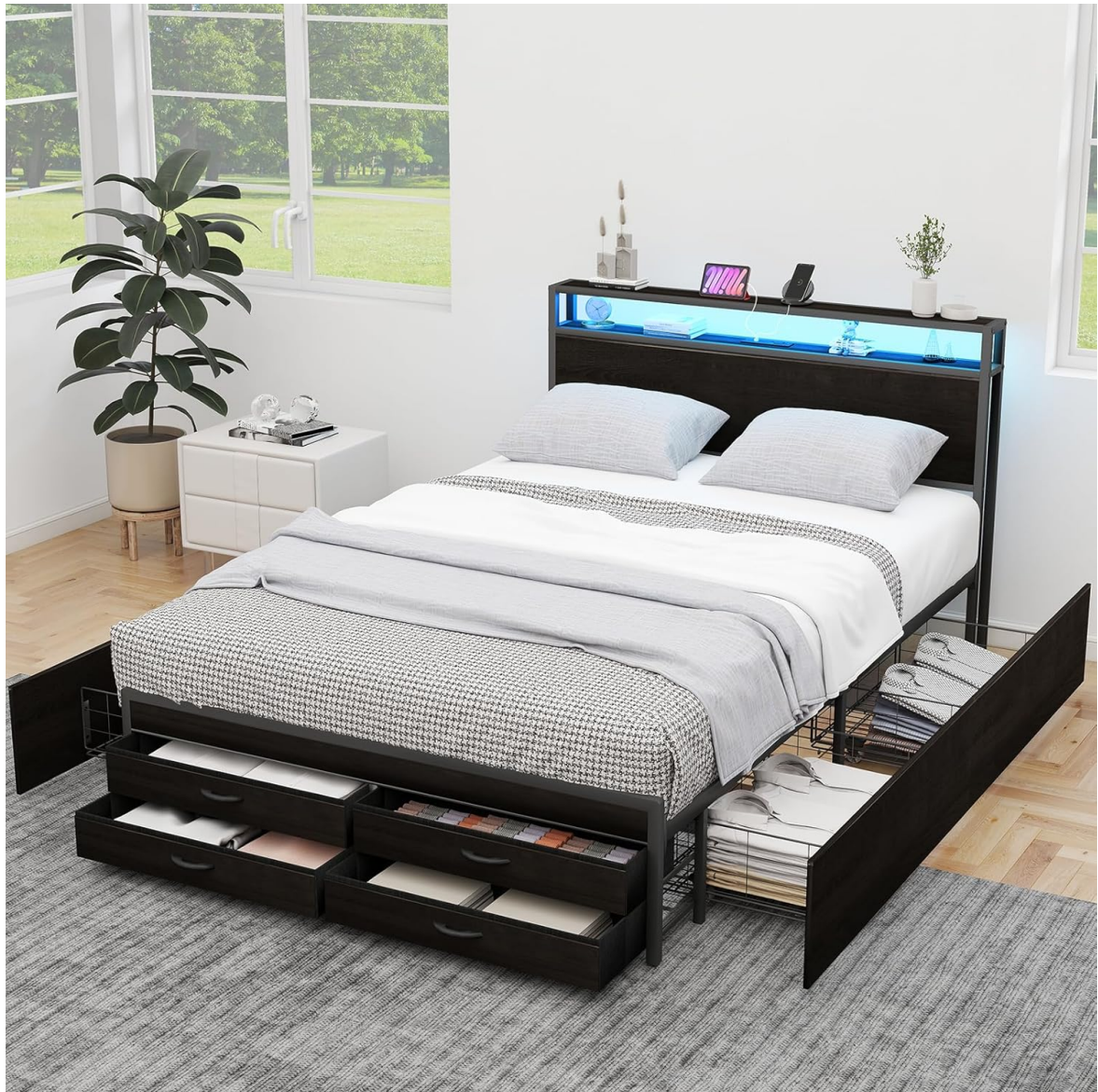
Image: The full bed frame structure with metal slats, ready for a mattress.

Place the metal bed slats across the frame and secure them. Attach any central support legs to ensure stability. The frame is designed to support a mattress directly, eliminating the need for a box spring.