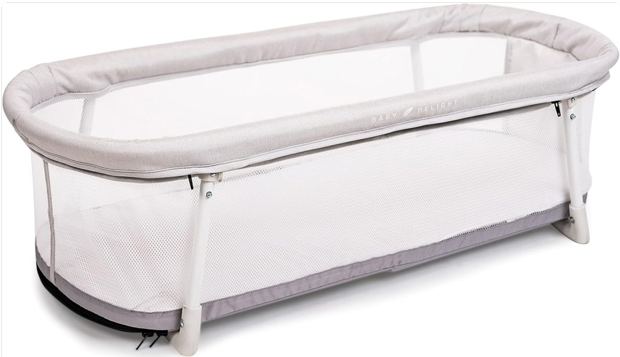
Image: The Baby Delight Snuggle Nest Portable Bassinet, showcasing its compact and breathable design in driftwood grey.

The Baby Delight Snuggle Nest Portable Bassinet is designed to provide a safe, comfortable, and convenient sleeping environment for infants from birth up to 5 months or 20 pounds. Its lightweight and portable design makes it ideal for use at home or while traveling, ensuring your baby always has a familiar and secure place to rest.