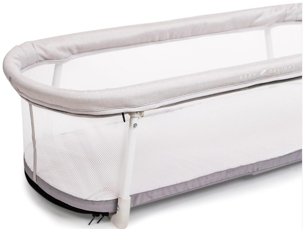
Image: Visual representation of the Snuggle Nest's key features, including airy mesh walls, compact fold capability, and tool-free setup, highlighting its lightweight design.