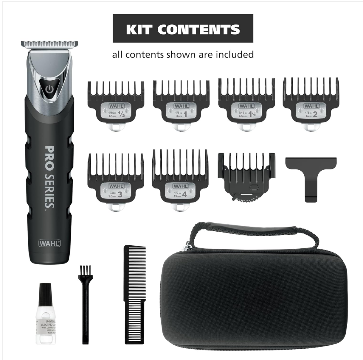
Figure 2: All contents included in the Wahl Pro Series Trimmer kit.