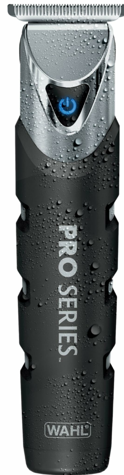
Figure 1: Wahl Pro Series Forever Blade Trimmer, Model 3026017.