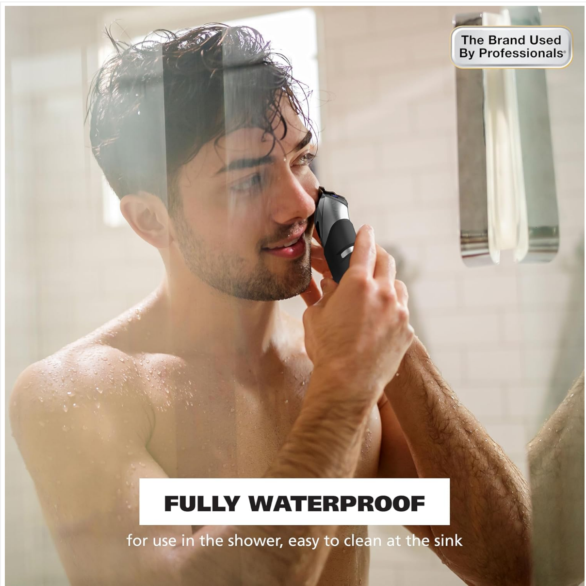
Figure 6: The trimmer is fully waterproof for use in wet conditions.