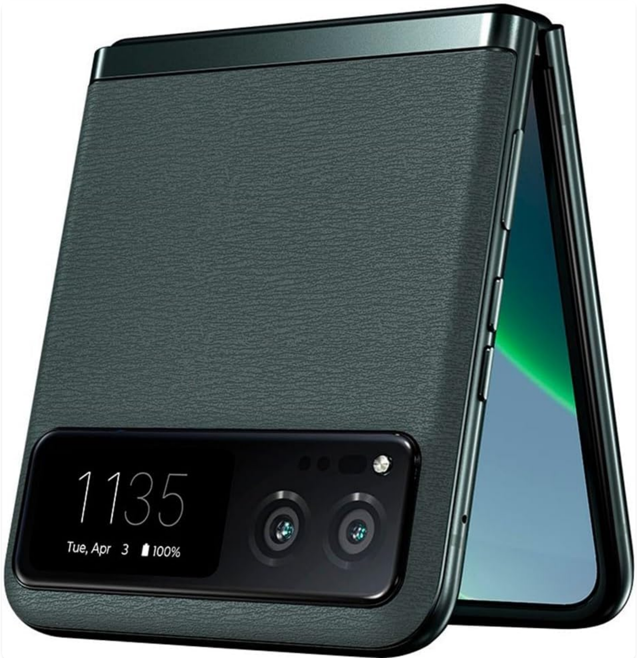
Figure 3.2: The Motorola Moto Razr 40 5G in its folded state, highlighting the functional external OLED display.