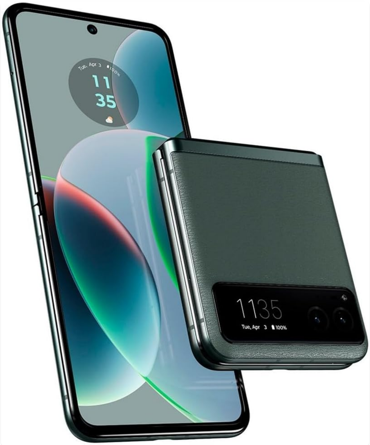
Figure 1.1: Motorola Moto Razr 40 5G, showcasing its foldable design in both open and closed configurations.