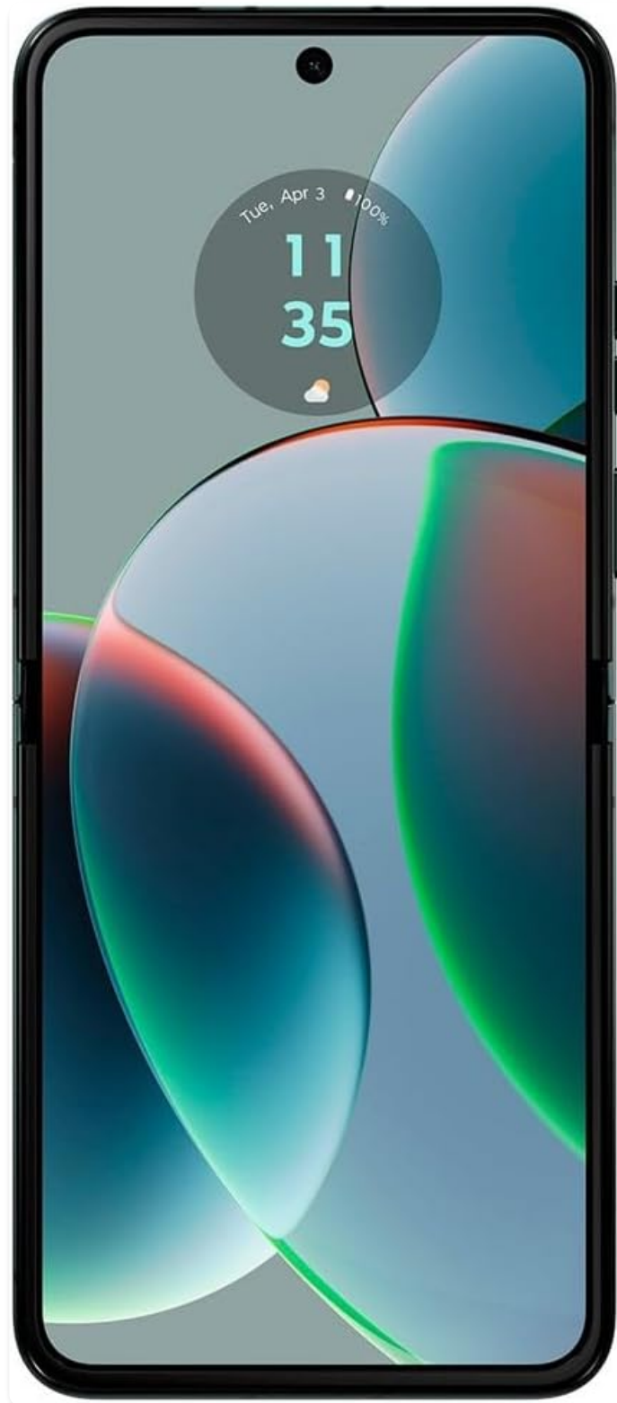
Figure 3.1: The Motorola Moto Razr 40 5G in its fully unfolded state, displaying the main pOLED screen.