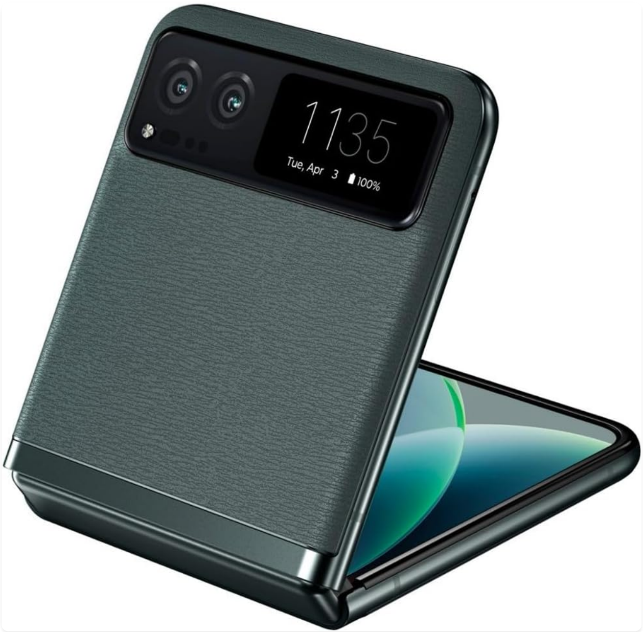
Figure 4.1: The Motorola Moto Razr 40 5G in a partially folded position, highlighting the rear camera module and external display.