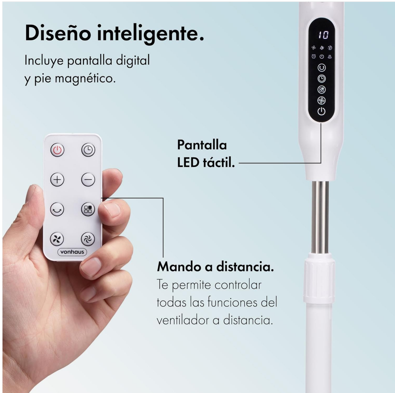
Image: This image displays the fan's LED touch panel, which includes controls for power, speed, mode, timer, and oscillation. It also shows the remote control, which allows for convenient adjustment of all fan functions from a distance.

The fan can be operated using the touch-sensitive LED display on the unit or the included remote control.