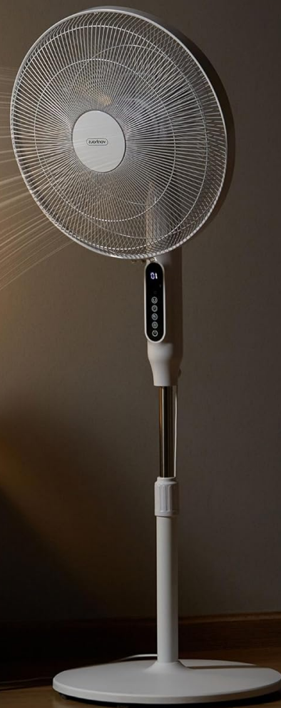
Image: This image depicts the fan in a bedroom, illustrating its three programmed modes: Comfort, Natural, and Night. It emphasizes that the digital display dims in Night mode and the fan operates at a minimum noise level of 35 dB.