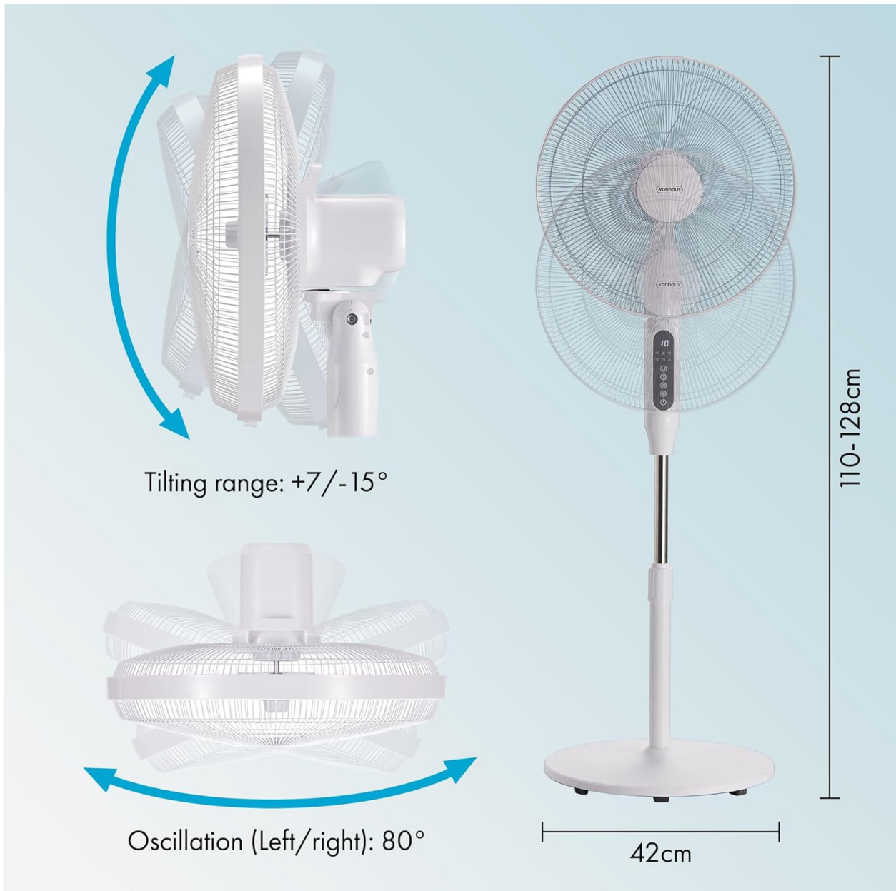
Image: This diagram illustrates the adjustable features of the fan, including its height range of 110-128 cm, a tilting range of +7 to -15 degrees, and an 80-degree left/right oscillation capability. The fan base is 42 cm wide.