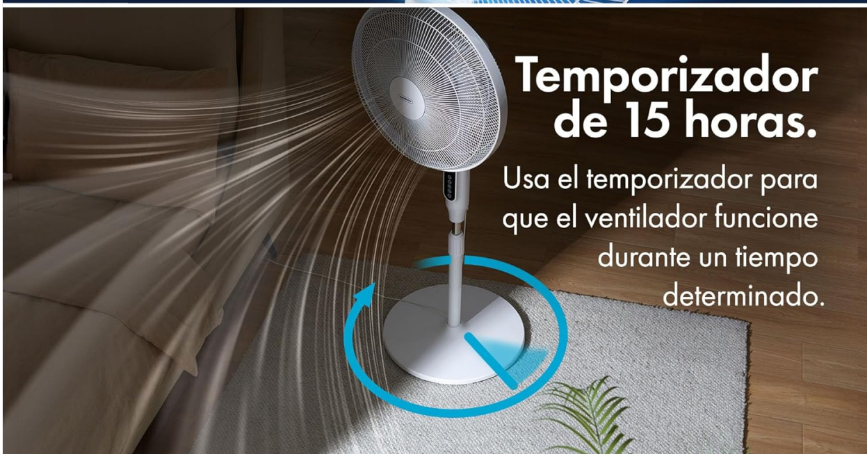
Image: This image highlights the fan's powerful DC motor and its capability to provide 24 different airflow speeds, allowing users to select their desired cooling level. It also references a 15-hour timer function.

Usa el temporizador para que el ventilador funcione durante un tiempo determinado.