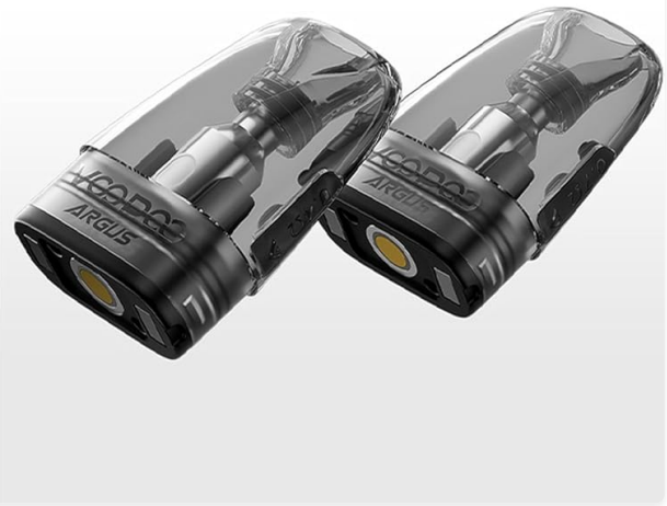
Image 5.2: The side slider for airflow adjustment and a view of the two available cartridge types.

煙量が多く、濃厚な味わいが楽しめる 0.4Ωと、煙量が控えめで落ち着いた 味わいの0.7Ω。2種類のPODが付属。 出力やエアフローを調整しながら、 自分だけの「美味しい」を追求可能。