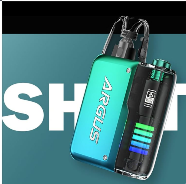
Image 5.1: The ARGUS P2 offers both precise Power Mode and simplified Shift Mode for output adjustment.

POWERモードの他に、3つのプリセットを 切り替えて出力を調整する「SHIFTモード」 も搭載。POWERモードよりもお手軽、 直感的な操作が可能のため、初心者の 方に超おすすめのモードです。