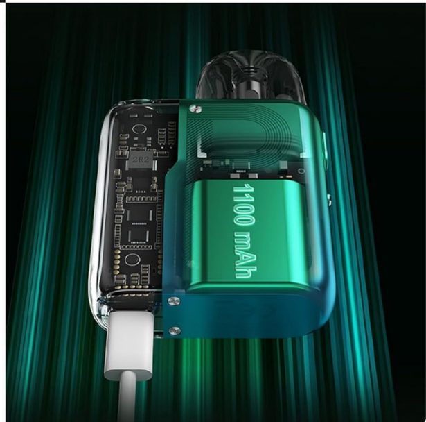
Image 4.1: The ARGUS P2 device is available in multiple color options.

コンパクトなボディの中に大容量の1100mAhバッテリーを搭載。一度の充電でたっぷり長持ちします。お持ち運びやロングドライブのお供としてもおすすめです。