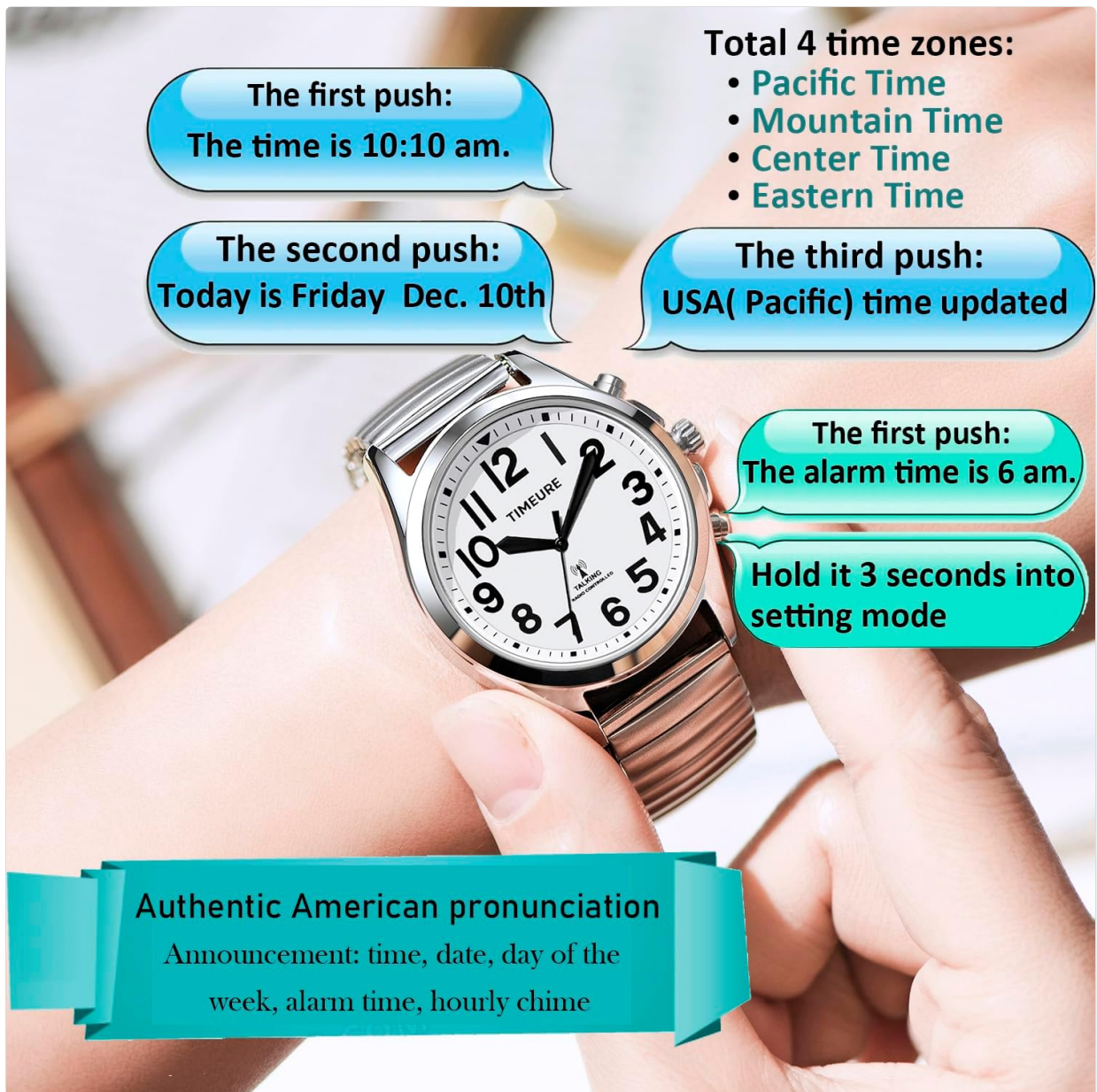
Image: Overview of the TIMEURE Talking Watch highlighting its multi-functional features for daily needs.