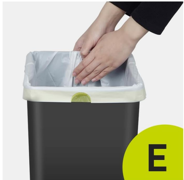
Image: Illustration of the internal bag fixer mechanism, ensuring trash bags are neatly secured without unsightly overhang.