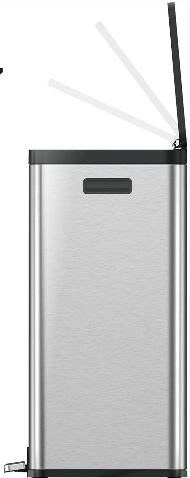
Image: Visual representation of the soft-close lid mechanism, demonstrating its smooth and silent operation.