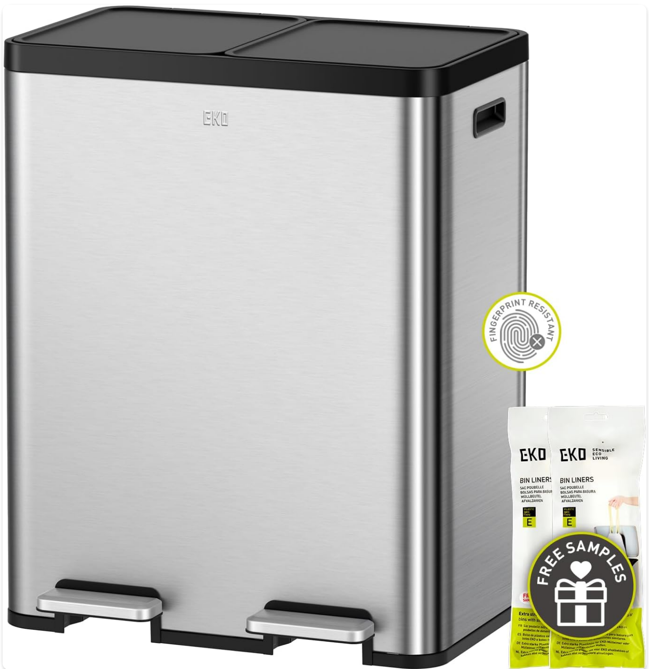
Image: The EKO Essential Dual Trash Can in brushed stainless steel, showcasing its sleek design and dual pedal system.