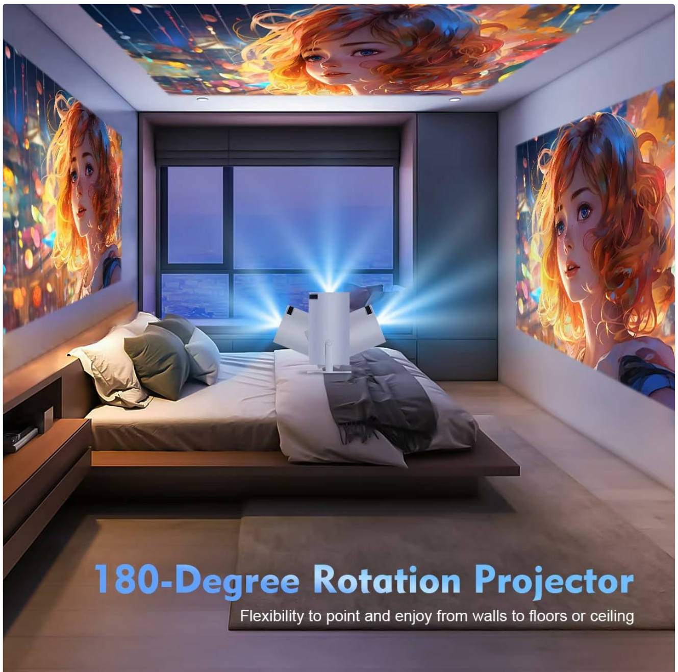
Image: The HY300 Pro projector positioned in a bedroom, demonstrating its 180-degree rotation capability by projecting an image onto the ceiling, offering flexible viewing angles.