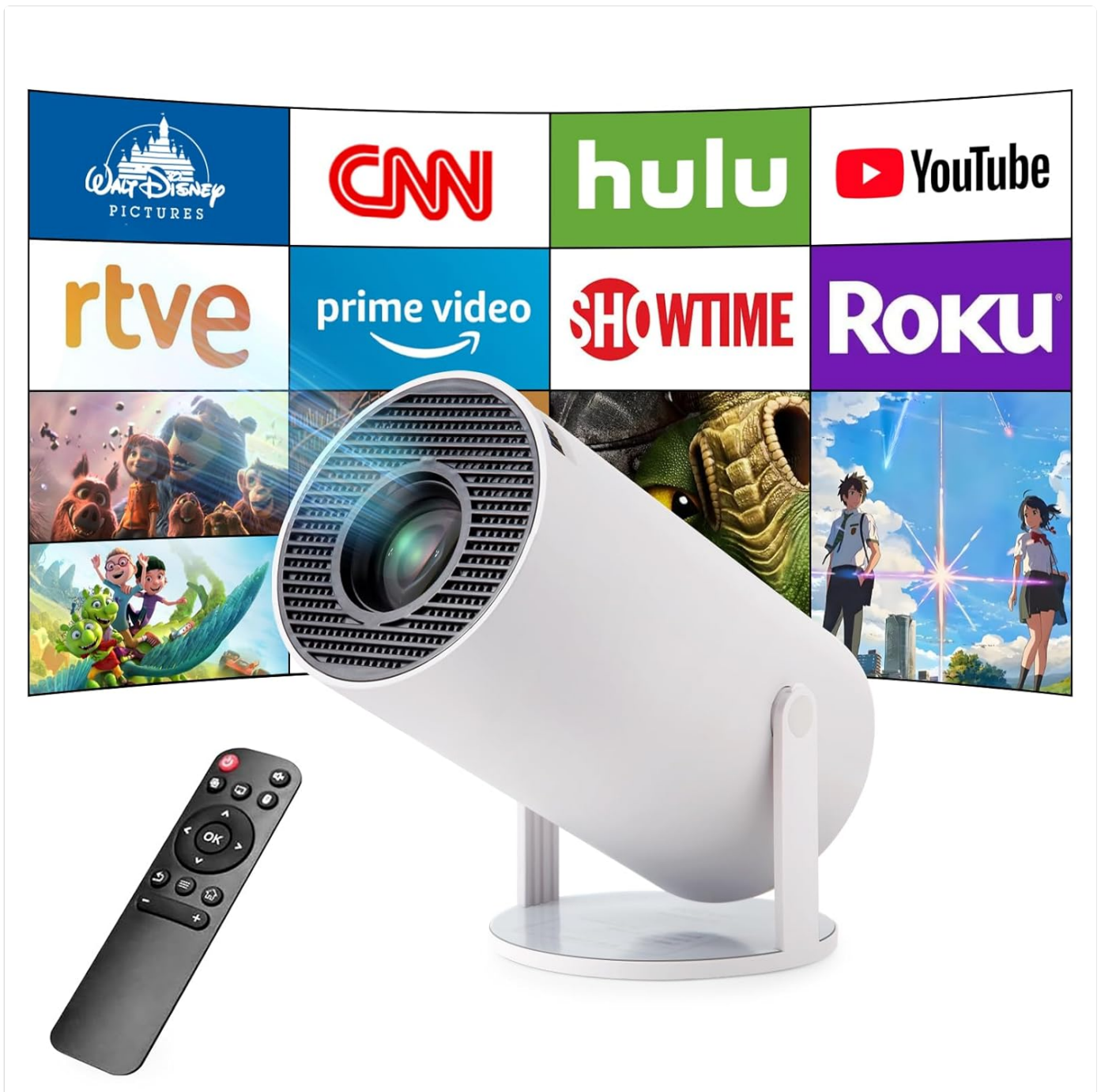
Image: The Astarama HY300 Pro projector, its remote control, and a projected screen displaying various streaming service icons, illustrating its smart capabilities.