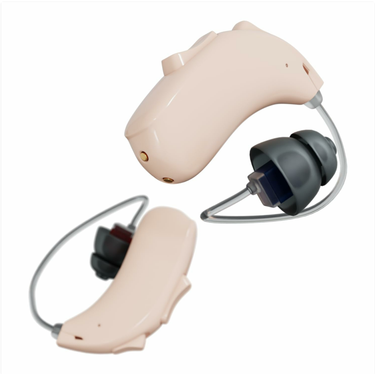
Image: Close-up view of the Audien ION hearing aids, showing the compact design and the ear tube with attached ear tip.