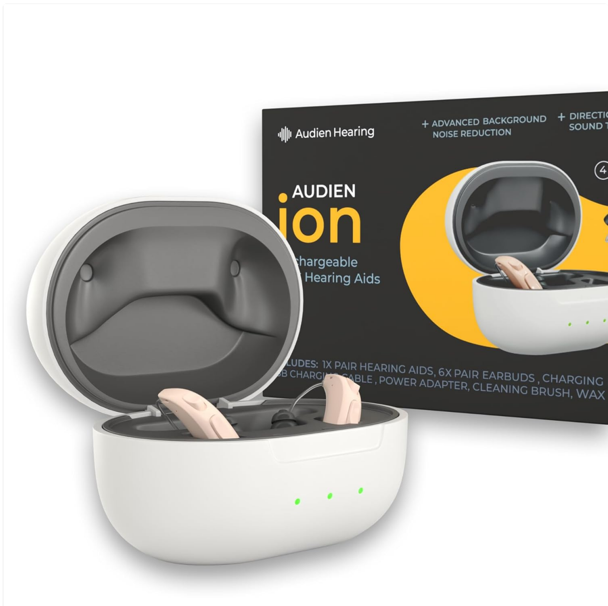
Image: Audien ION hearing aids in their charging case, alongside the product packaging. This illustrates the complete product set.