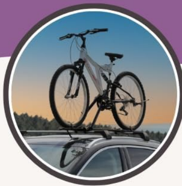
UNIVERSAL BIKE CARRIER