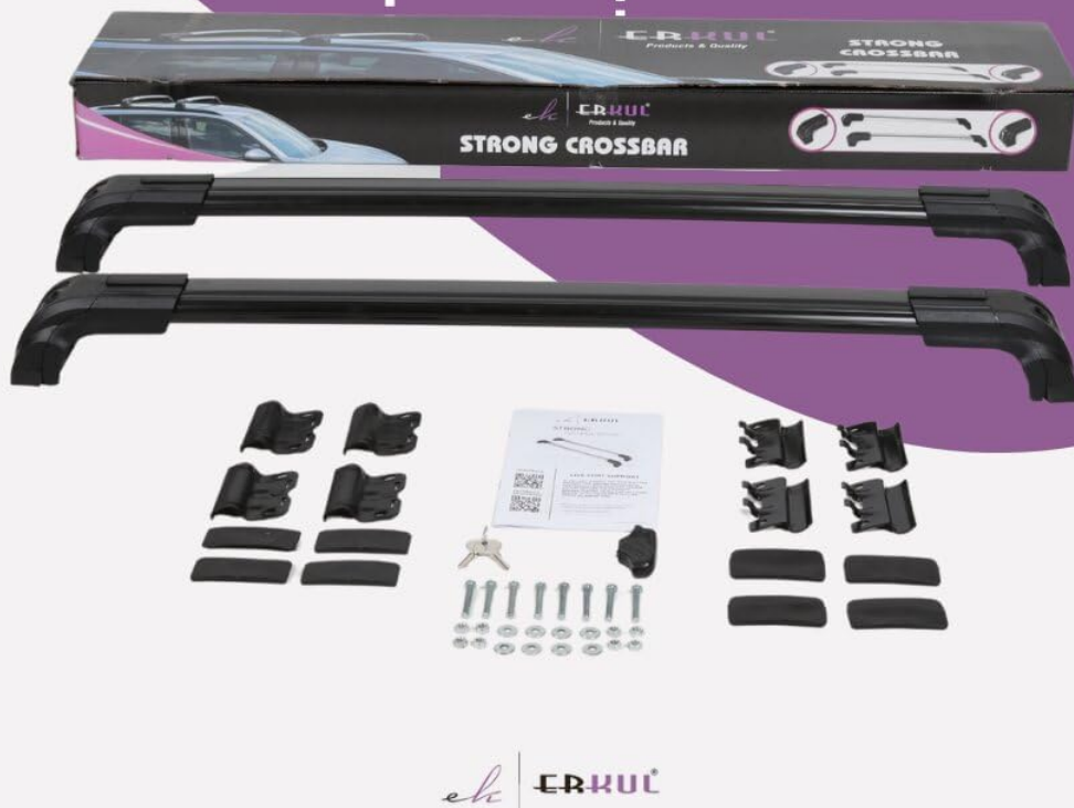
Image: The complete contents of the ERKUL Roof Rack Cross Bars package, showing the two crossbars, a set of keys, various mounting hardware components, and the instruction manual.

Your ERKUL Heavy Duty Roof Rack Cross Bars package includes all necessary components for installation: