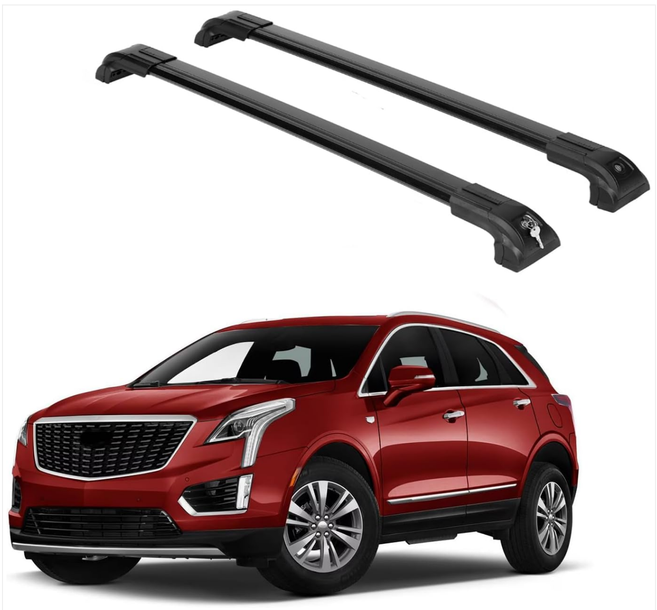
Image: A red Cadillac XT5 showcasing the sleek and integrated appearance of the installed ERKUL Heavy Duty Roof Rack Cross Bars, ready to transport cargo.