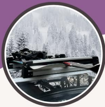
UNIVERSAL SKI CARRIER