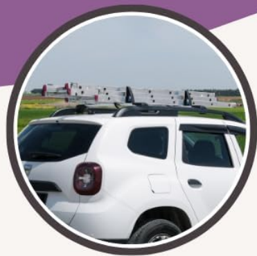
UNIVERSAL LOAD STOP