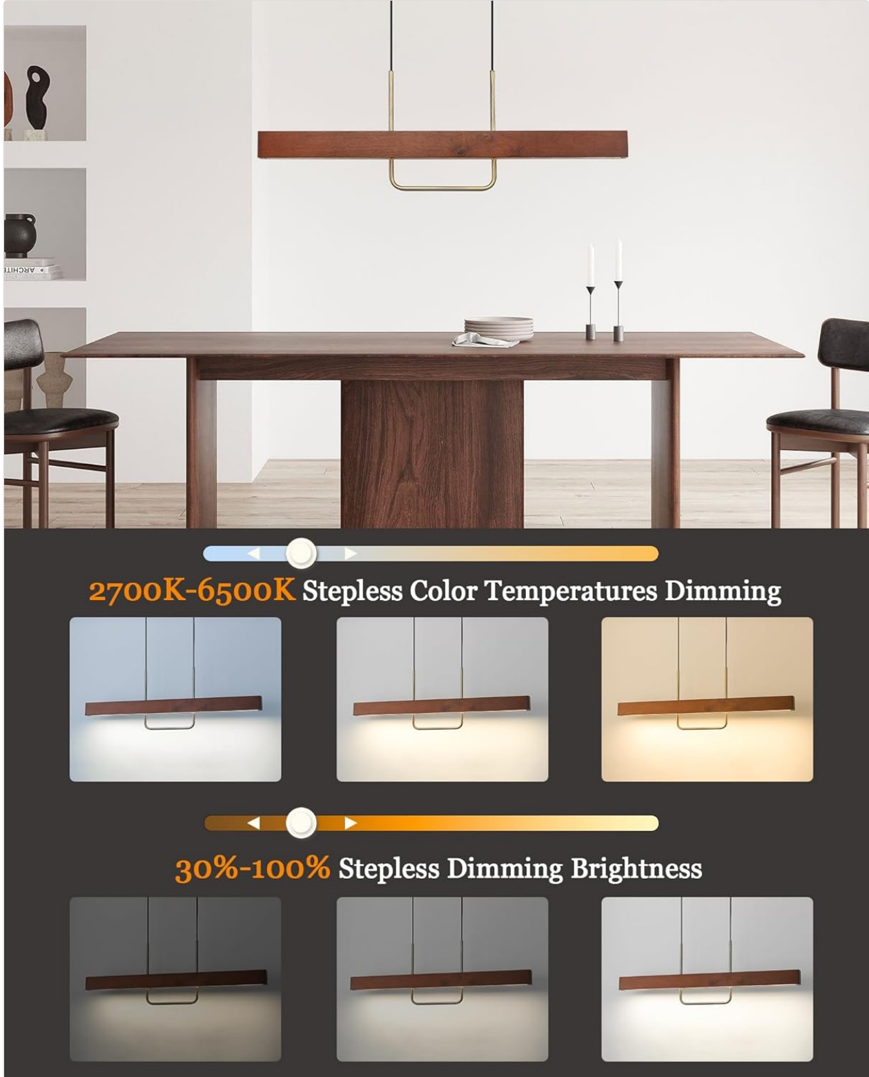
Figure 4: Visual representation of the stepless dimming and color temperature adjustment capabilities.

Memory Function: The fixture retains the last brightness and color temperature setting when turned off and on, whether by remote or touch.