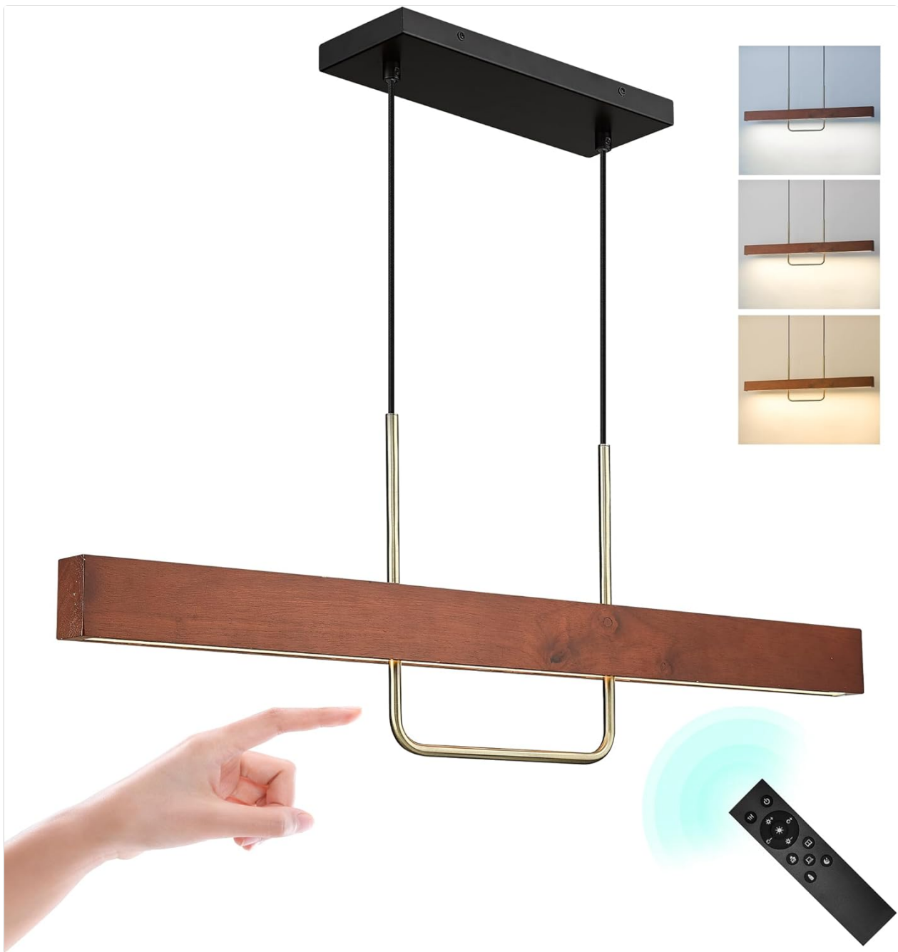
Figure 1: ELYONA 35.5-inch Wood Linear LED Pendant Light, showcasing its design, remote control, and touch sensor functionality.