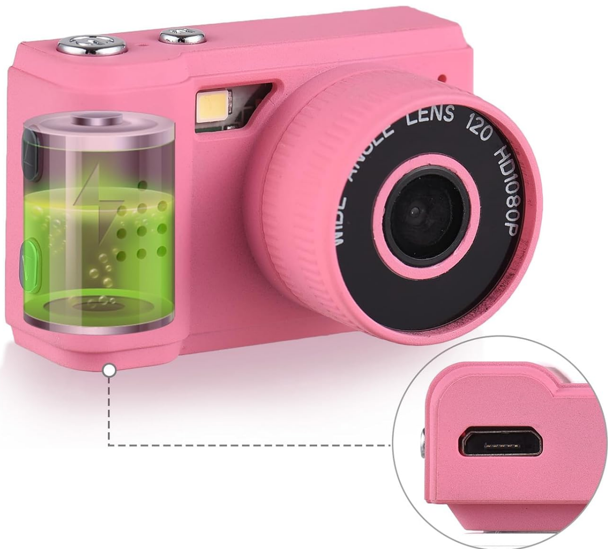
Image: Illustration of the camera's built-in rechargeable battery and the location of the USB charging port.

Long working time and can be recharged via USB interface