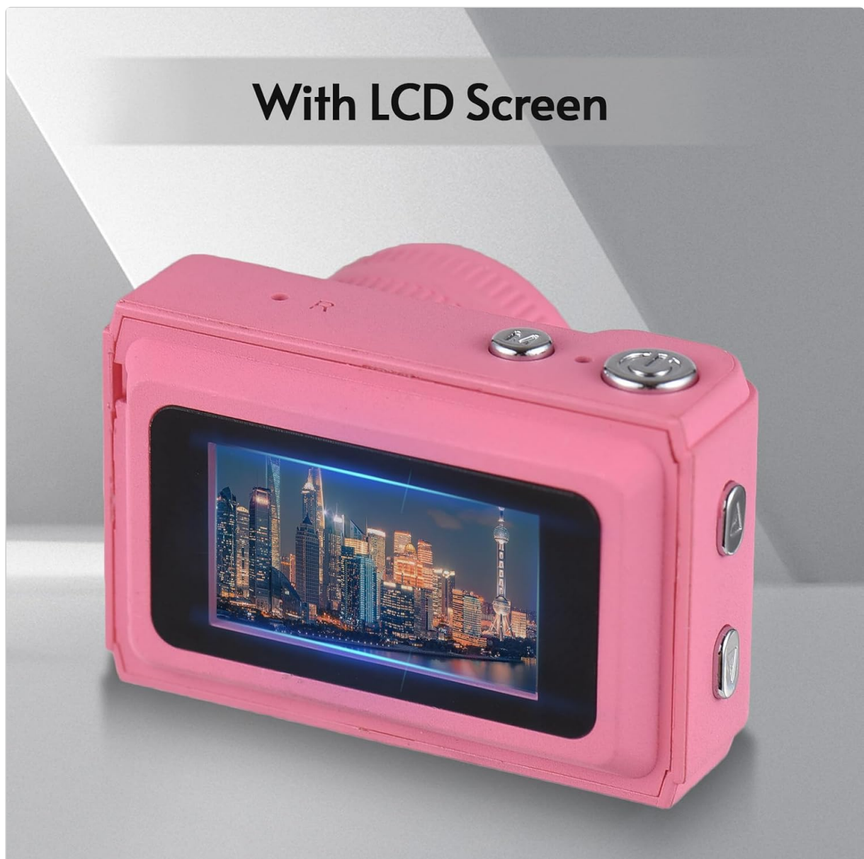
Image: The camera's rear view, highlighting the LCD screen for framing and reviewing shots.