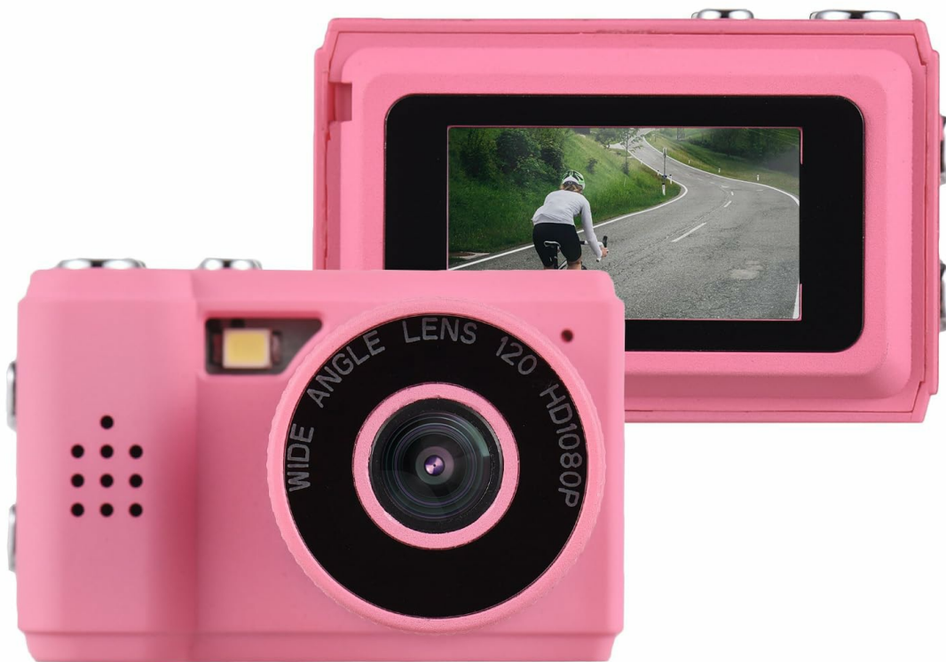
Image: The Andoer Mini Compact Digital Camera, demonstrating its compact size when held in a hand.