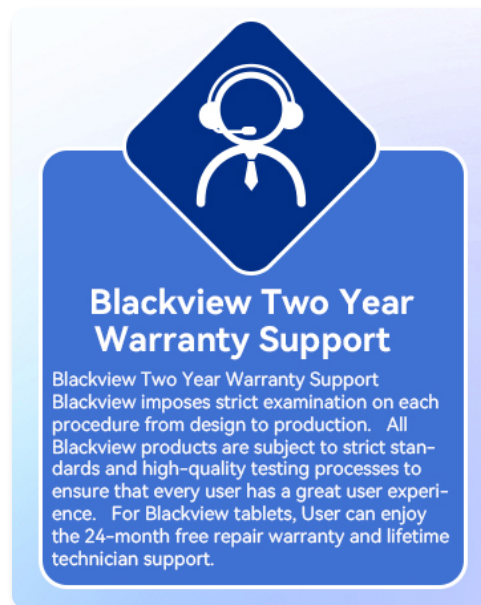
Figure 8.1: Blackview offers a 2-year warranty and lifetime technical support.