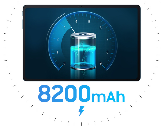
Figure 5.1: The 8200mAh battery ensures extended usage without frequent recharging.