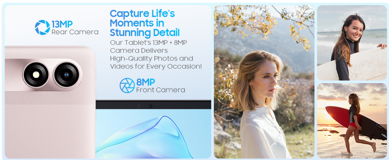
Figure 4.2: The 13MP rear camera and 8MP front camera capture moments in stunning detail.

The tablet is equipped with a 13MP rear AI camera and an 8MP front camera. The camera app allows you to switch between photo and video modes, adjust aspect ratios, and fine-tune focus and brightness. The AI features enhance portrait clarity and image realism.