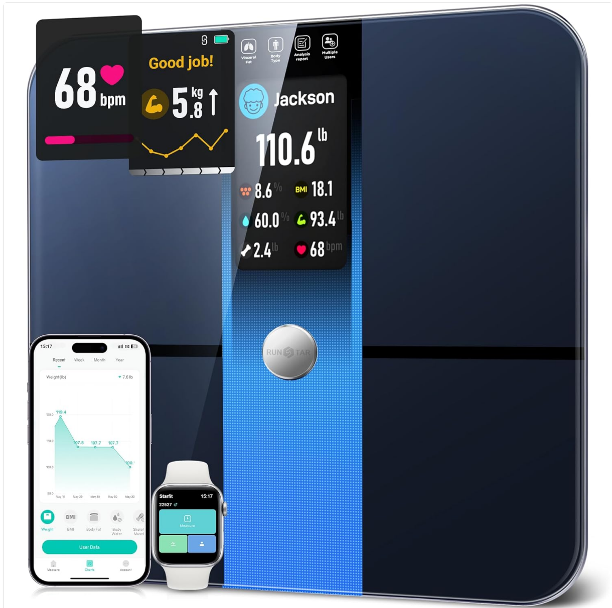
Figure 1: RunStar FI2019G Smart Body Composition Scale. This image shows the sleek design of the scale with its digital display and blue accent.

Your browser does not support the video tag.