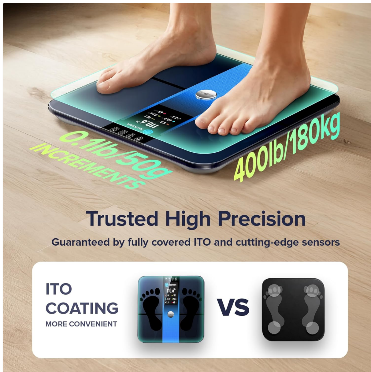
Figure 3: Trusted High Precision Measurement. This image shows feet properly placed on the scale's ITO-coated surface for accurate readings.