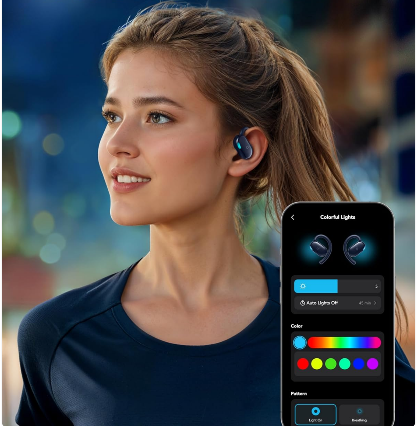
Image: A person wearing the soundcore V20i headphones, demonstrating the customizable LED lights feature, with a phone screen showing the app's light customization options.