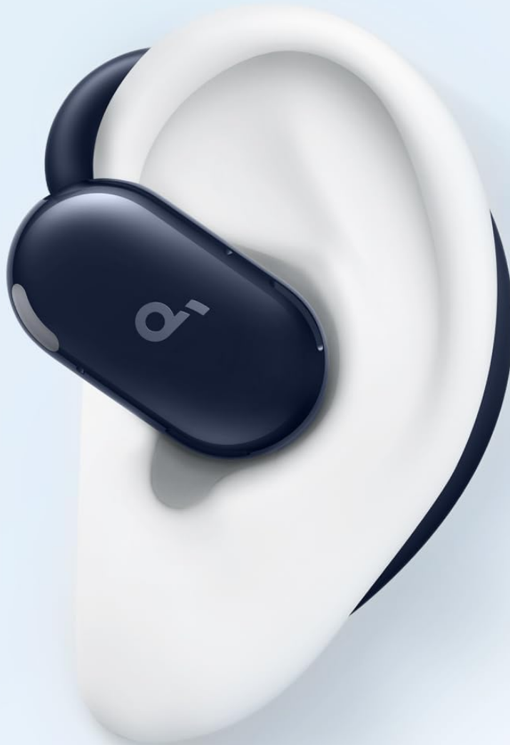
Image: A close-up of the soundcore V20i earbud worn on an ear, highlighting its open-ear design for comfort.