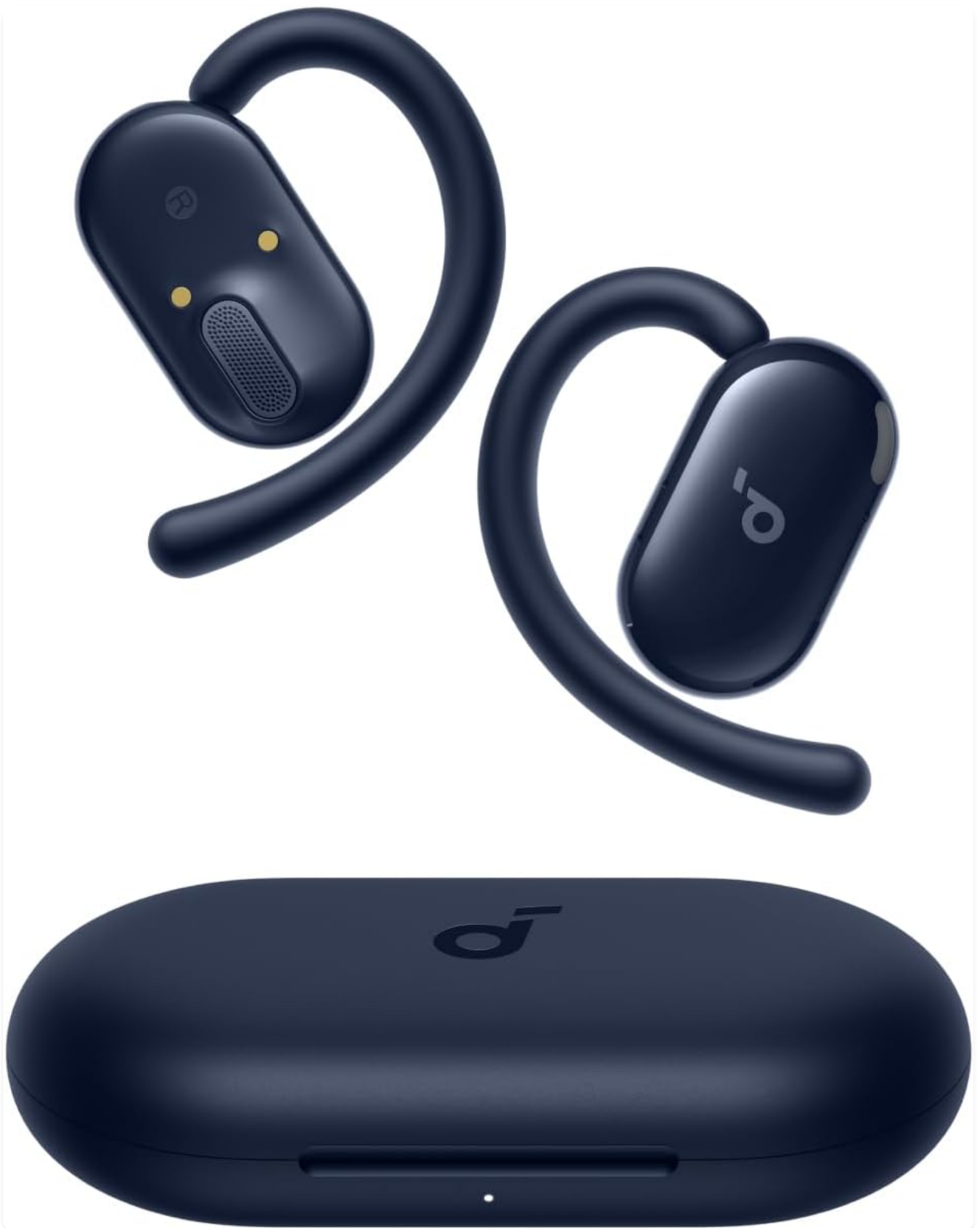
Image: soundcore V20i Open-Ear Headphones and their charging case, showcasing the blue color variant.