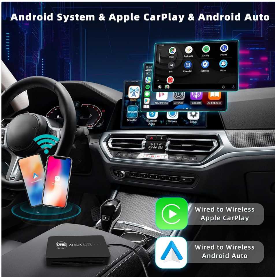
Figure 8: Overview of the Android System, Apple CarPlay, and Android Auto interfaces on a car's display.