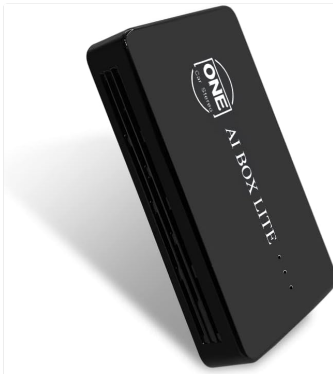
Figure 1: OneCarStereo Ai Box Lite device.

The OneCarStereo Ai Box Lite is an advanced wireless adapter designed to enhance your in-car entertainment and connectivity. It converts your original car's wired CarPlay system into a wireless one, and also supports wireless Android Auto. Additionally, it features built-in YouTube and Netflix applications, allowing you to stream video content directly on your car's display. This manual provides detailed instructions for setup, operation, and troubleshooting to ensure optimal use of your device.