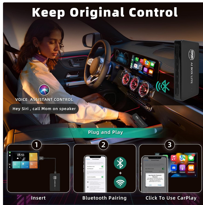
Figure 7: Detailed steps for inserting the device, Bluetooth pairing, and activating CarPlay.

Your browser does not support the video tag.