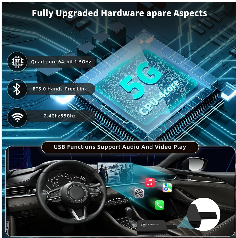
Figure 11: Illustration of the Ai Box Lite's USB functions supporting audio and video playback.