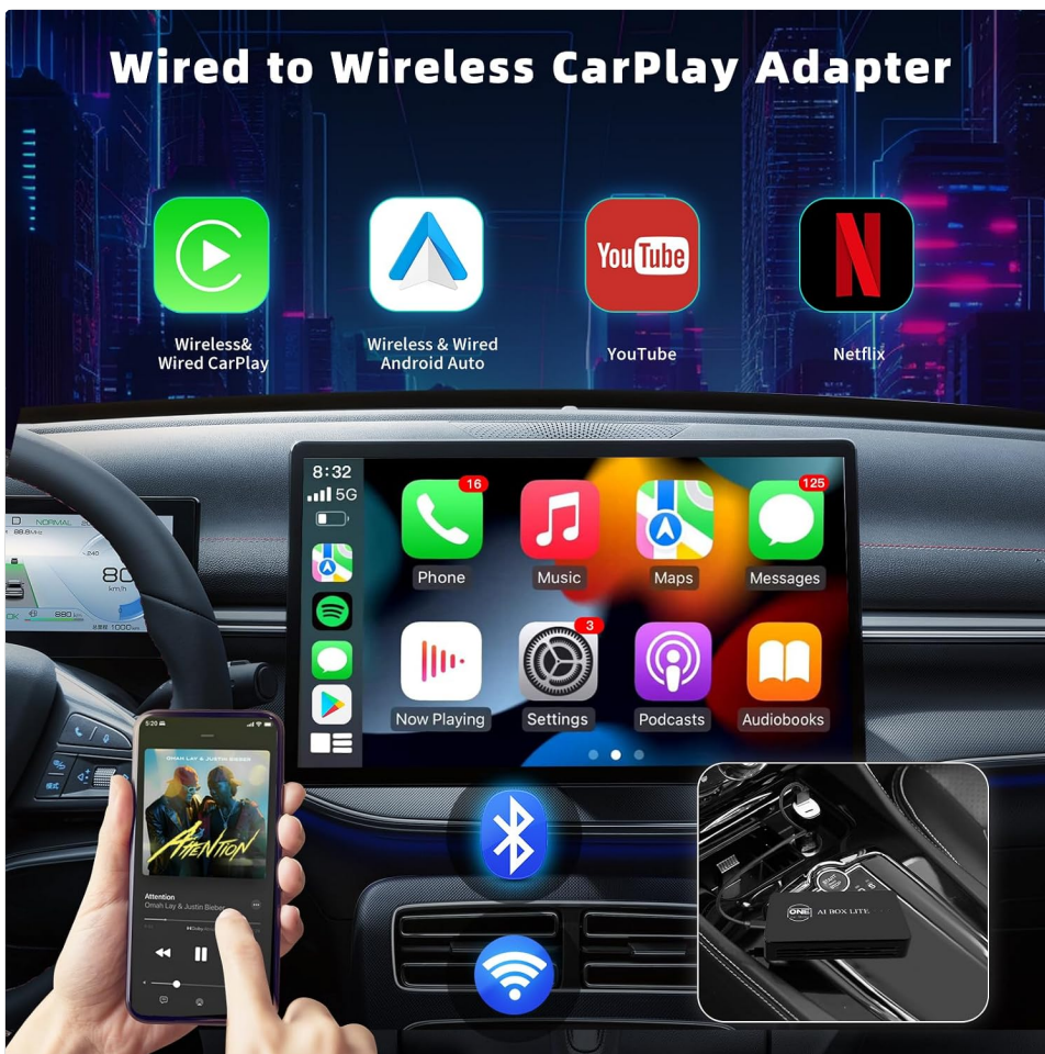
Figure 9: The car's display showing the CarPlay interface with icons for Wireless CarPlay, Wireless Android Auto, YouTube, and Netflix.