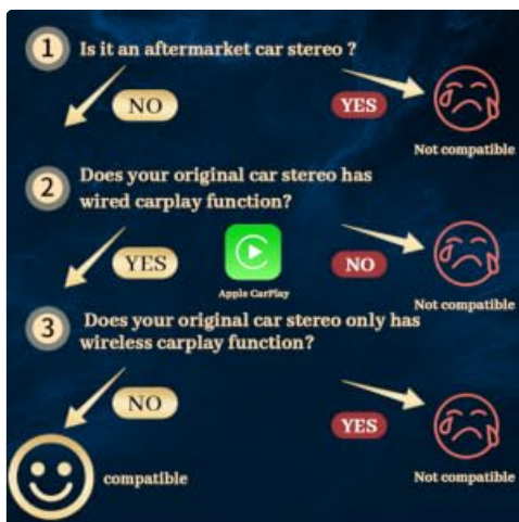
Figure 3: Flowchart illustrating car stereo compatibility requirements.