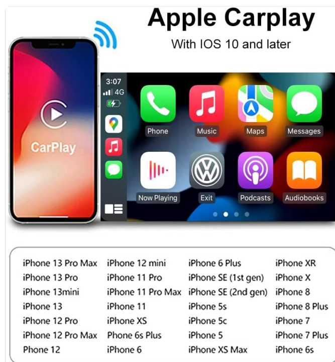
Figure 4: List of compatible iPhone models for Wireless Apple CarPlay.