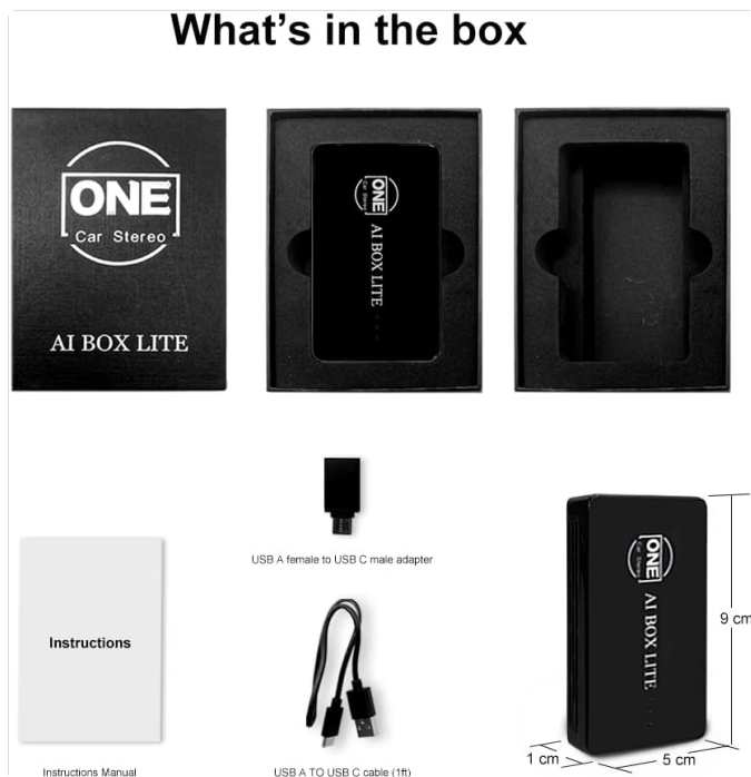
Figure 2: Package contents including the Ai Box, instructions, and necessary cables/adapters.