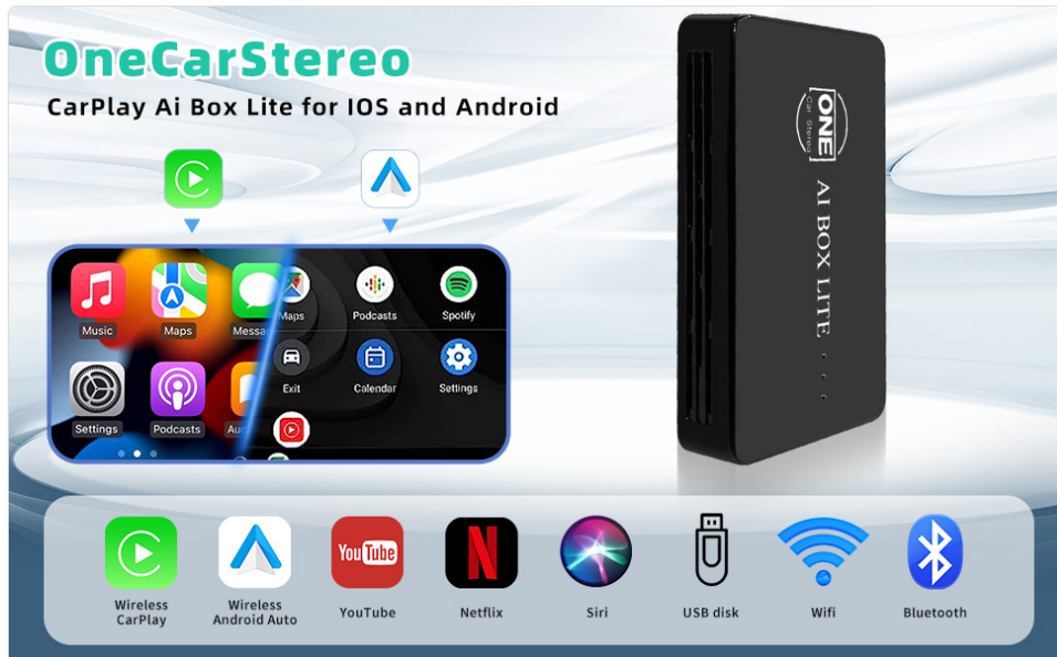
Figure 10: Car's display showing YouTube and Netflix content, highlighting the entertainment capabilities.

Important Note: If you want to watch YouTube or Netflix videos after connecting the box to the Internet, first you need to turn off Bluetooth and Wi-Fi of your smartphone (this will disconnect CarPlay or Android Auto). Then, open your mobile hotspot and click "Setting" in the Ai Box interface to connect to the mobile hotspot to access the Internet.