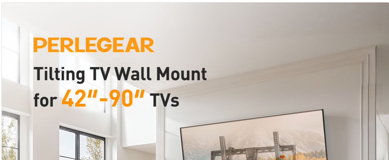
Image: Visual guide illustrating the wide compatibility of the Perlegear TV mount with various TV sizes (42-90 inches), maximum load capacity (132 lbs), VESA patterns (200x100mm to 800x400mm), and supported wall types (concrete, wood studs, brick).