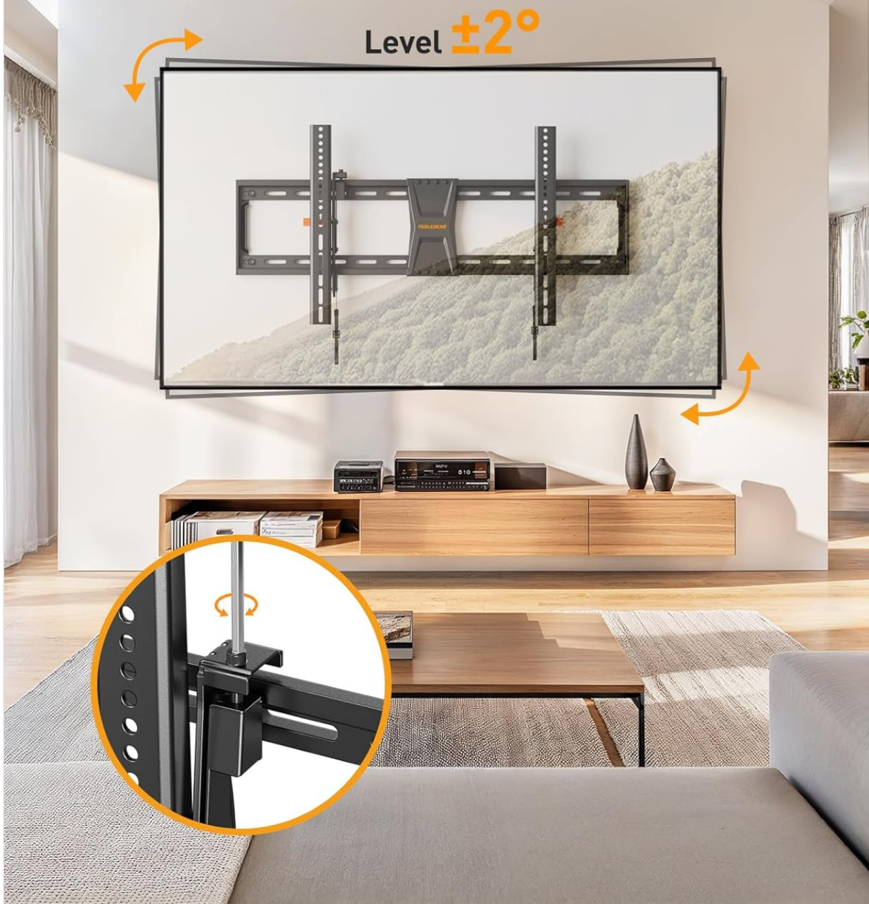
Image: A television mounted on the wall, showing the \pm 2^\circ leveling adjustment feature. An inset highlights the mechanism for fine-tuning the TV's horizontal alignment after installation.