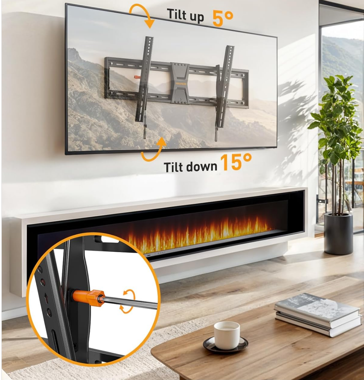
Image: A television mounted on the wall, demonstrating the +5° tilt up and -15° tilt down capabilities of the Perlegear mount, with an inset showing the orange knob for manual adjustment.