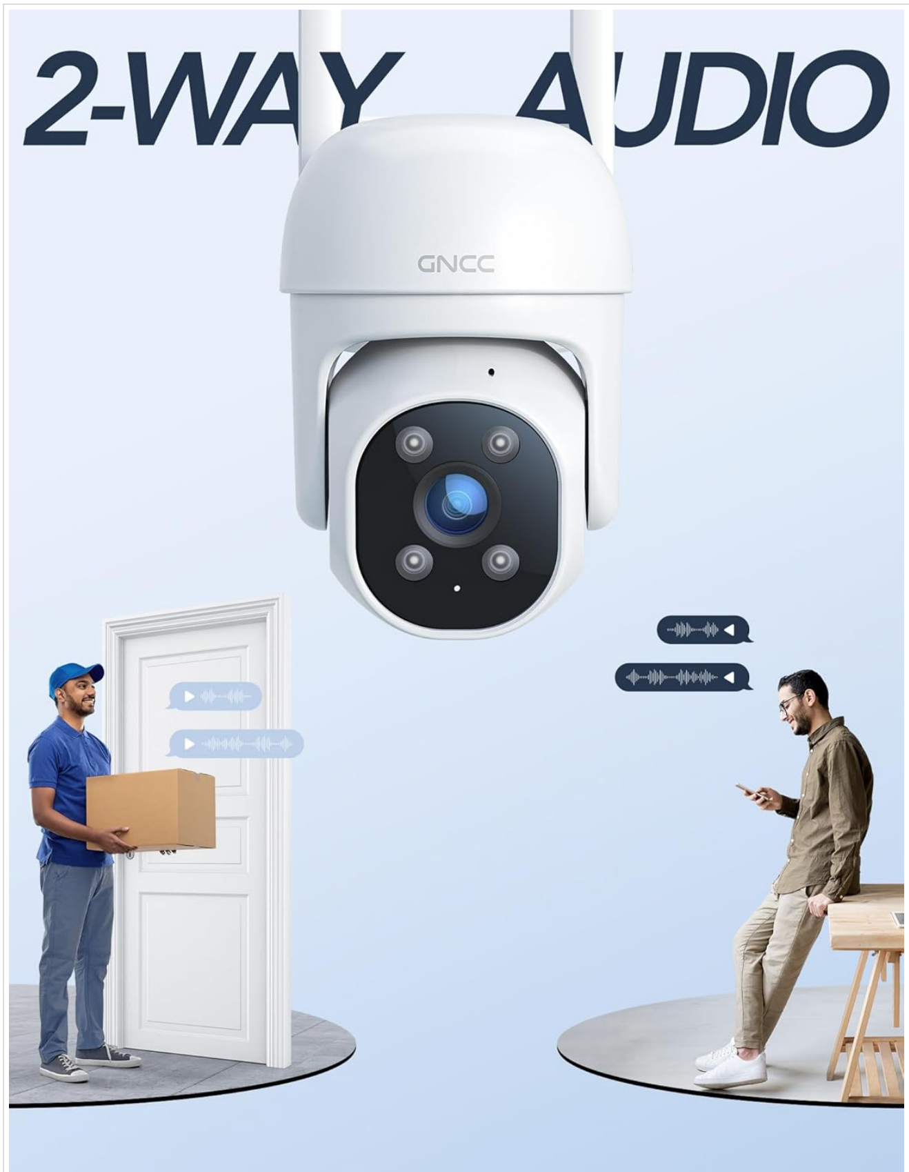
Figure 3.5: Utilizing two-way audio for communication.