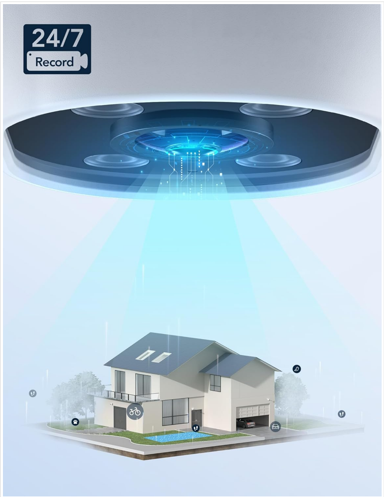
Figure 3.3: 24/7 continuous recording capability.