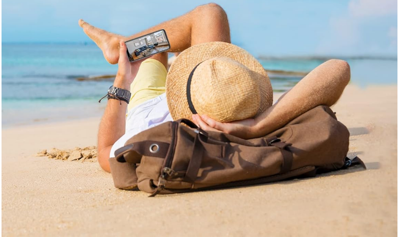
Figure 3.1: Remote monitoring of your home from any location.