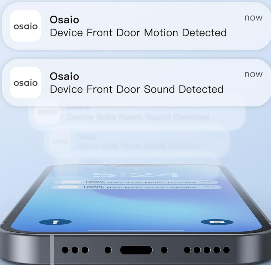
Figure 3.6: Instant notifications for detected events.