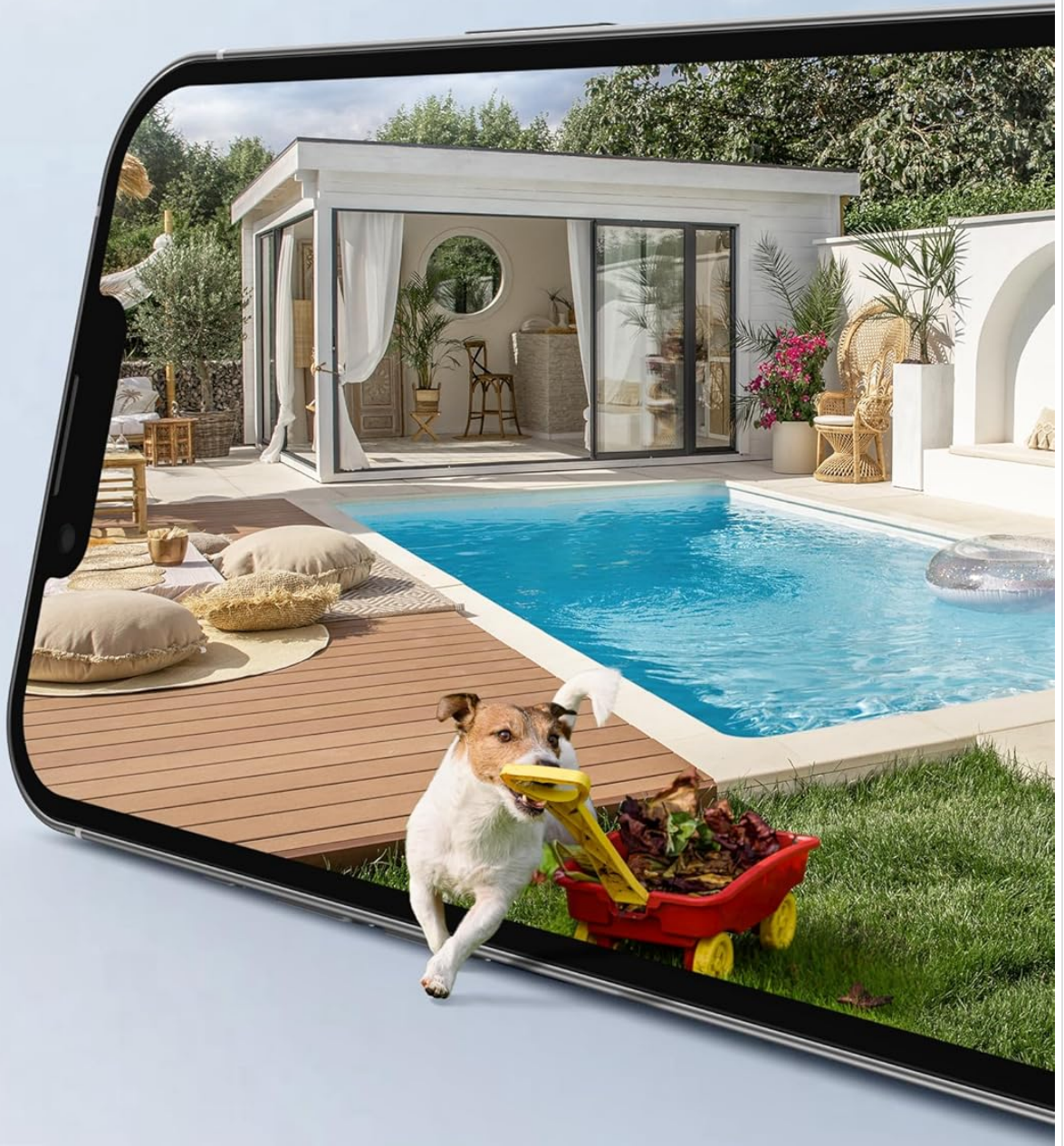
Figure 3.2: High-definition 1080P HDR video quality.