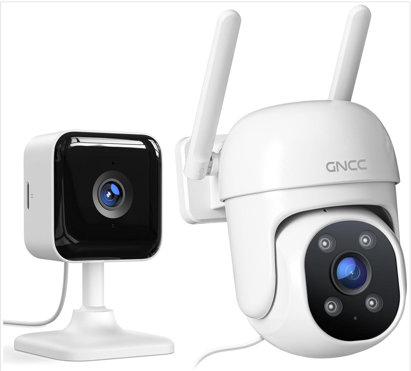
Figure 1.1: GNCC 1080P Indoor and Outdoor Security Cameras included in the set.