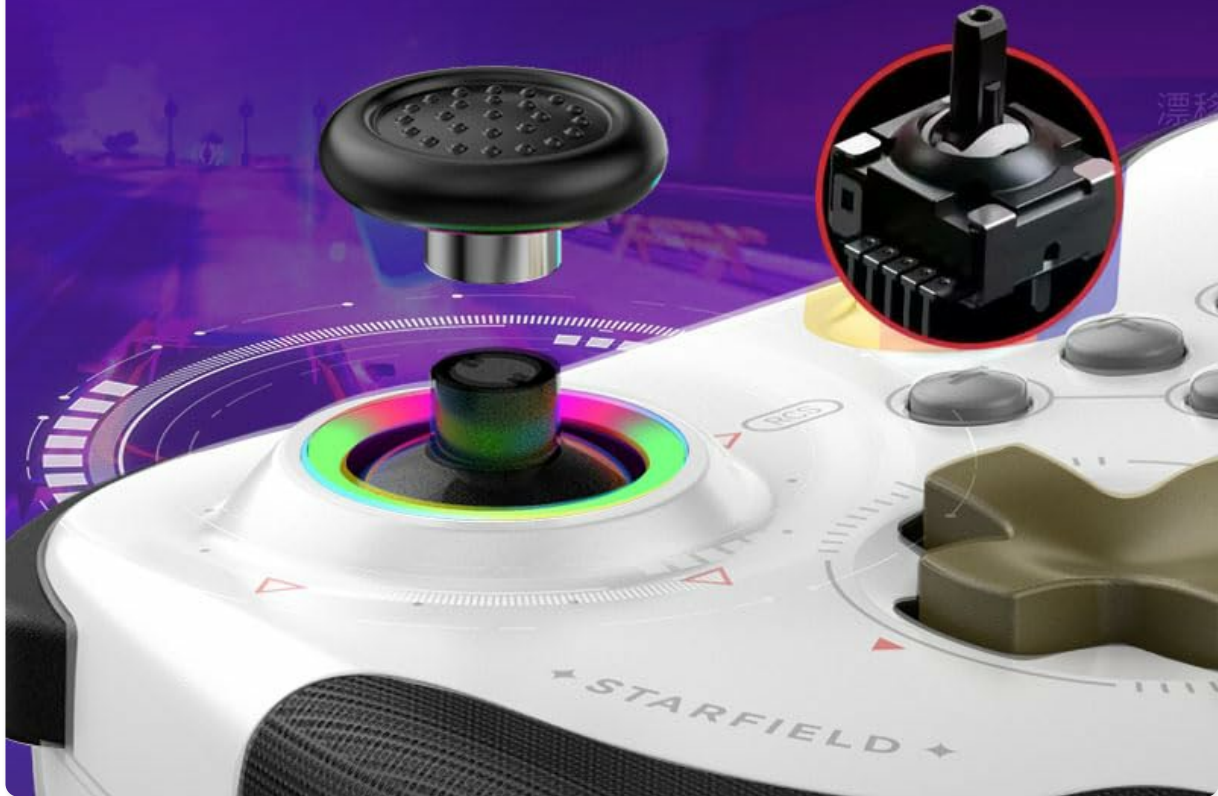
Hall Effect 3D Joystick Detail

Z01 is equipped with an esports level Hall joystick, which greatly reduces the damping of the joystick, smooth handling, and precise positioning without drift