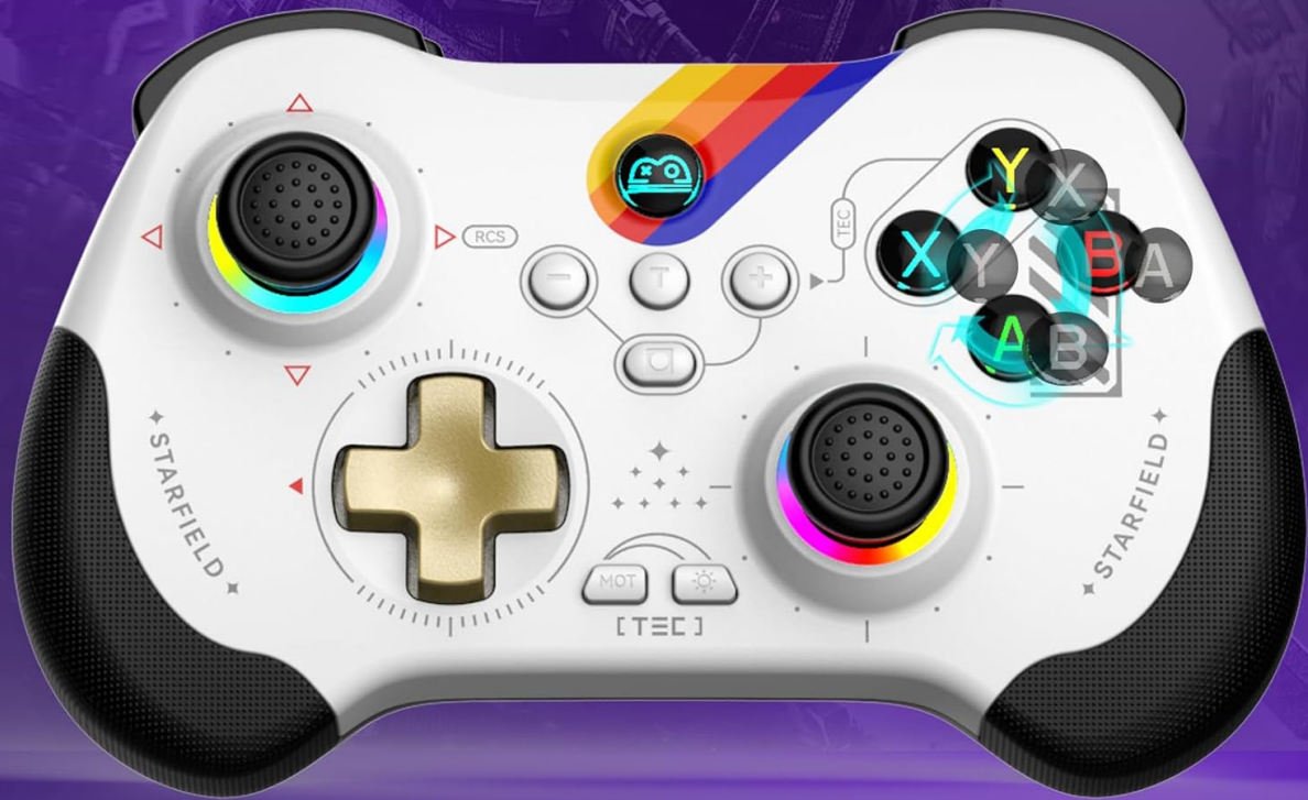
ABXY Key-Value Interchange Diagram

Press the 'Y+A+HOME' keys to switch the ABXYkey value from Xbox setting to Switch setting. Lets you freely switch between the Xbox layout and N-Switch layout without removing the buttons.