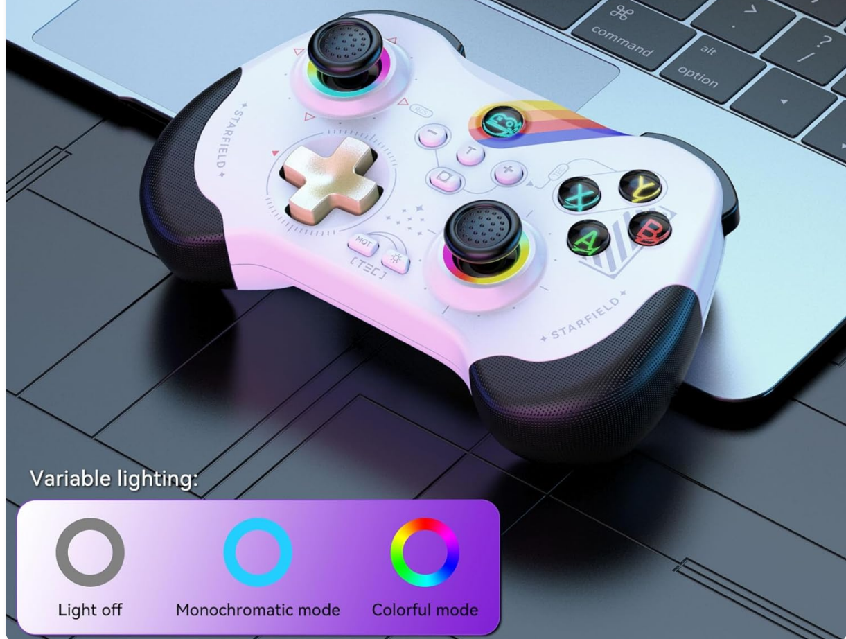
RGB Lighting Modes Illustration

Cool aperture button glow effect, Playing games can also be passionate