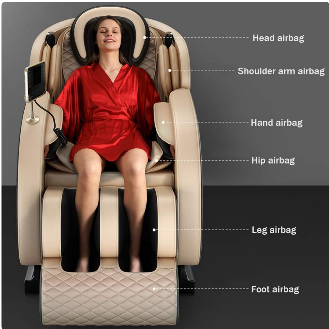
Image: Airbag Locations

This diagram highlights the various airbag zones across the body, including head, shoulder, arm, hand, hip, leg, and foot, for a full-body compression massage.