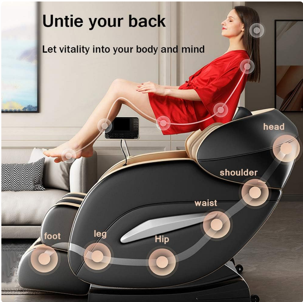
Image: Full Body Massage Points

This image illustrates the full range of massage points covered by the chair, from head to foot, ensuring comprehensive relief.