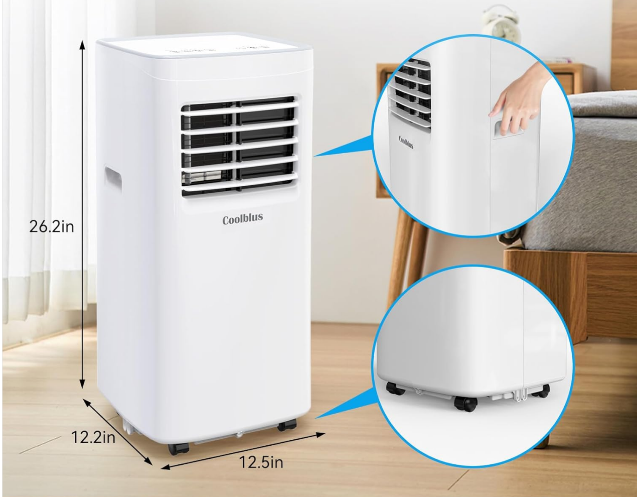
Image 2.2: Unit dimensions (26.2in H x 12.2in D x 12.5in W) and features like handles and 360-degree casters for easy movement.

Easily move from room to room with handles and 360-degree casters