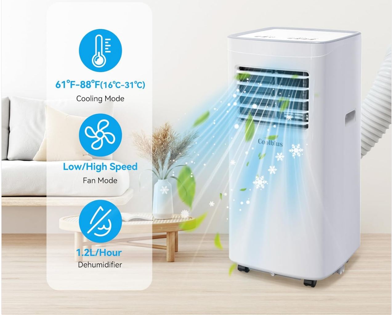
Image 4.2: Icons representing the three modes: Cooling (61°F-88°F), Fan (Low/High Speed), and Dehumidifier (1.2L/Hour).

Coolblus's 3-in-1 portable AC for ultimate climate control in your life!