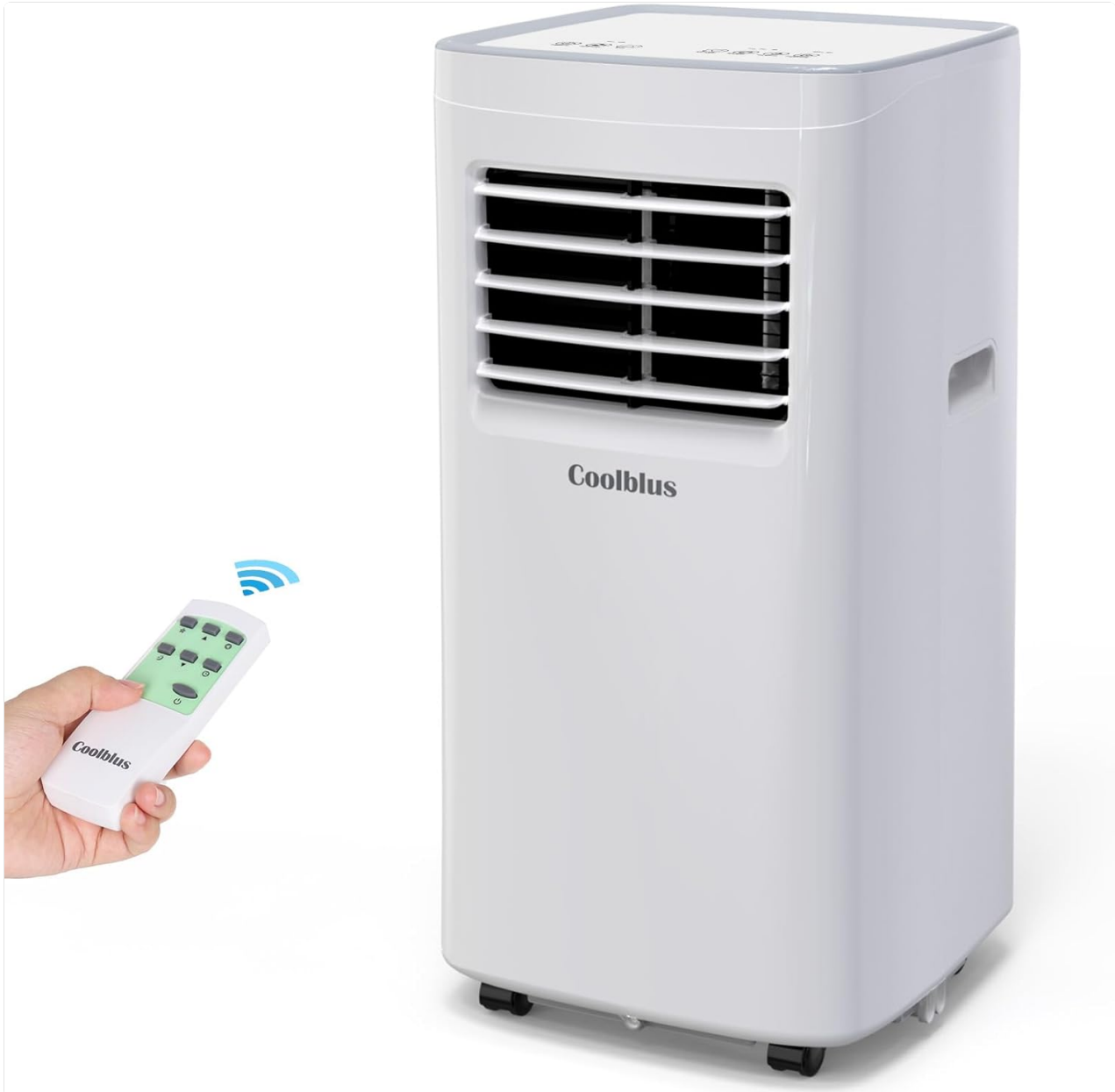
Image 2.1: The Coolblus Portable Air Conditioner unit with its remote control.