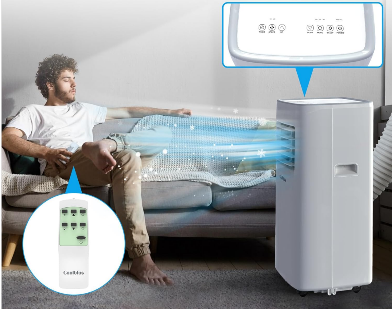
Image 4.1: Close-up of the unit's LED control panel and the remote control, highlighting user-friendly interfaces.

Convenient Remote and User-friendly LED for ultimate control and comfort in every moment.