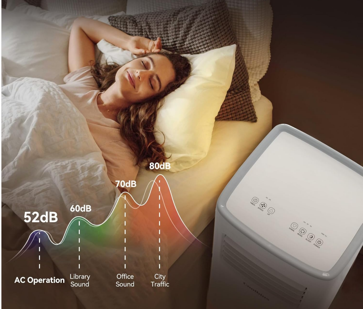
Image 4.3: Illustration of sleep mode with a person sleeping peacefully, indicating a low noise level of 52 dB during AC operation compared to other environmental sounds.

With 52 dB quiet operation you can enjoy your sleep time