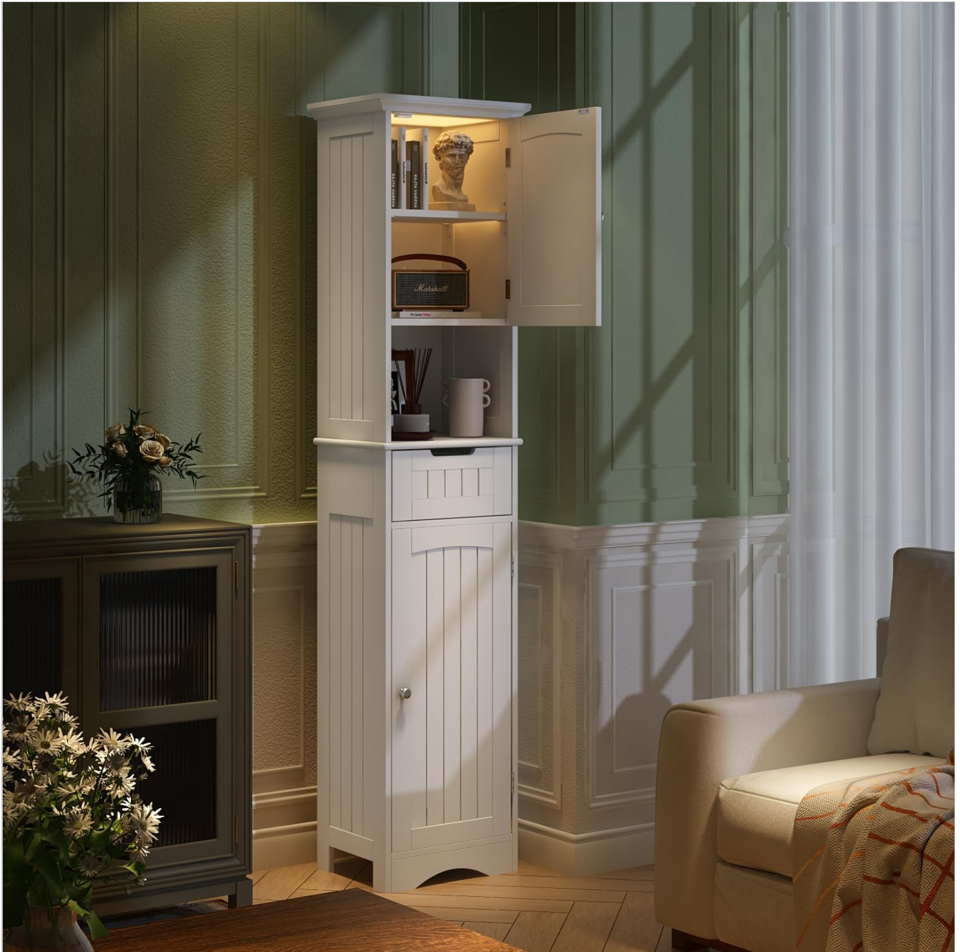
Image: The ChooChoo storage cabinet (Model SC2301-WH-LED) shown in a bathroom, highlighting its tall, narrow design and white finish. This image provides a visual reference for the product's appearance and scale.