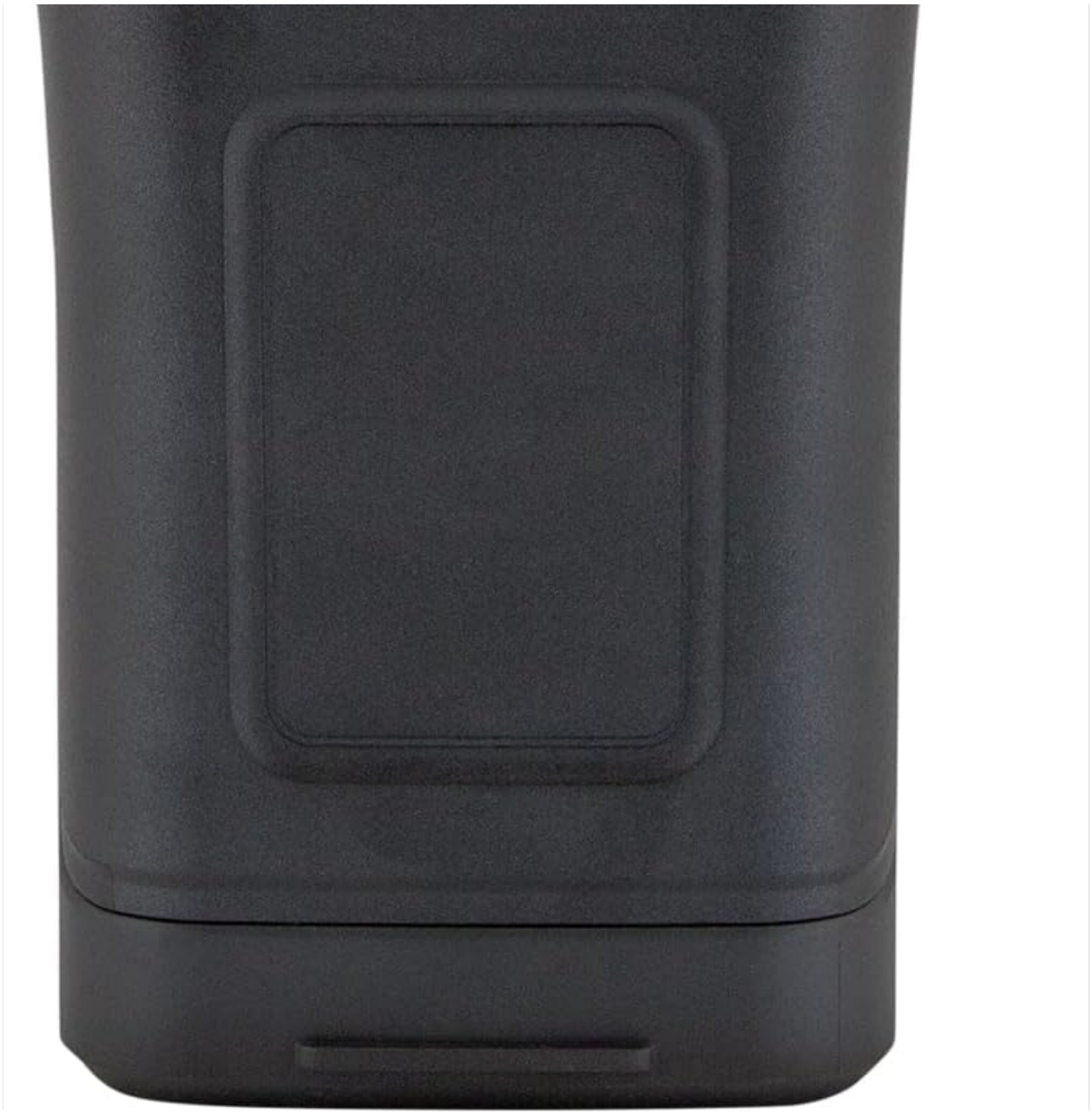
Figure 2: Rear view of the printer, indicating the battery compartment.