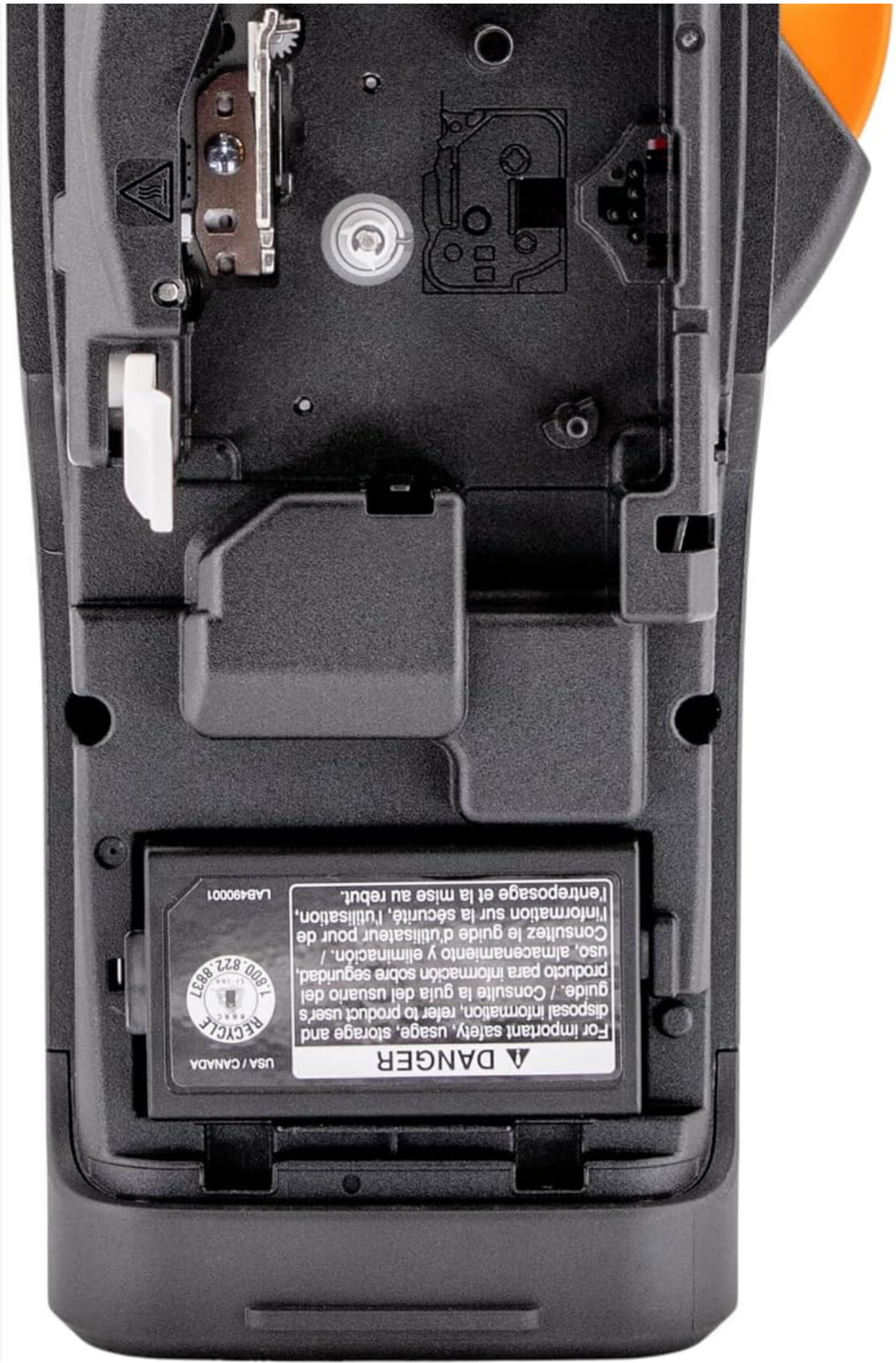
Figure 3: Internal view of the tape compartment for cartridge installation.