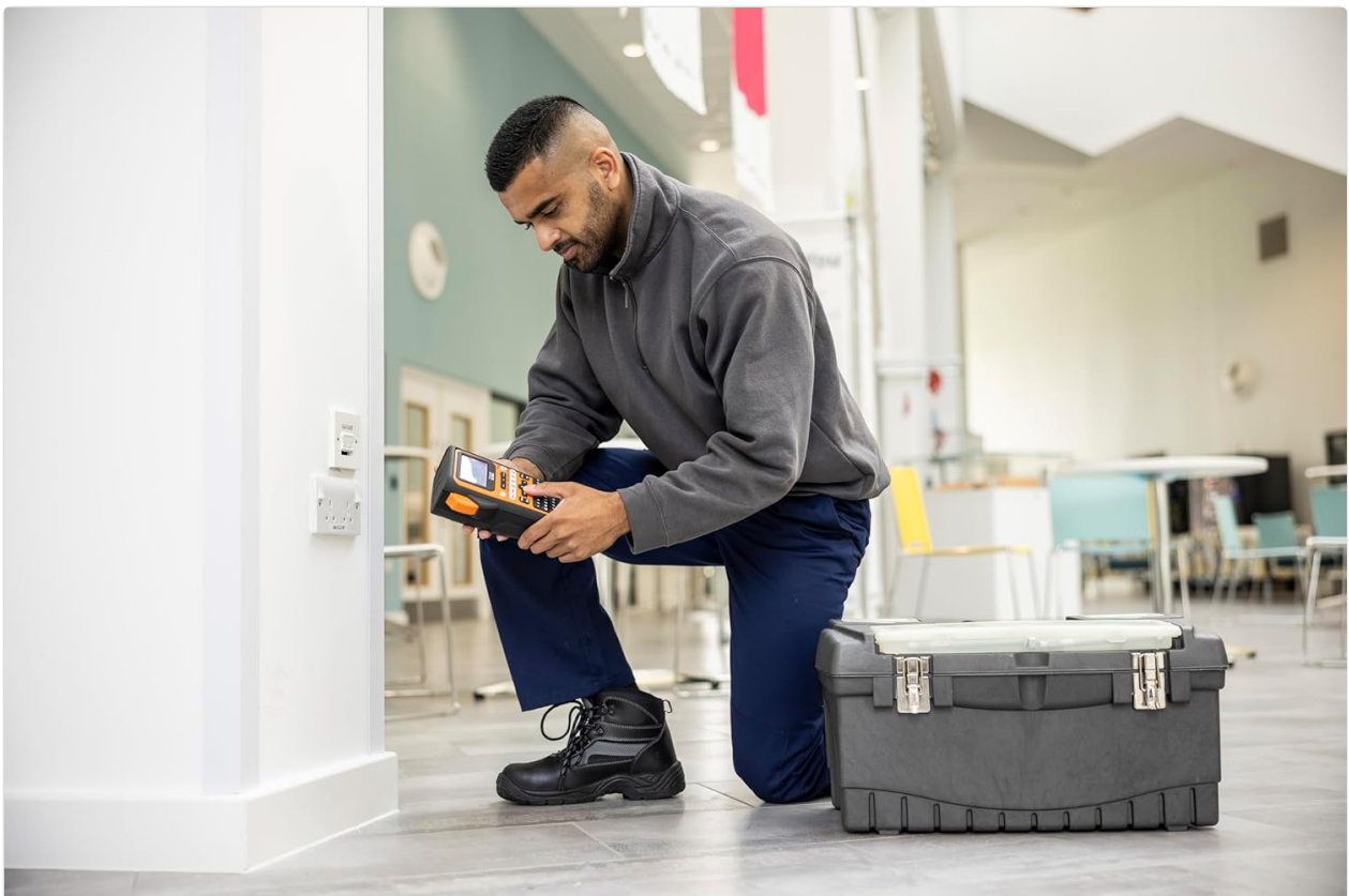
Figure 4: A technician utilizing the label printer in an industrial setting.

To use, press the desired application key, enter the required information, and print.