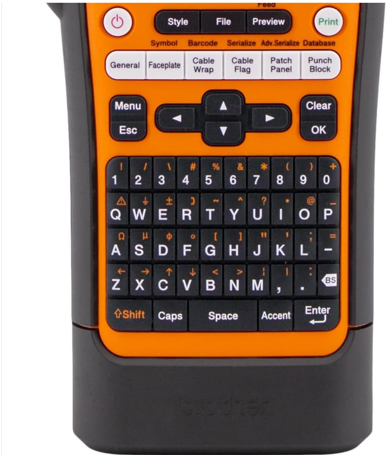
Figure 1: Front view of the Brother PT-E310BTVP P-Touch Edge Handheld Industrial Label Printer.