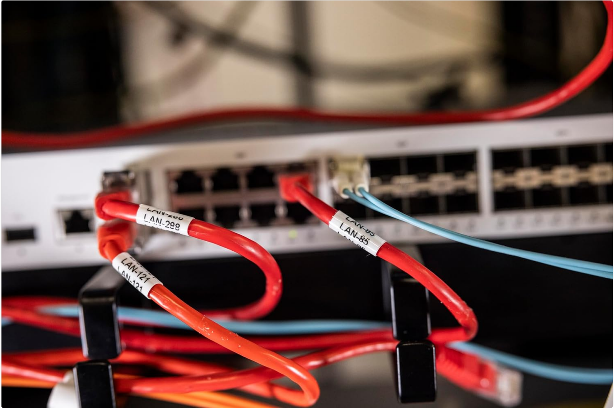
Figure 5: Example of labels applied to network cables, demonstrating clarity and application.