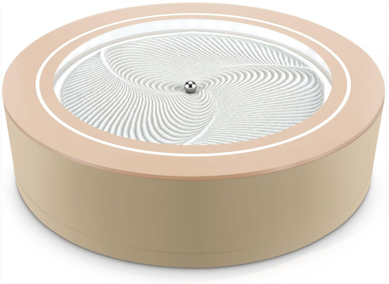
The HoMedics 11" Drift Sandscape, featuring a metal sphere creating intricate patterns in sand.