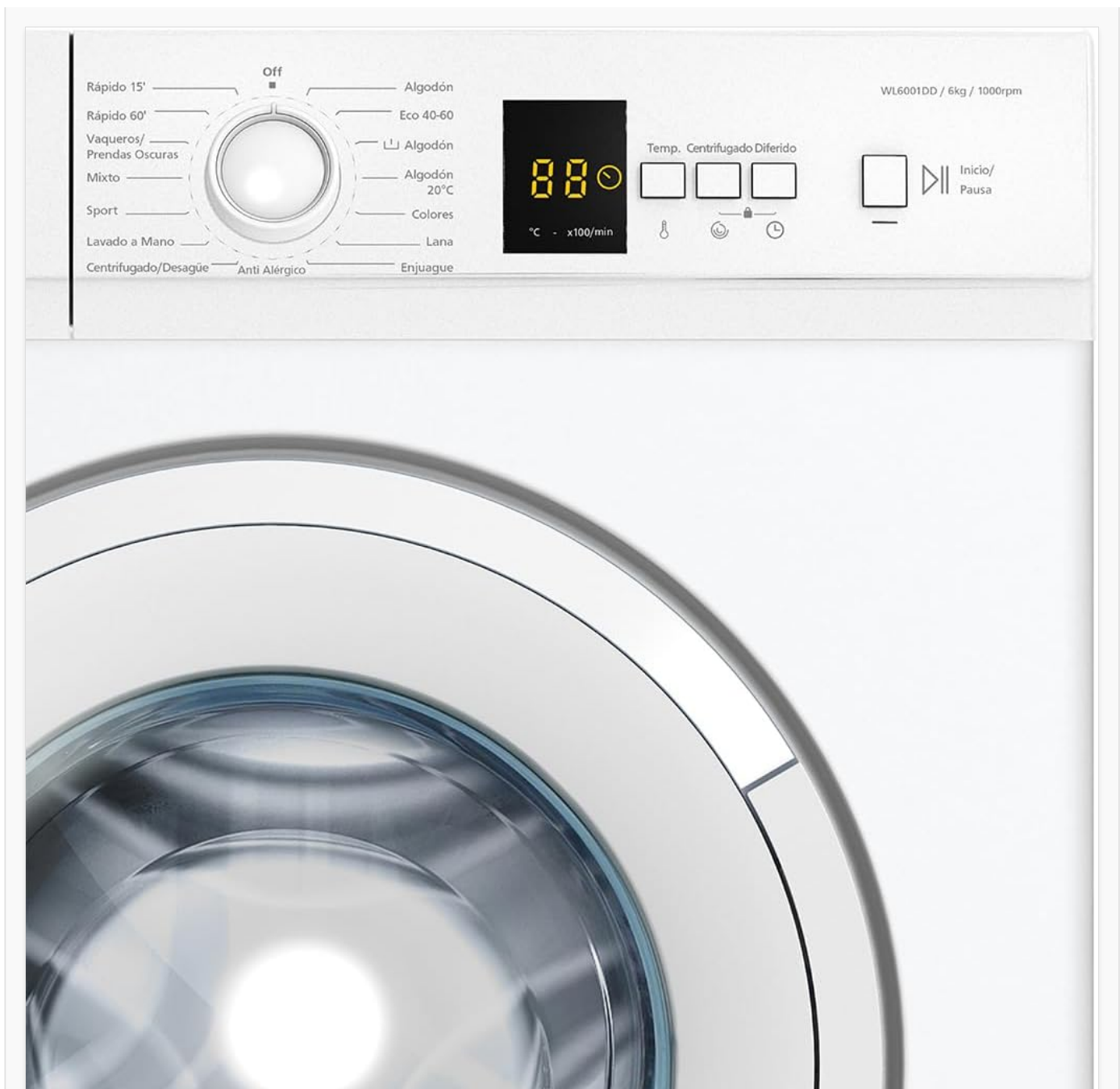
Figure 3.2: Close-up of the control panel, featuring the program selection dial, LED display, and function buttons.