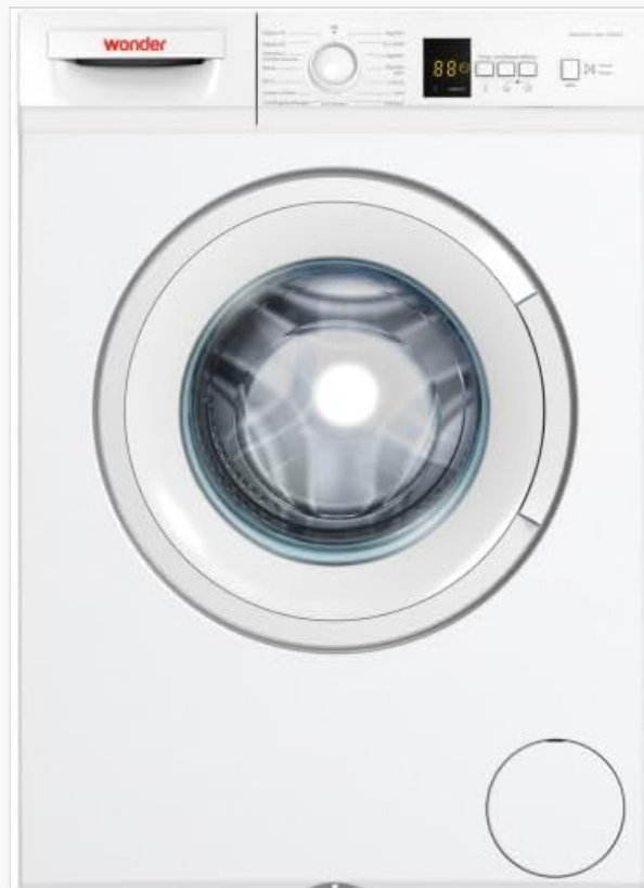
Figure 3.1: Front view of the Wonder WL6001DD Washing Machine, showing the main door, control panel, and detergent dispenser.

The Wonder WL6001DD washing machine features a classic white aesthetic with a transparent door and a durable stainless steel drum. Its design incorporates a vibration-free Boomerang-Chassis for stable operation.