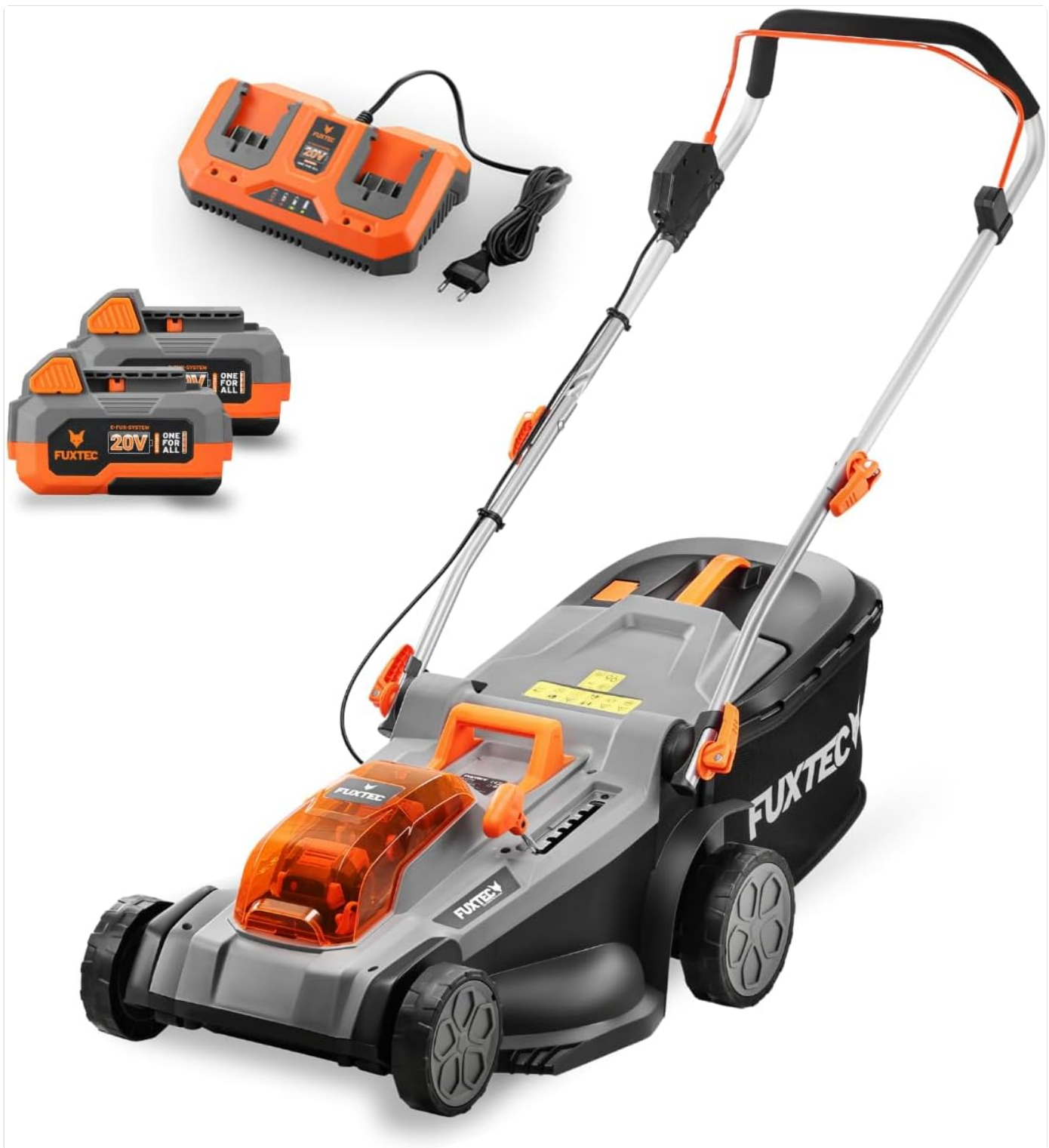
Figure 1: Fuxtec 40V Cordless Lawn Mower E2RM37 with included batteries and charger.