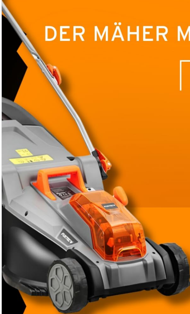
Figure 5: Key features include an adjustable handle, a 40-liter grass catcher, and cutting height adjustment.