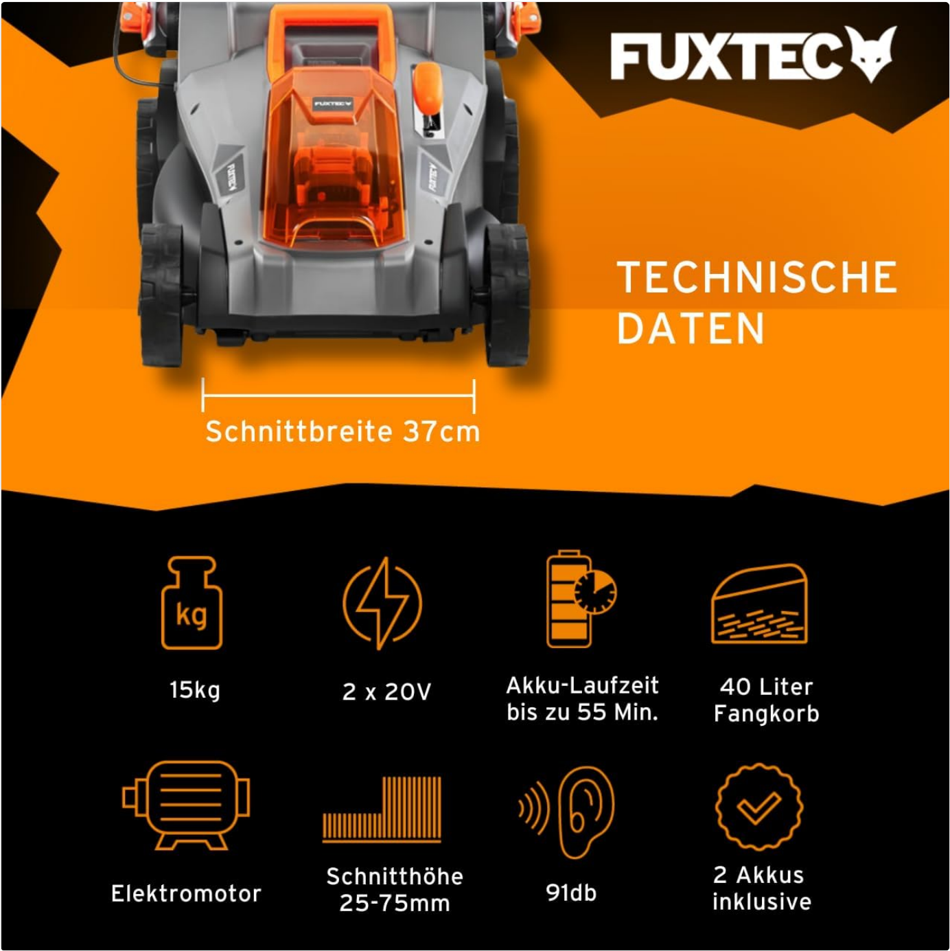
Figure 10: Overview of the Fuxtec E2RM37's technical specifications.