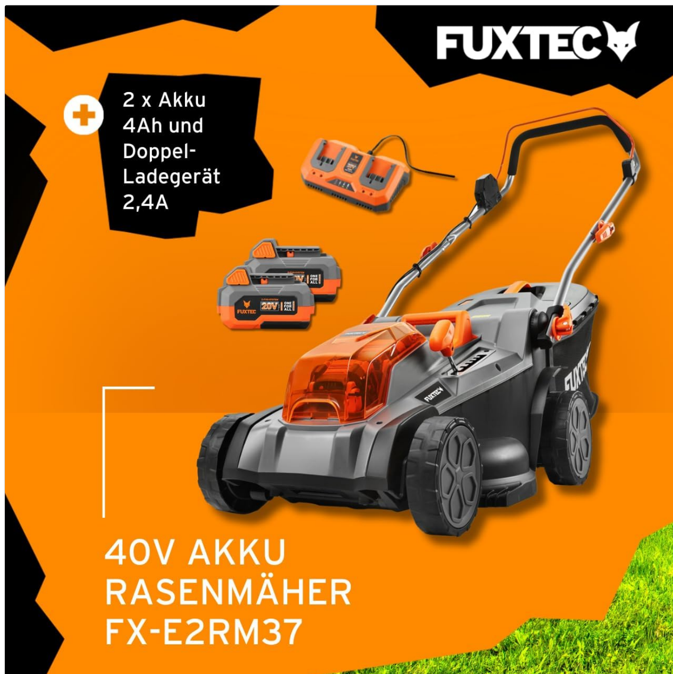
Figure 2: The Fuxtec FX-E2RM37 lawn mower with its 2x 20V 4Ah batteries and dual charger.