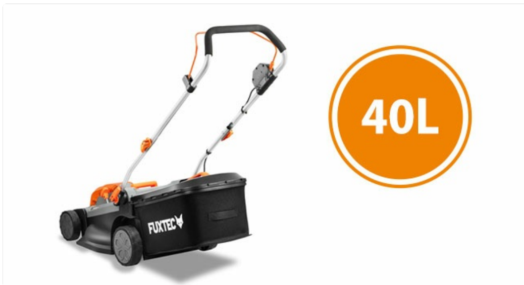
Figure 7: The 40-liter grass catcher minimizes interruptions for emptying.