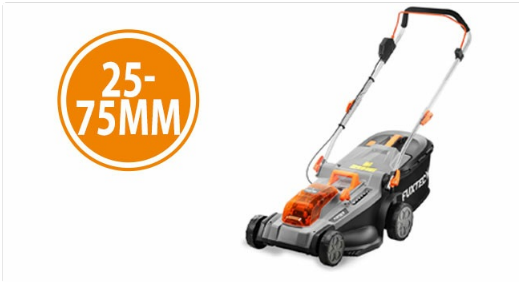
Figure 4: The mower features a cutting height range of 25-75mm for versatile lawn care.