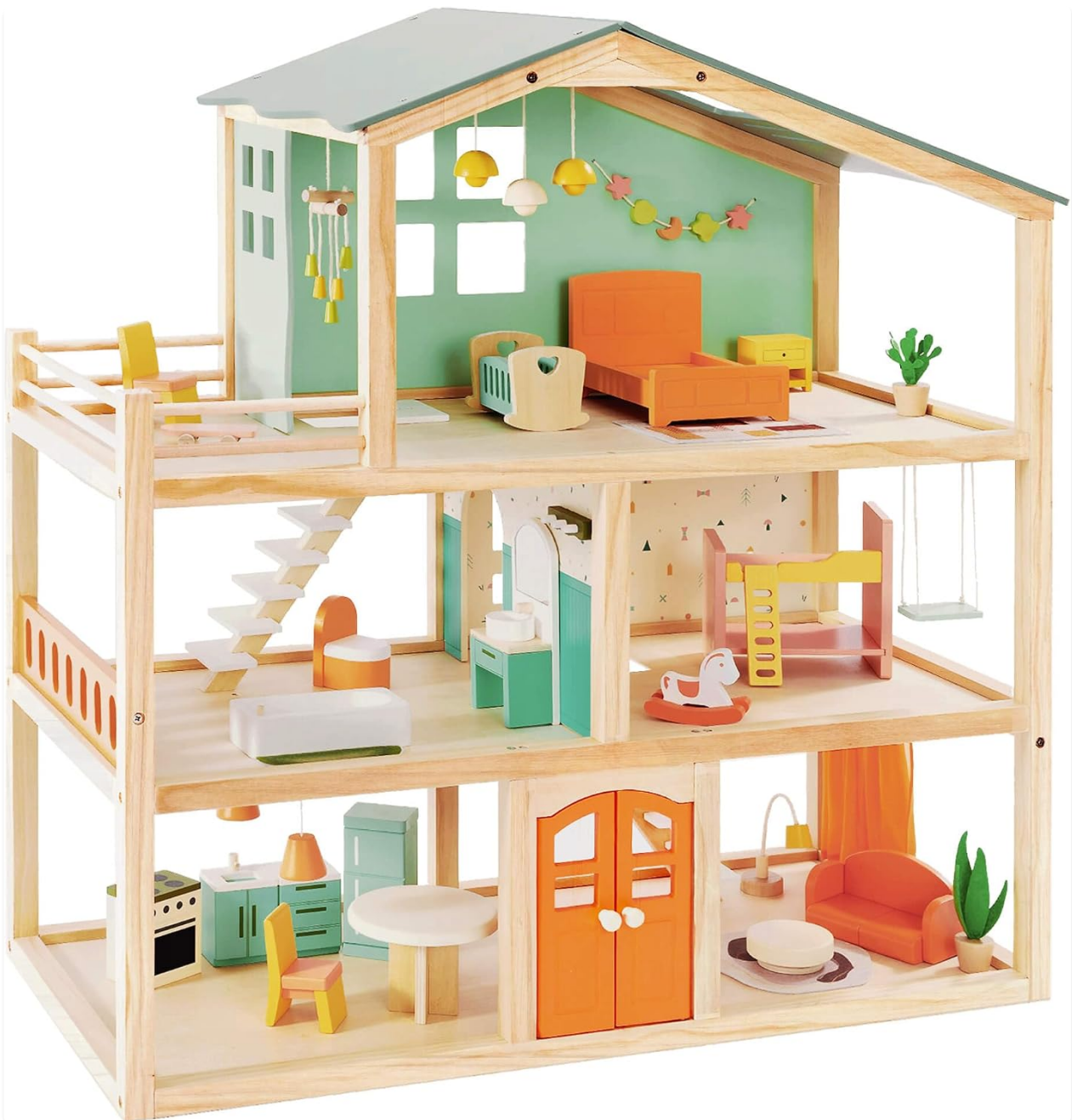
Image: The Giant bean Large Wooden Dollhouse, showcasing its three stories, five rooms, and balcony, fully furnished with the included accessories.