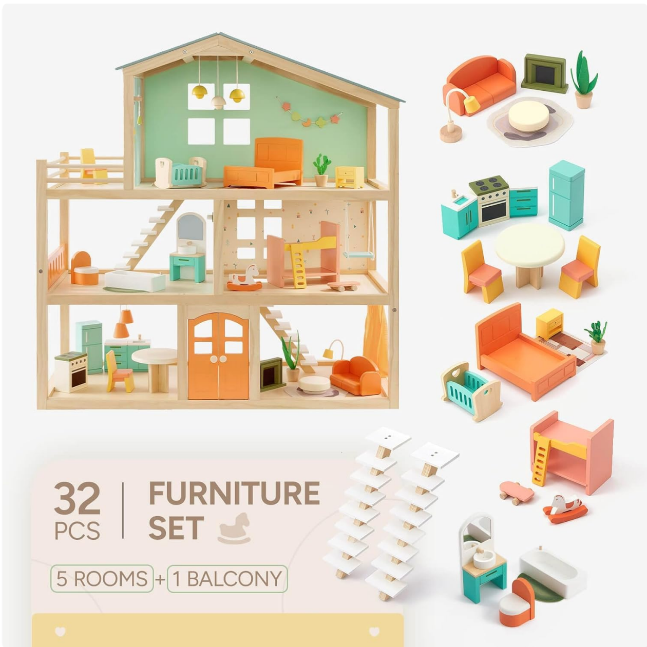
Image: A visual representation of the 32 furniture accessories included with the dollhouse, ready for placement in the various rooms.