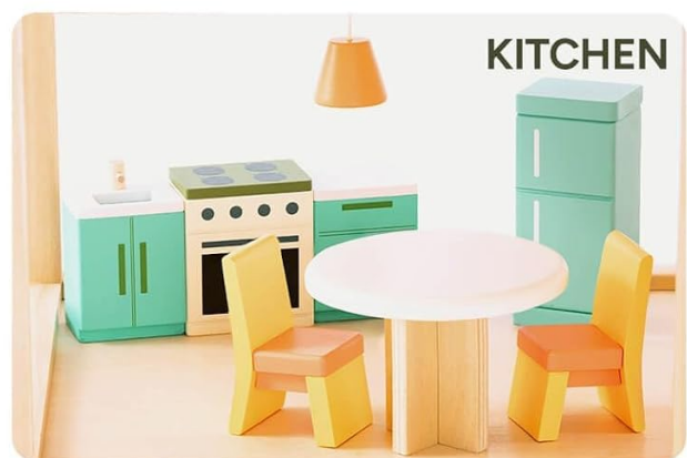
Image: A detailed view of the dollhouse's interior, highlighting the distinct rooms such as the bedroom, bathroom, baby room, living room, kitchen, and balcony, each with its unique decor.