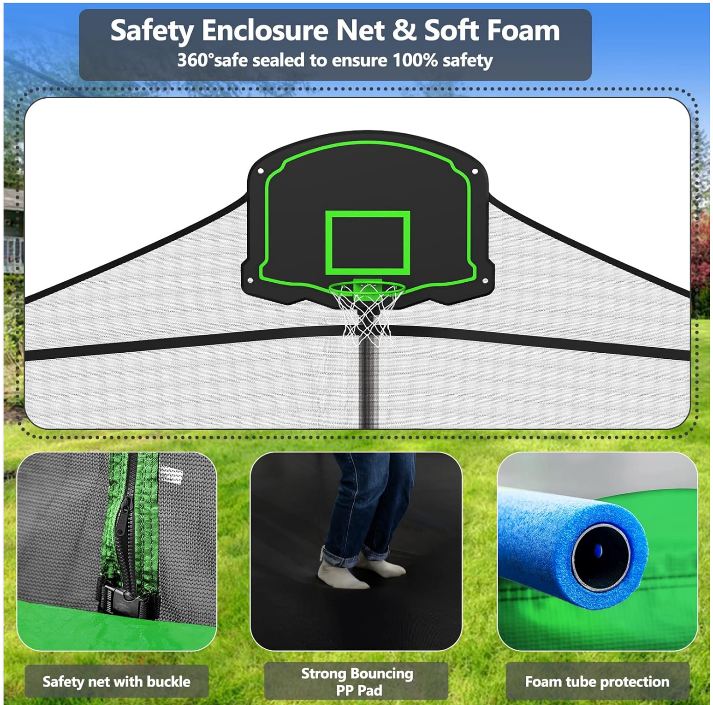
Image 2: Detailed view of the safety enclosure net, spring cover pad, and foam pole protection.