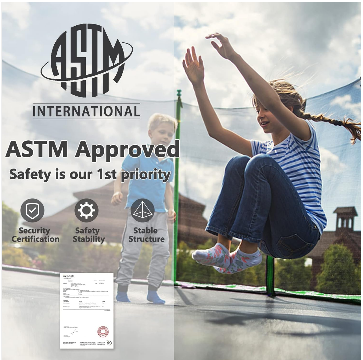
Image 4: ASTM International approval for the Lyromix trampoline, highlighting safety as a priority.