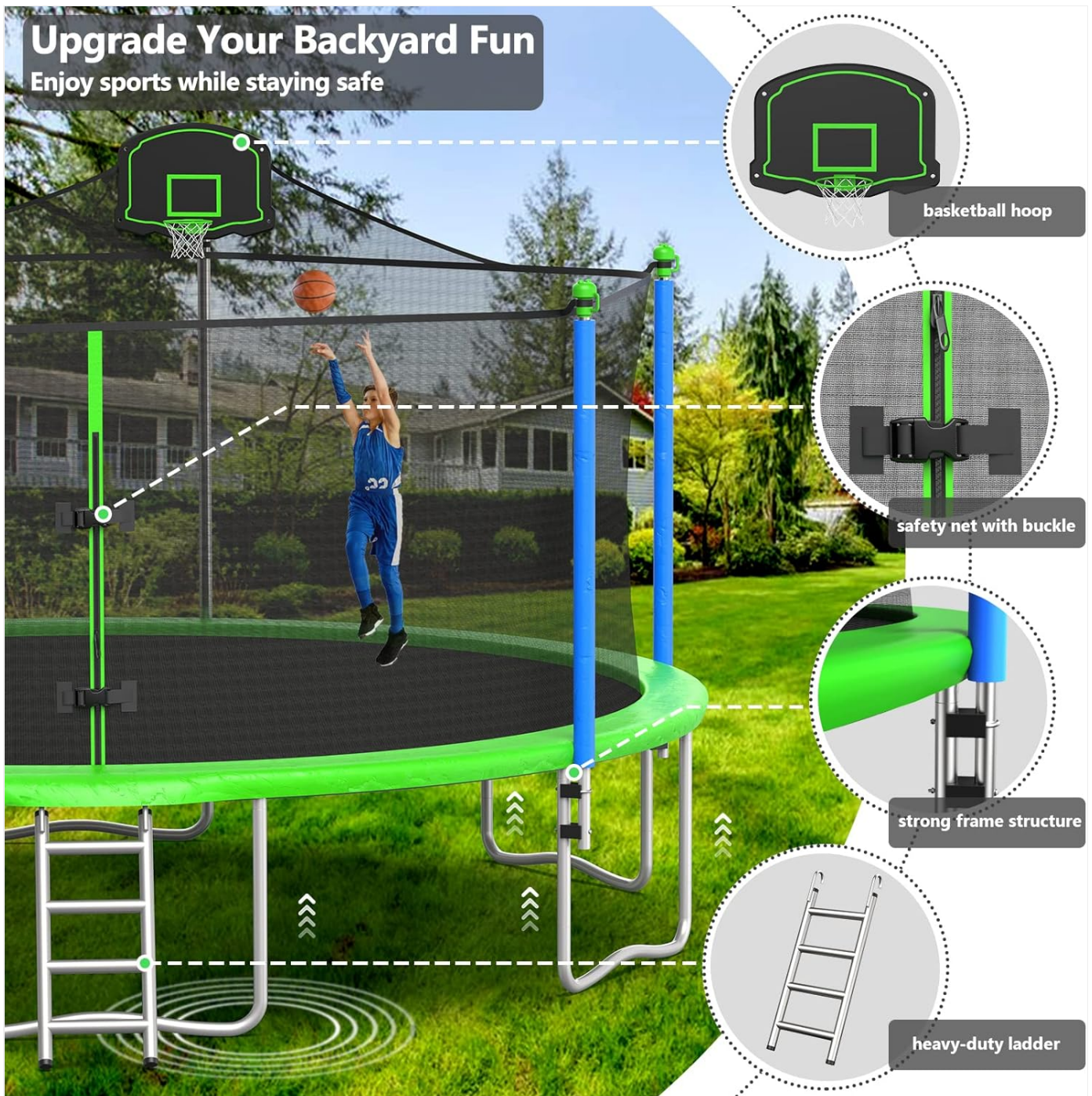
Image 1: Lyromix 16ft Outdoor Trampoline with Basketball Hoop, highlighting key features like the basketball hoop, safety net buckle, strong frame, and ladder.