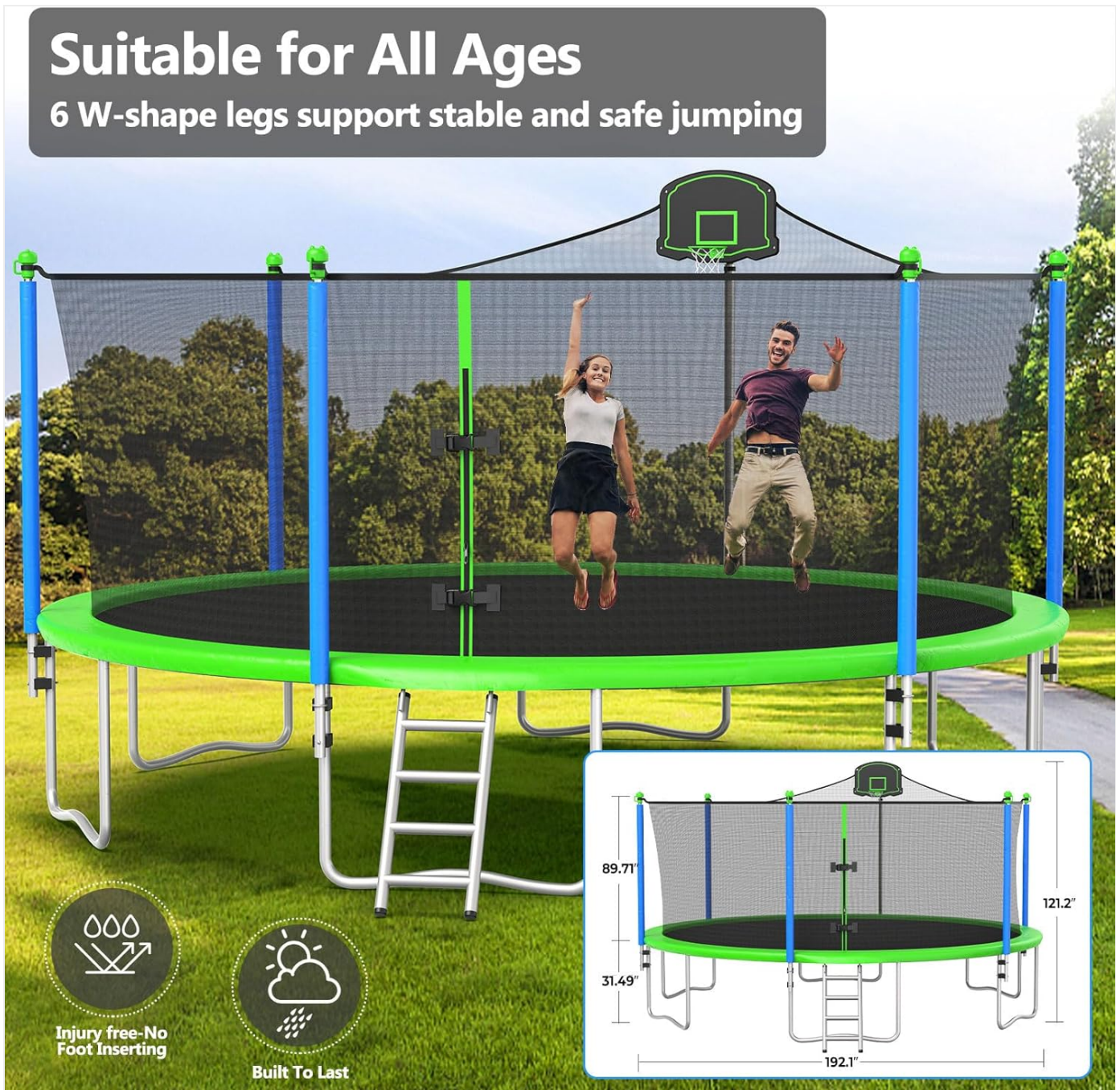
Image 6: Lyromix trampoline with dimensional diagram and illustration of use by adults.