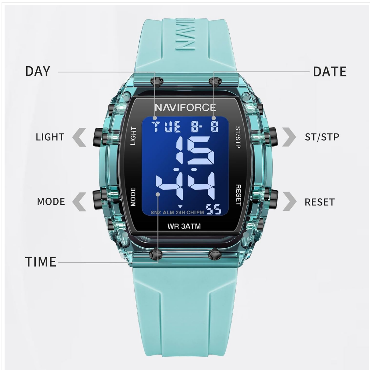
Figure 2: Watch button functions. The buttons are labeled LIGHT, MODE, ST/STP, and RESET.