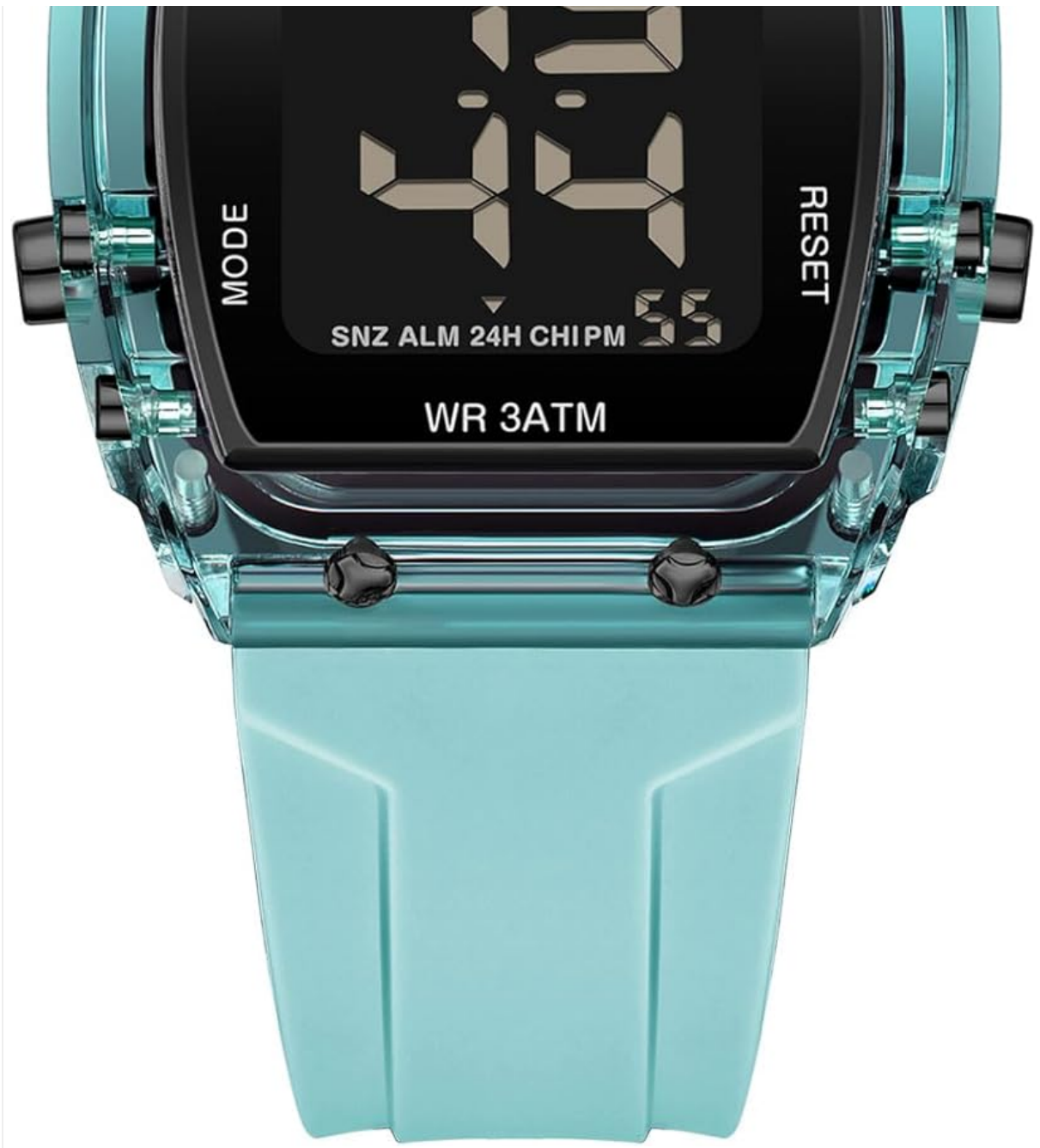
Figure 1: Front view of the NAVIFORCE Digital Multi-Function Watch NF7102.