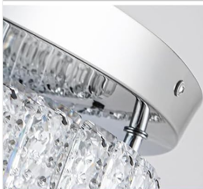
Chrome Stainless Steel