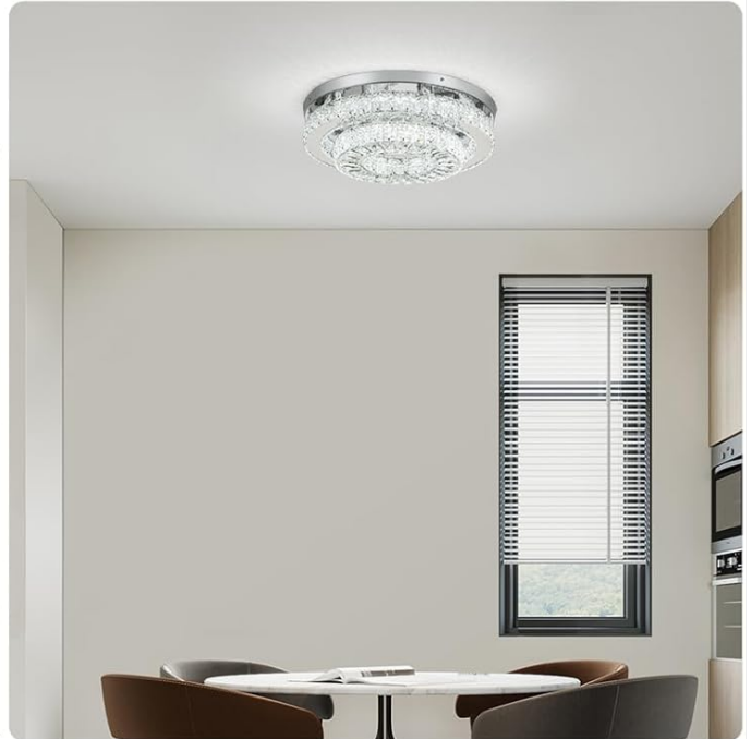
Image 6.1: Visual representation of the chandelier when turned off and on, demonstrating its illumination.