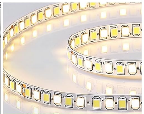
LED Light Source