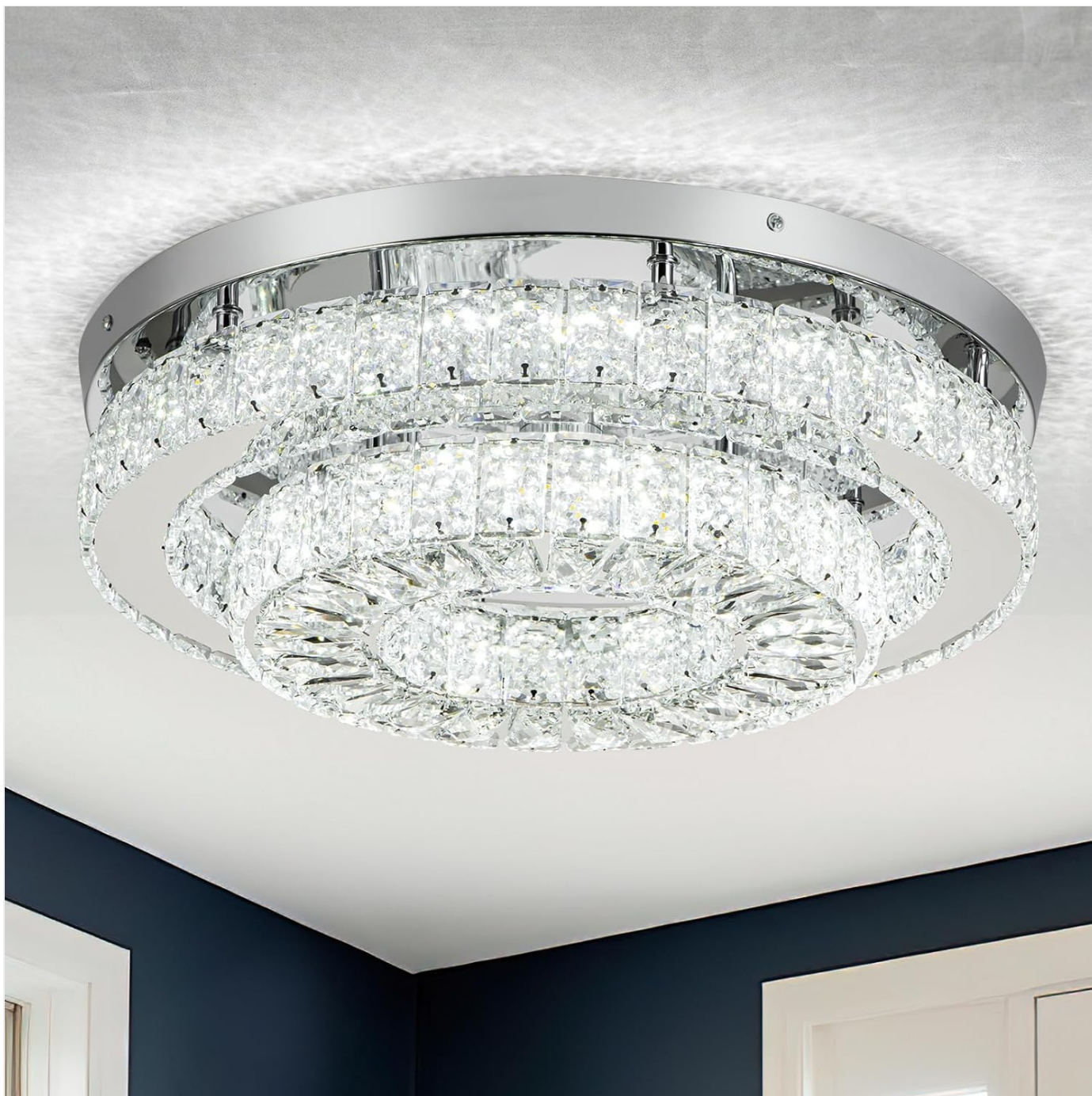
Image 1.1: The HOPGGIE 18" Crystal Chandelier, showcasing its two tiers of crystals and polished chrome finish.