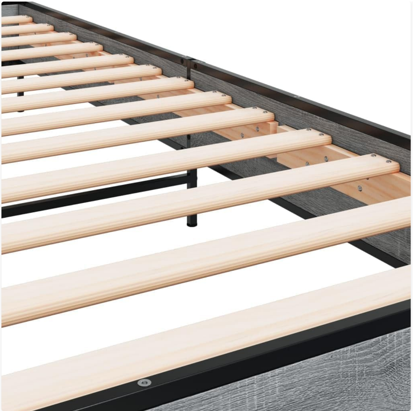
Image: A detailed view of the bed frame's plywood slats and the underlying metal support structure, highlighting the mattress foundation.