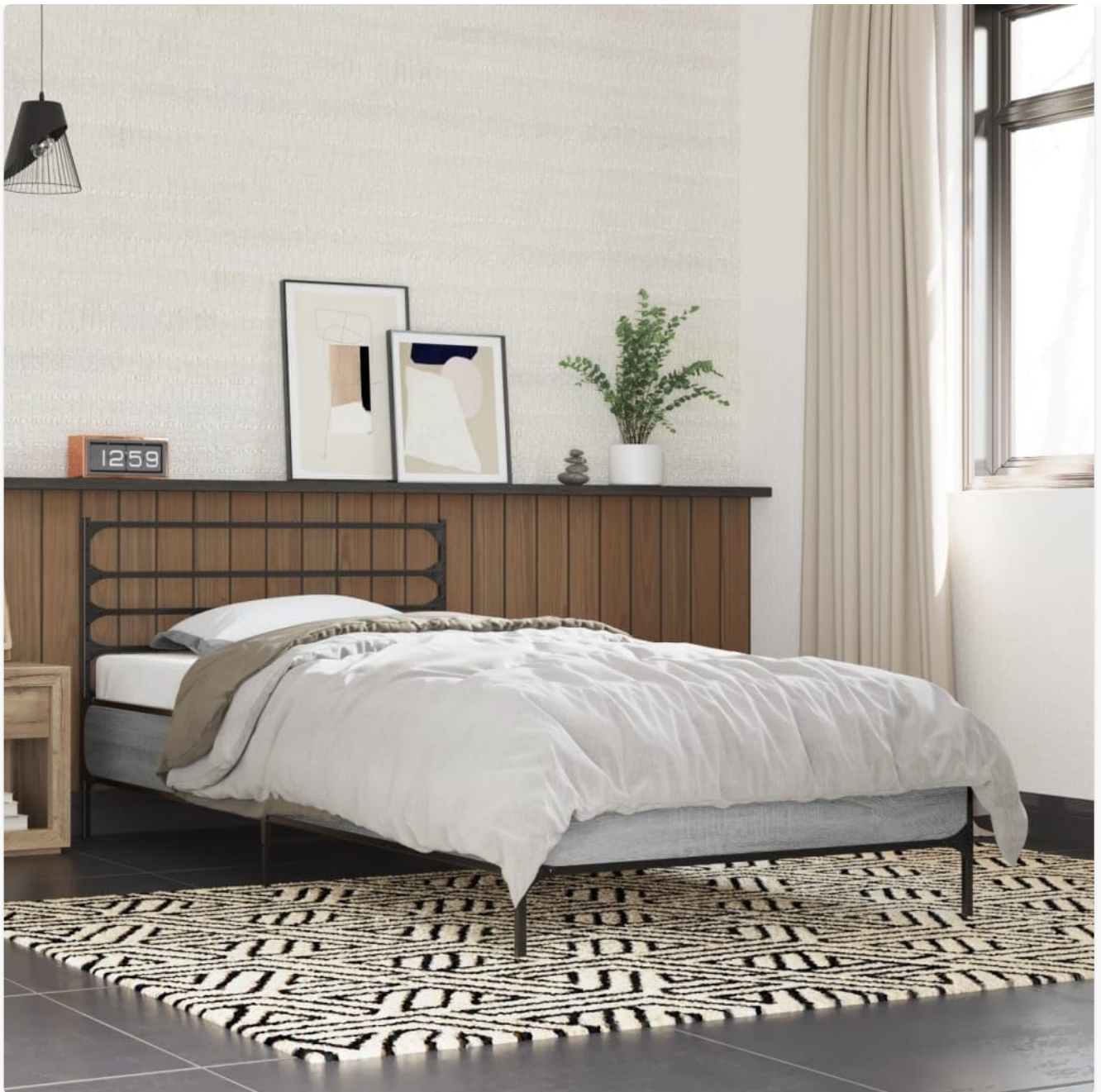
Image: The vidaXL Sonoma Grey Bed Frame, fully assembled with a mattress and bedding, positioned in a modern bedroom.