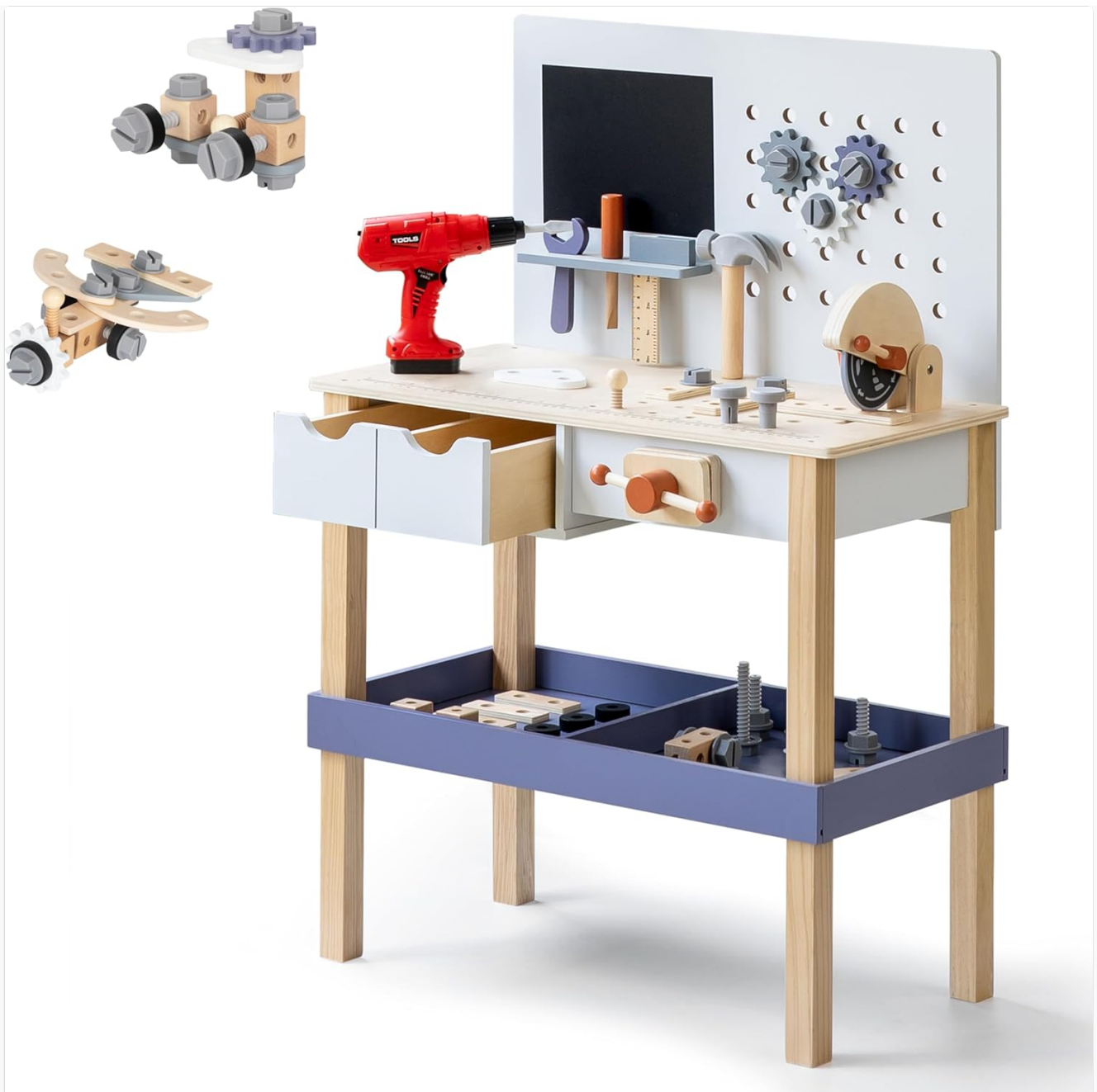
Image 1.1: The Leeshyah Wooden Kids Tool Bench with included accessories.