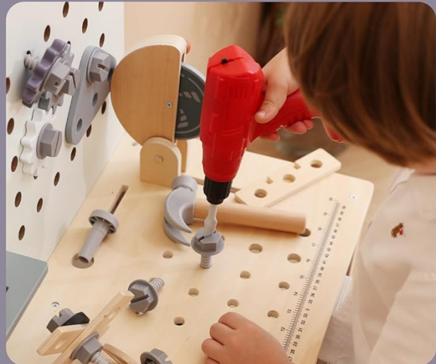
Image 5.2: A child demonstrating the use of the toy electric drill.