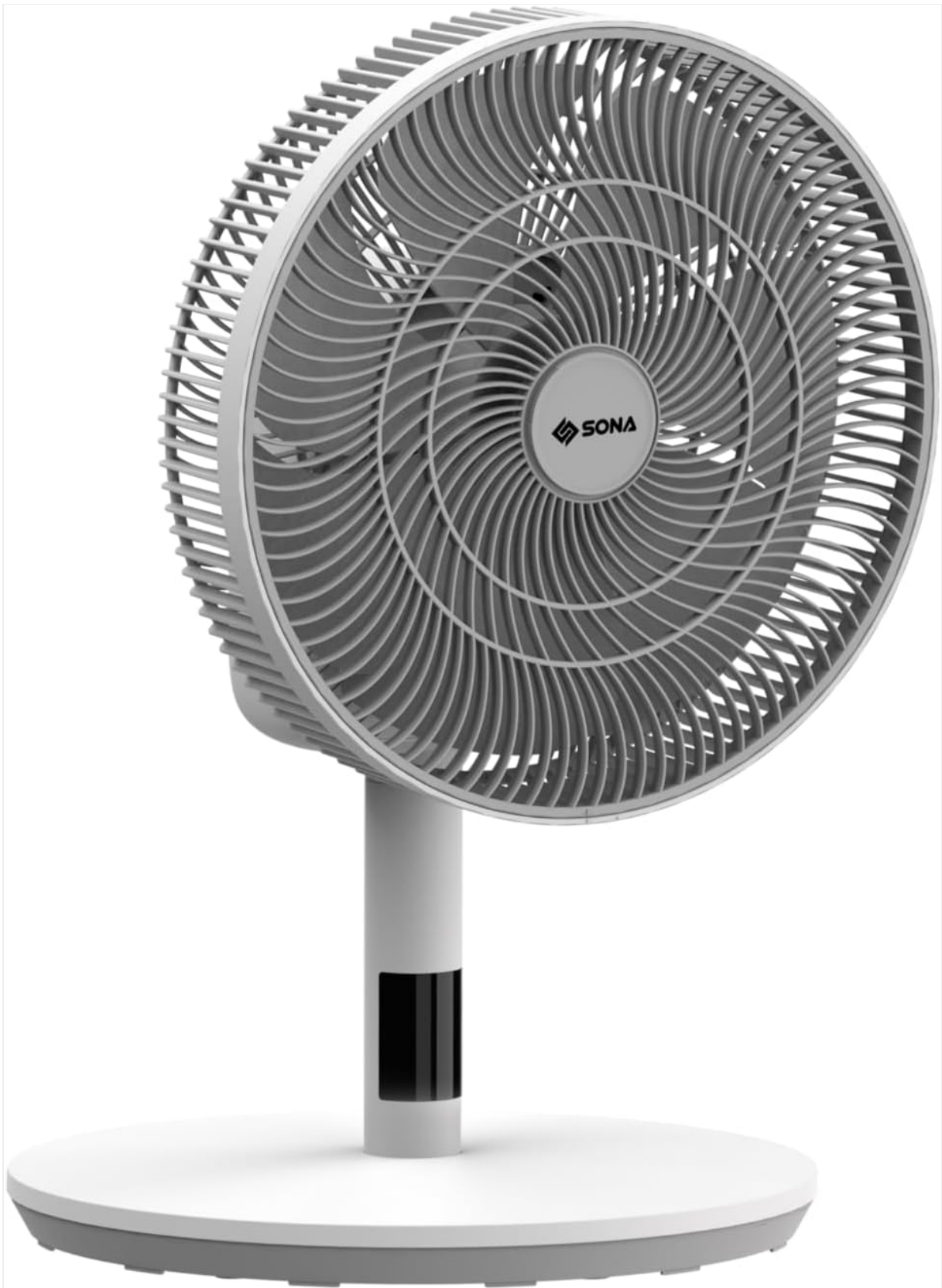
Figure 2.2: Side view of the Sona SFS 9009DC 3-in-1 DC Stand Fan. This image highlights the slim profile of the fan head and the sturdy design of the stand and base from a side perspective.