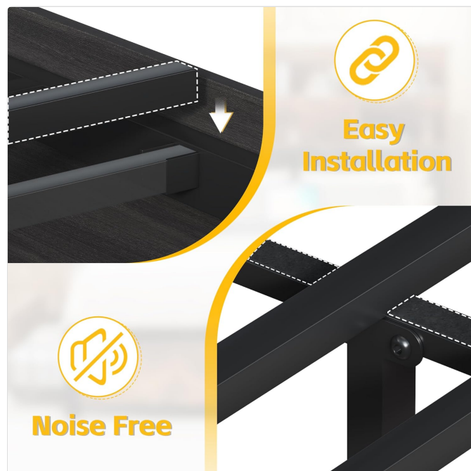
Image: Close-up of the metal slats with anti-friction padding, highlighting the noise-free design and easy installation.