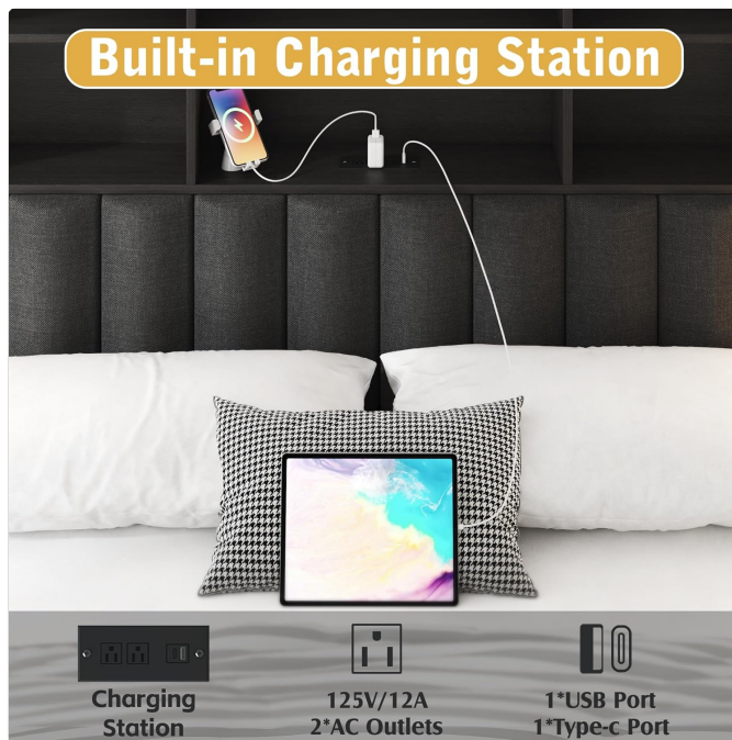
Image: Close-up of the integrated charging station on the headboard, showing the 2 AC outlets, 1 USB port, and 1 Type-C port.