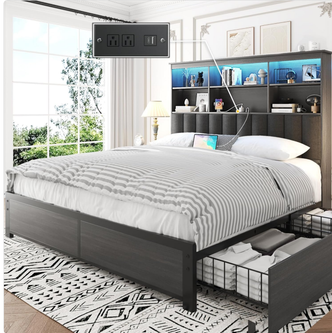
Image: The Lifezone Queen Bed Frame with its four under-bed storage drawers partially pulled out, showcasing their capacity.