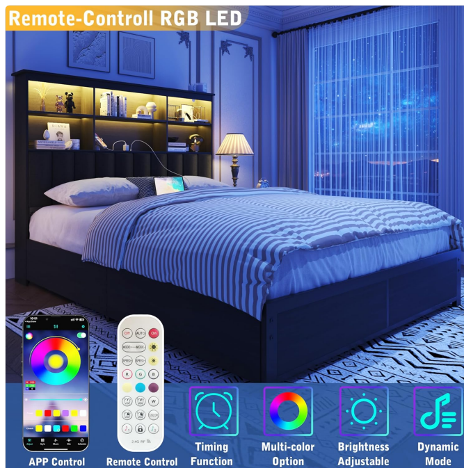
Image: The remote control and mobile app interface for controlling the RGB LED lights, demonstrating timing, multi-color, brightness, and dynamic functions.

The bed frame is equipped with an RGB LED light belt integrated into the headboard. Control the LED lights using the provided remote control or a compatible mobile application. You can adjust the color, brightness, mode (e.g., static, flashing), and set timing functions to suit your preference.