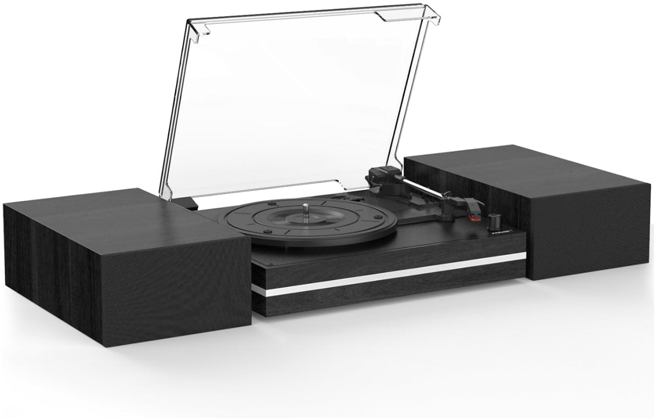
Image: The WOCKODER R612 Vinyl Record Player with its two external speakers, showcasing its design.

This manual provides detailed instructions for the setup, operation, and maintenance of your WOCKODER R612 Vinyl Record Player. Please read this manual thoroughly before using the product to ensure proper function and longevity.