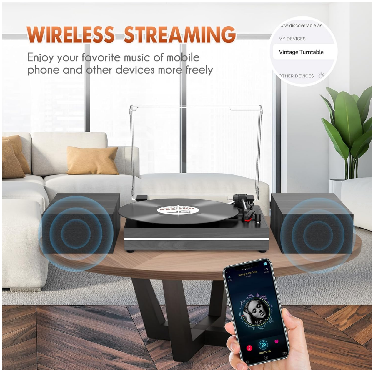
Image: A smartphone screen showing Bluetooth pairing with the "Vintage Turntable" device.