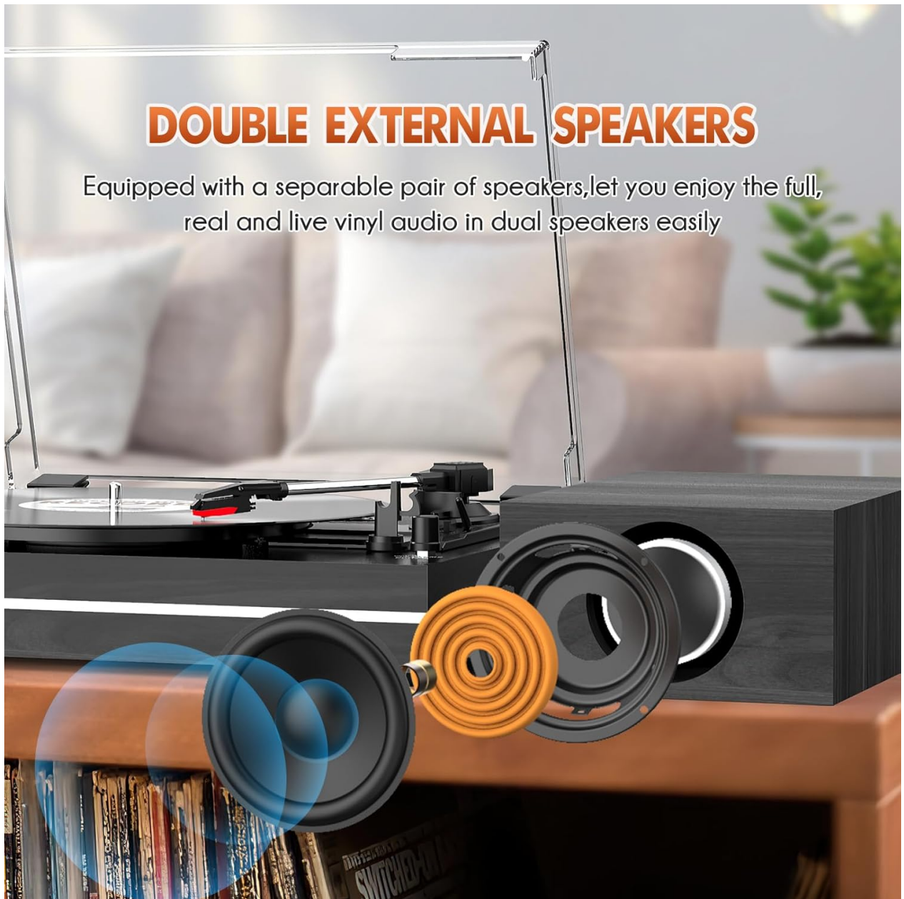
Image: The record player with its external speakers, highlighting the dual speaker setup.

Your browser does not support the video tag.