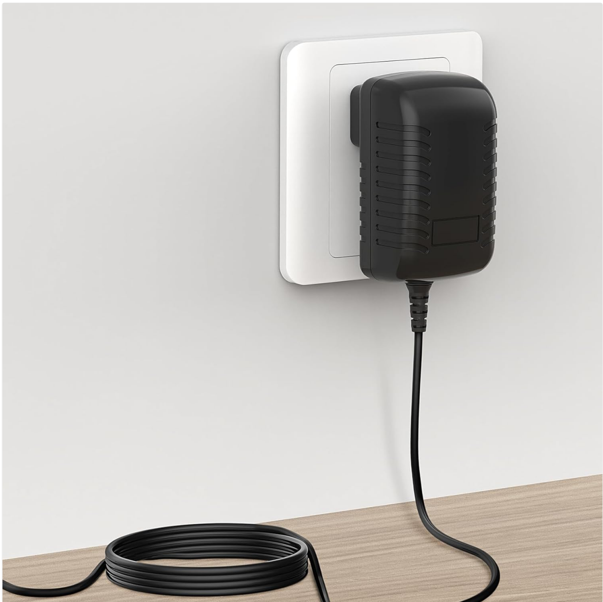
Figure 2: Adapter connected to a wall outlet. This image illustrates the adapter securely plugged into a standard wall socket, ready for use.