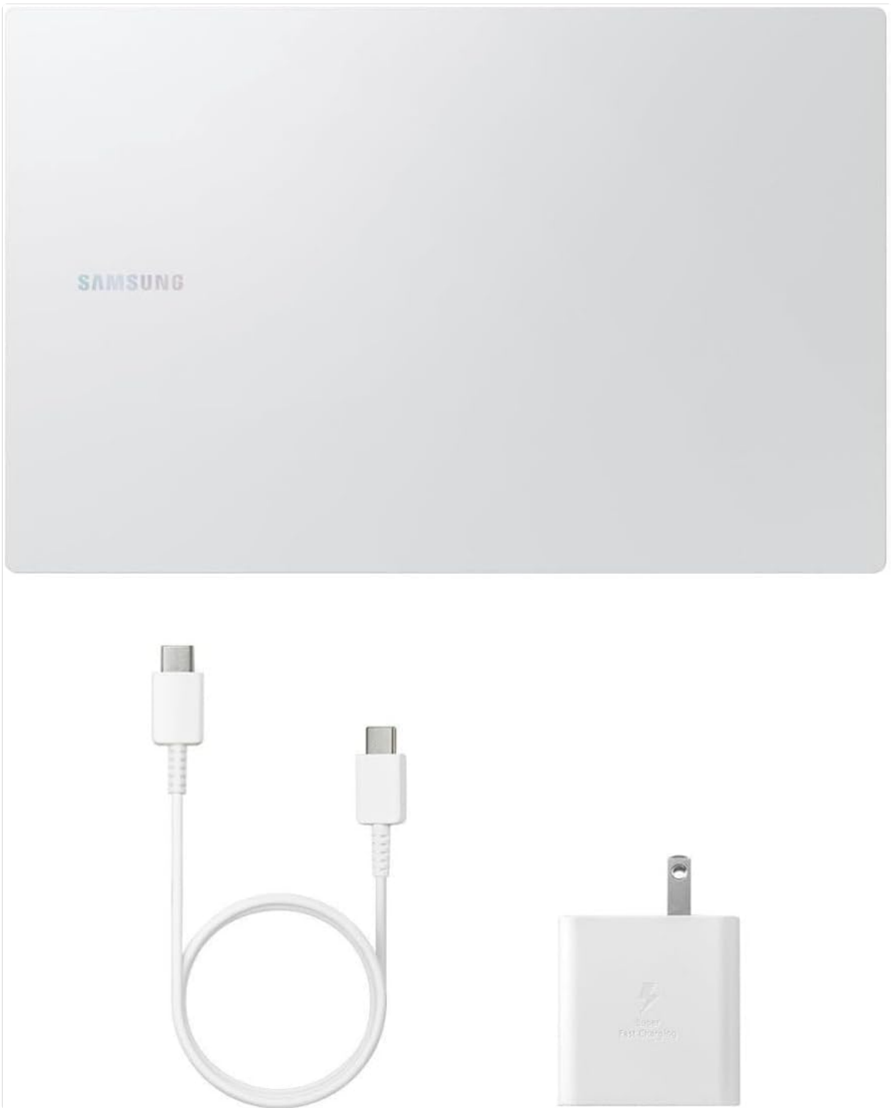
Figure 2: SAMSUNG Galaxy Book4 laptop with its 45W AC adapter and USB-C cable.