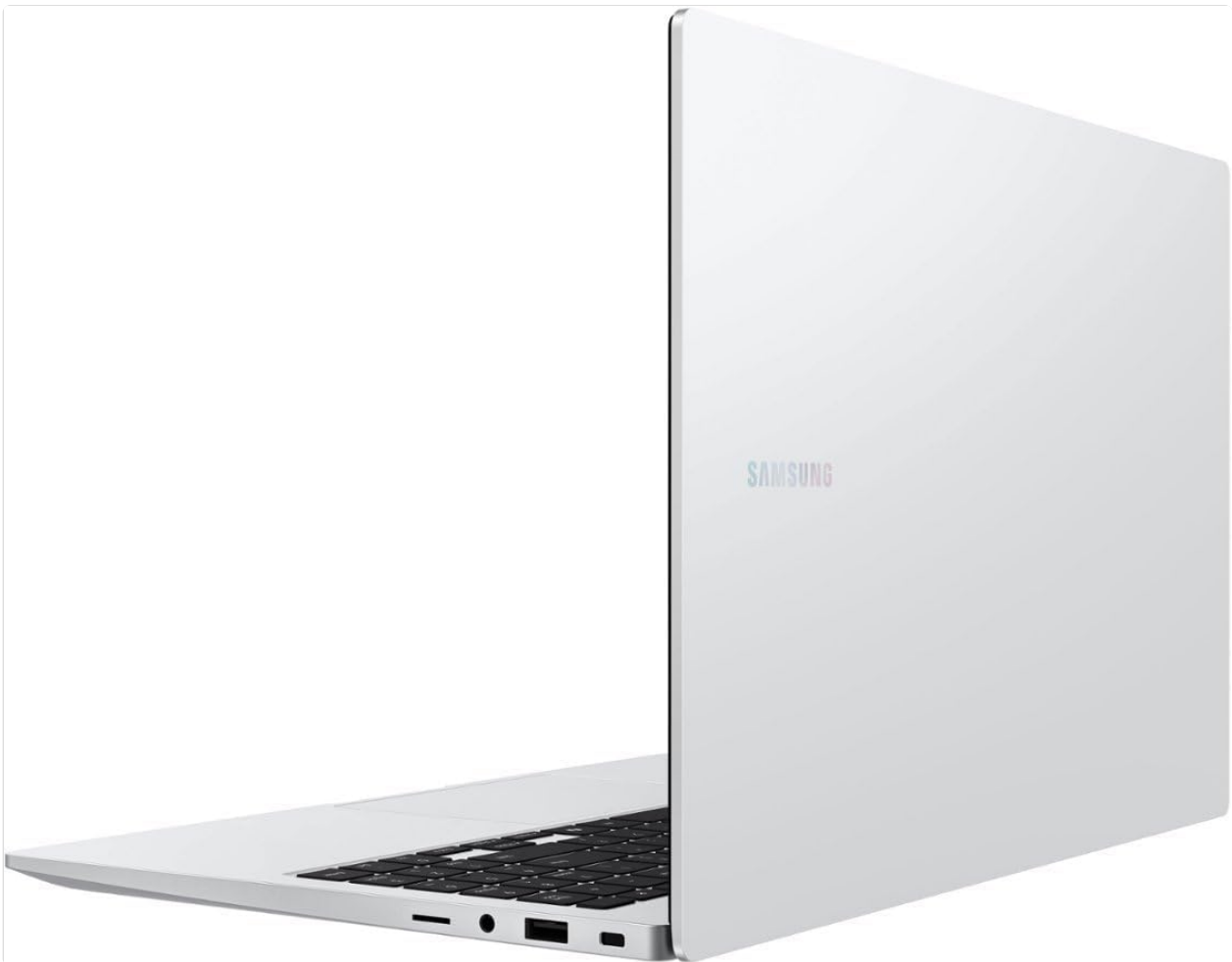
Figure 4: Right side ports including Micro SD card reader, Audio Jack, USB-A, and Kensington Lock slot.