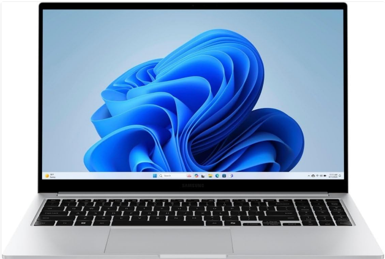
Figure 1: SAMSUNG Galaxy Book4 laptop with Windows desktop.

This manual provides essential information for setting up, operating, and maintaining your SAMSUNG Galaxy Book4 laptop, model NP750XGK-KS2US-CTO. Please read these instructions carefully to ensure optimal performance and longevity of your device.