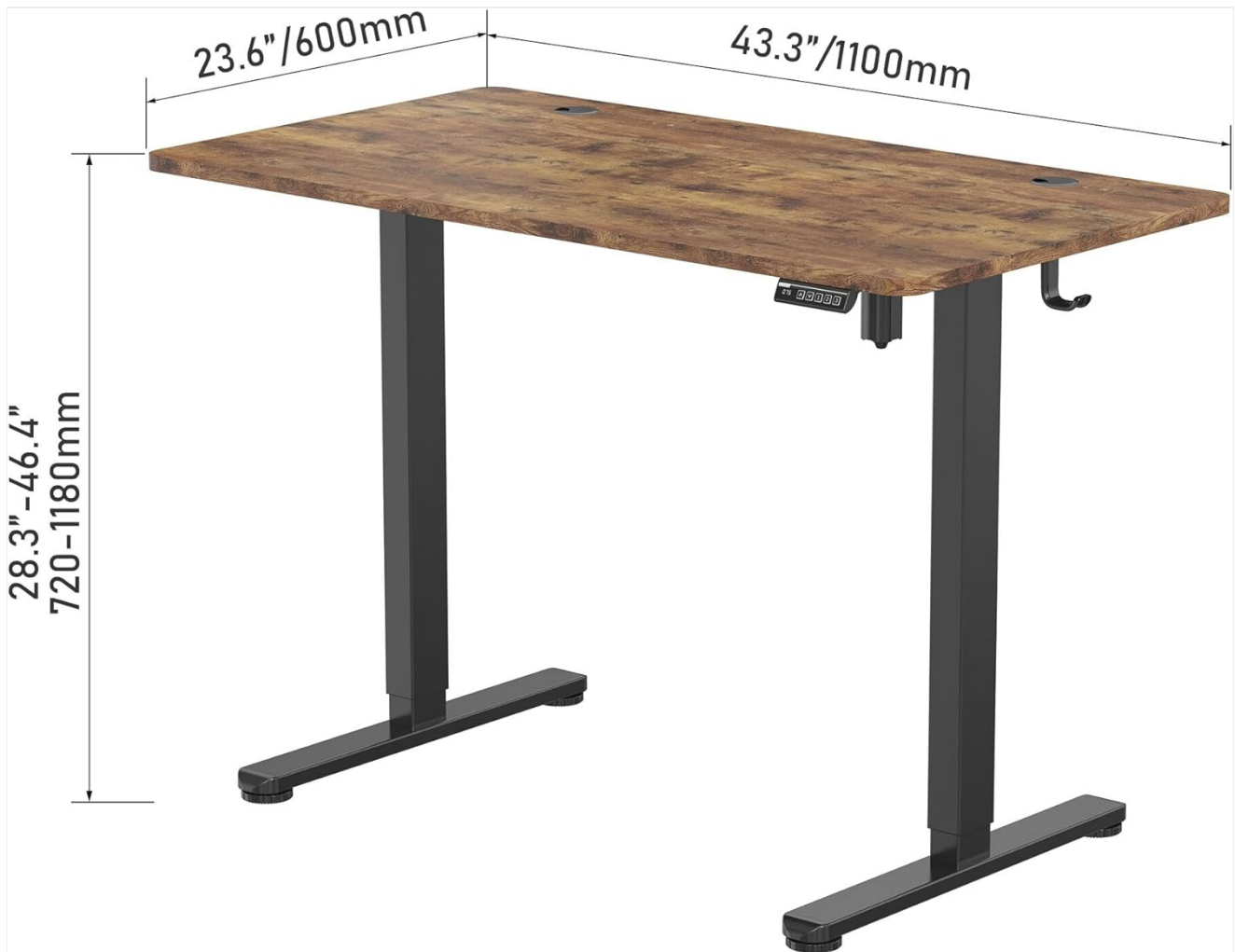
Figure 5: Desk dimensions.

Detailed technical specifications for the PrimeCables Height Adjustable Standing Desk.