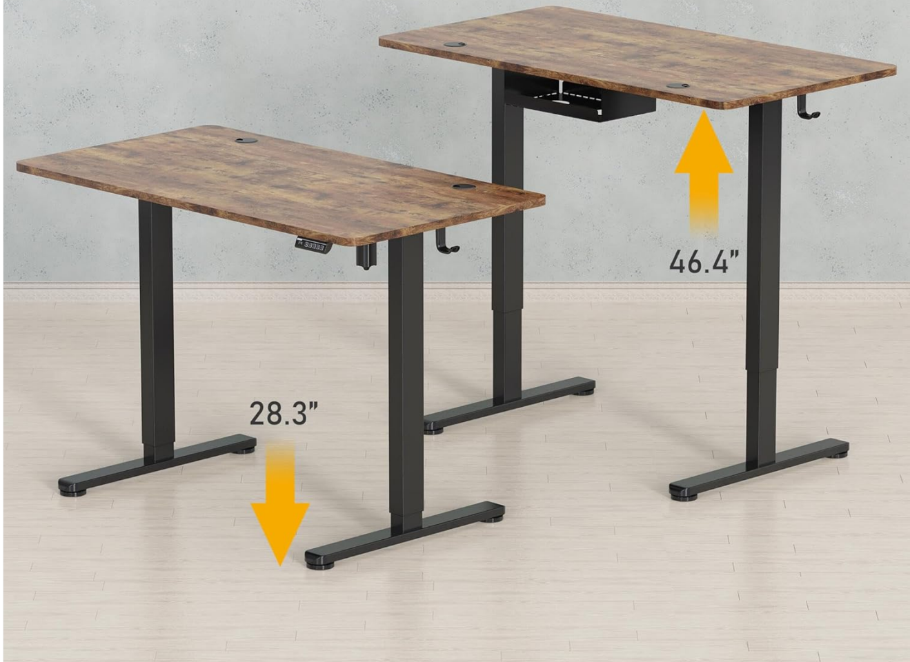
Figure 4: Desk height adjustment range from 28.3" to 46.4".