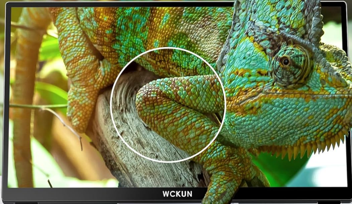
Figure 3.2: Vivid Display Quality