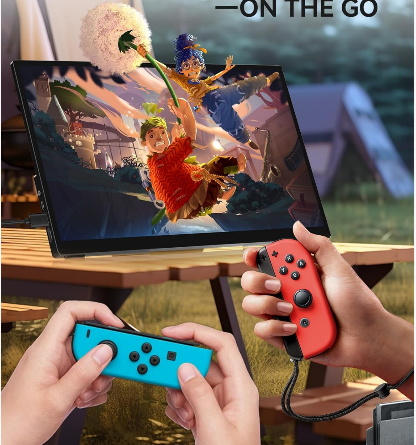
Figure 5.3: Leisure and Entertainment