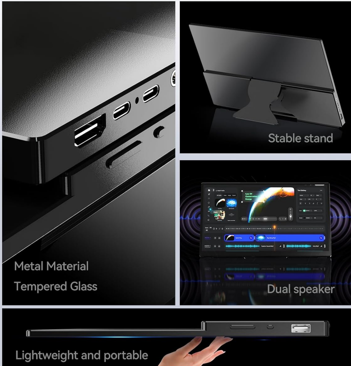
Figure 3.3: Design and Features Overview