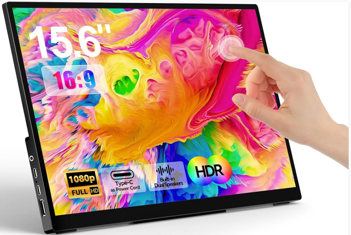
Figure 3.1: WCKUN Portable Monitor Front View