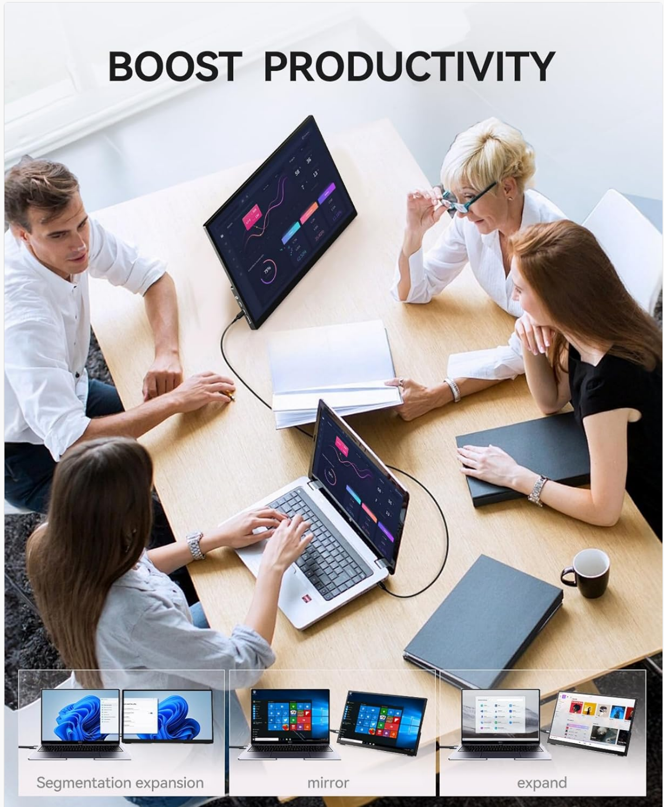
Figure 5.2: Productivity with Multiple Display Modes

These modes can be configured through your operating system's display settings.