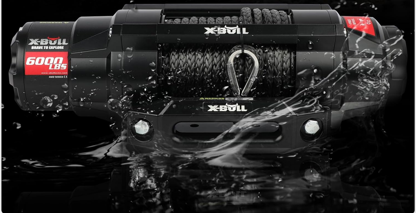
Figure 2: The winch unit is IP68 waterproof, designed for harsh environments.

Entire winch unit is rated IP68 waterproof, The highest level of protection, featuring OEM-grade O-ring rubber gaskets. This new sealing delivers a longer service life and meets the most stringent IP68 submersion testing.