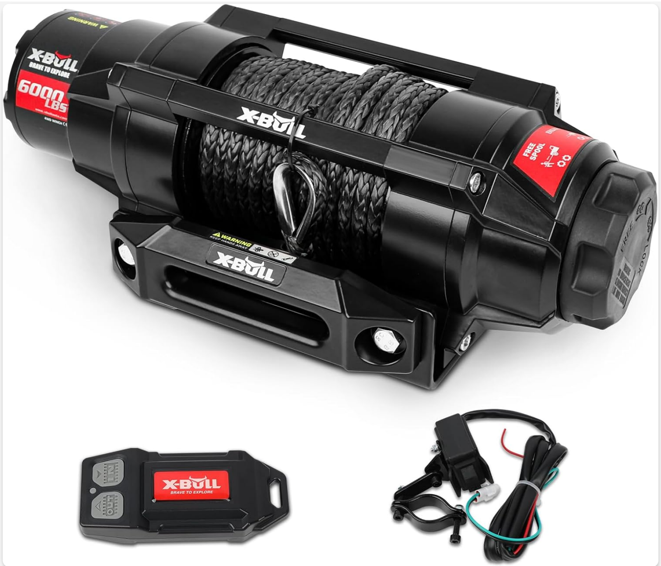
Figure 1: X-BULL 6000LBS Electric Winch with included accessories.