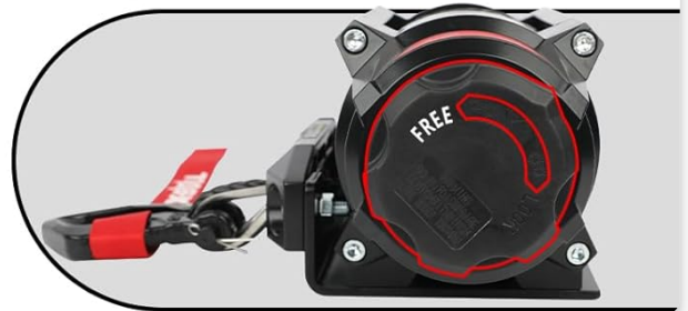
Figure 4: High-efficiency 3-stage planetary gear system.