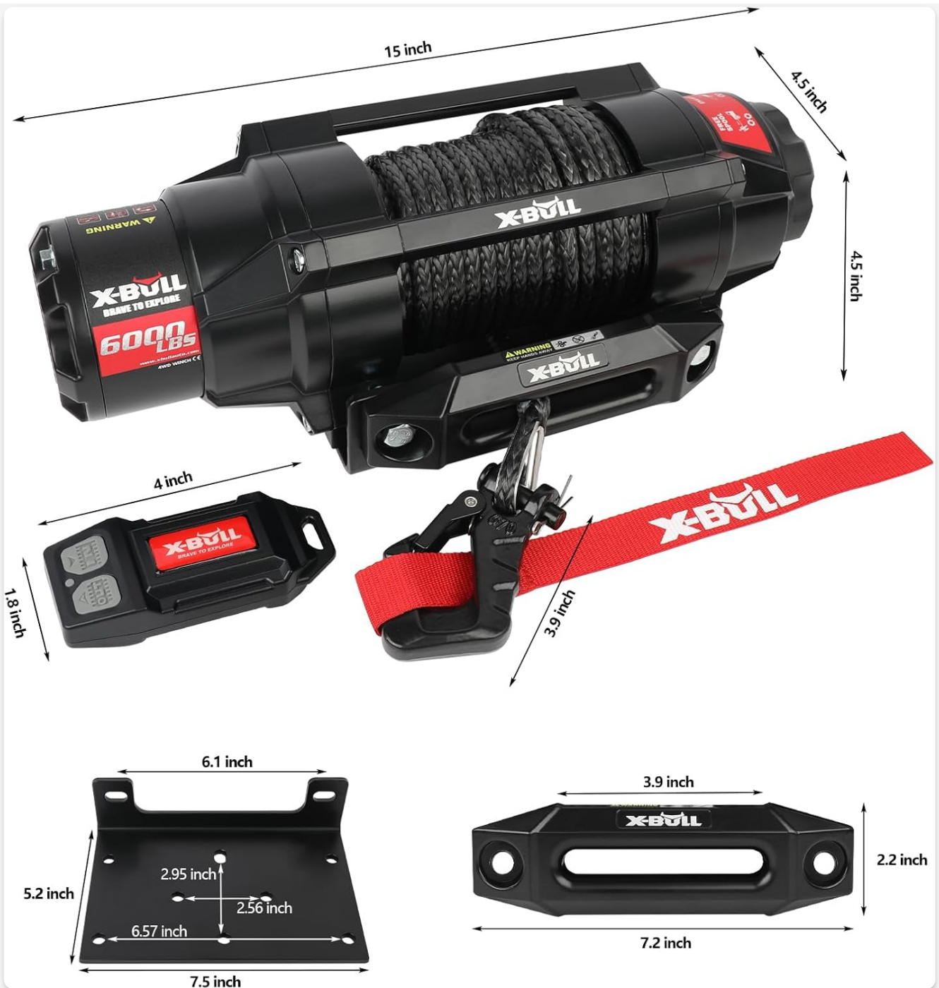
Figure 5: Winch dimensions and included accessories for installation.