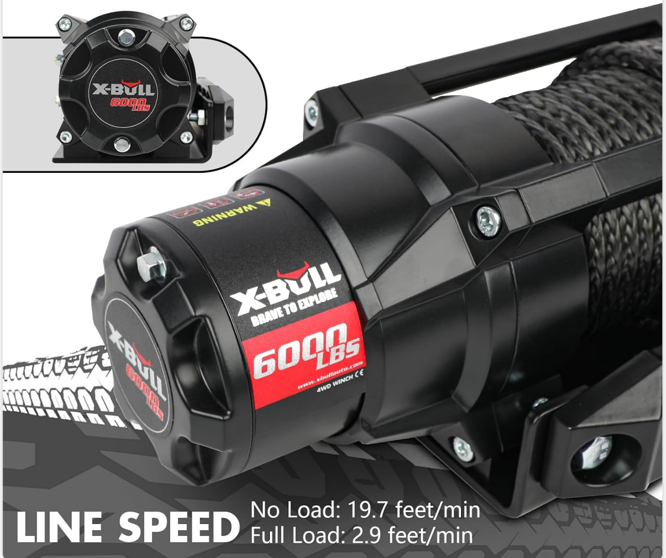
Figure 3: Powerful 1.3 HP motor and efficient line speeds.