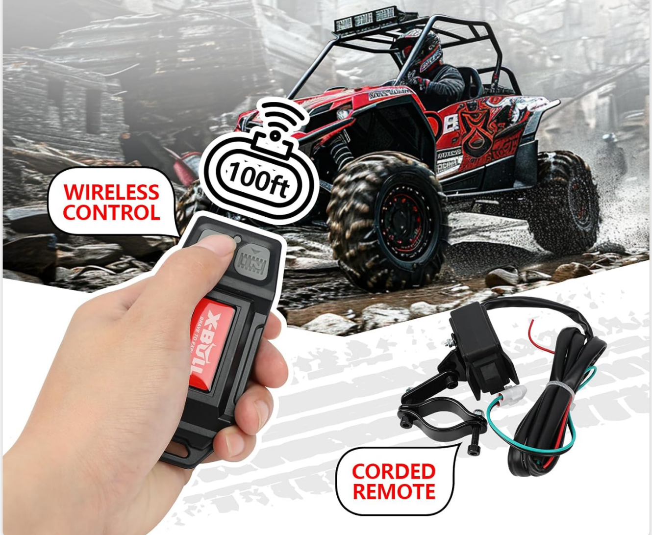
Figure 7: Wired and wireless remote controls for flexible operation.

Includes a corded remote with 4.2ft long, and the receiver for 100ft + range of wireless control