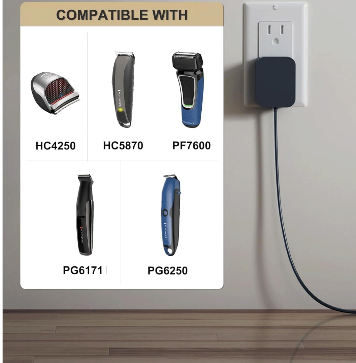
Figure 2: Examples of compatible Remington shaver and trimmer models.