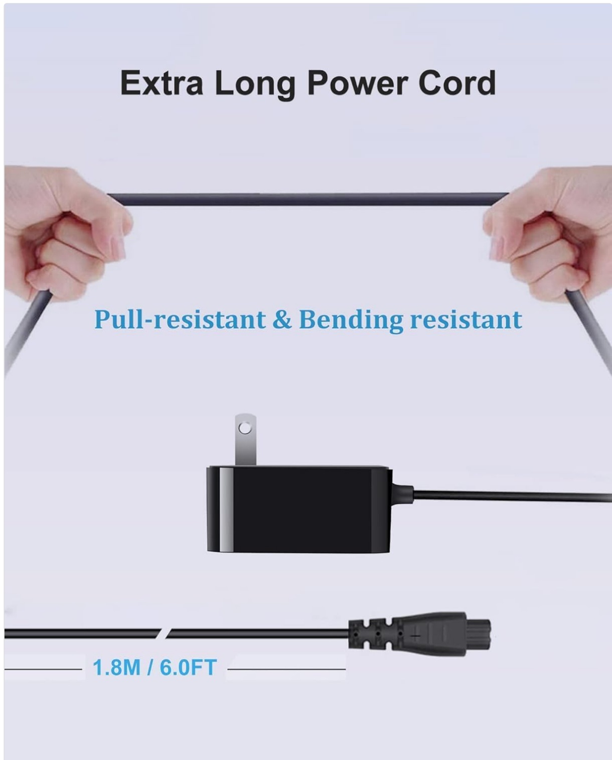
Figure 5: The charger features an extra-long, durable power cord.