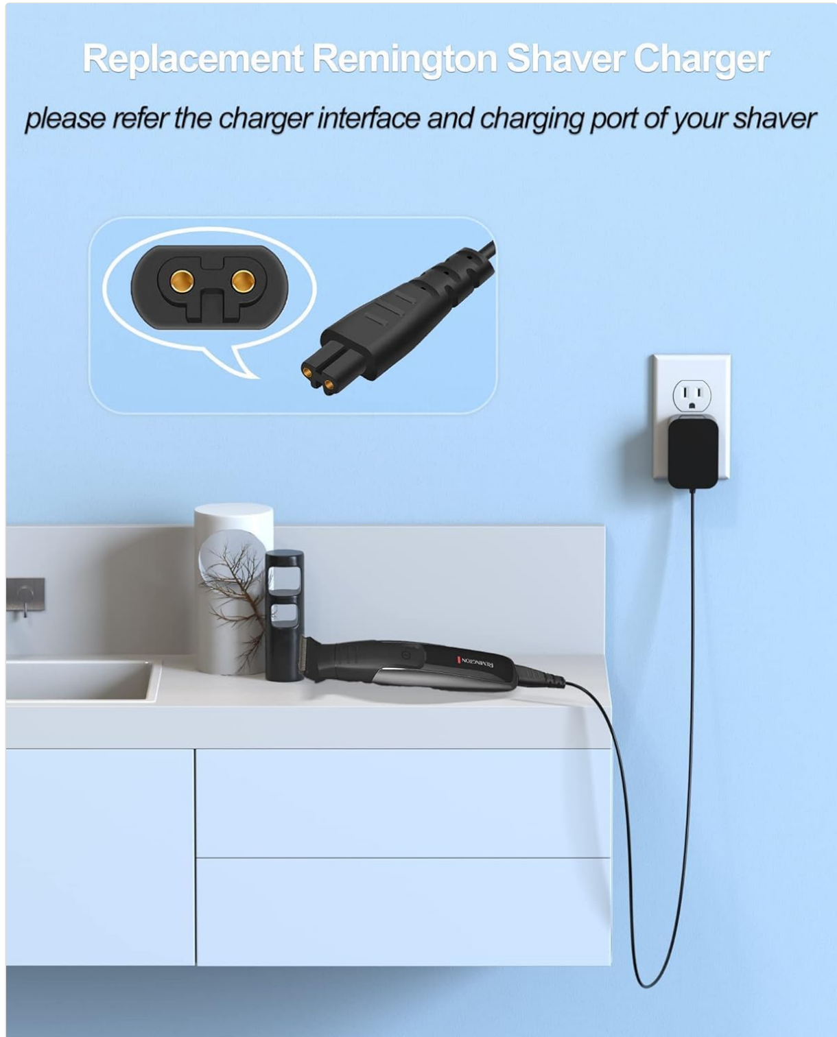
Figure 3: Proper connection of the charger to a Remington shaver and power outlet.