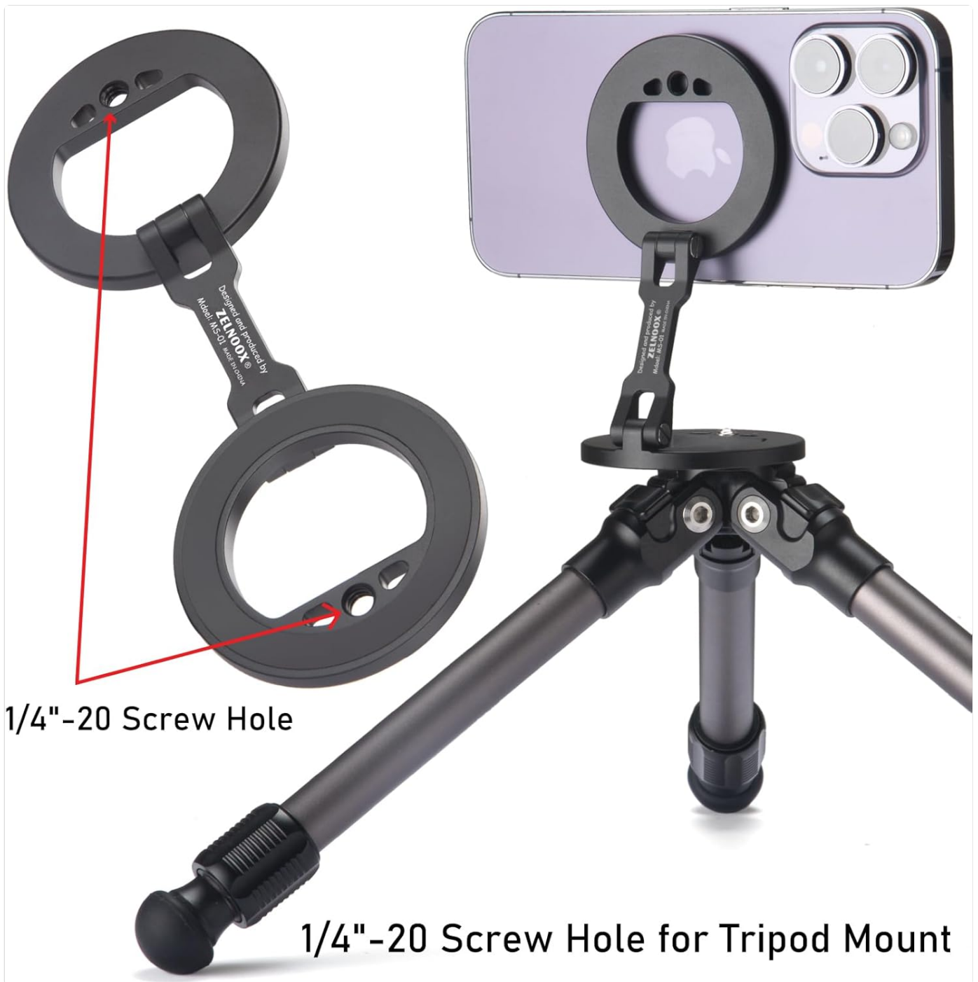
Figure 5: Examples of various stable table placements and orientations achievable with the adjustable phone holder.