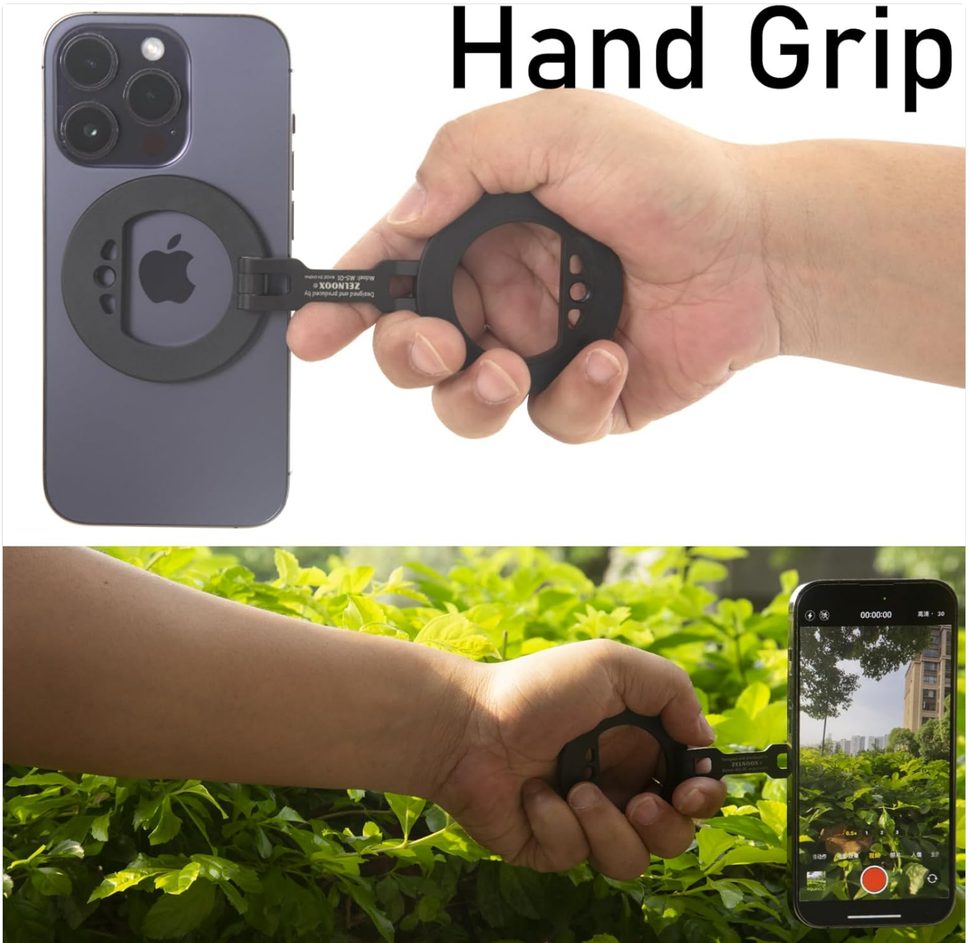
Figure 6: Demonstrating the use of the phone holder as a comfortable and secure hand grip.