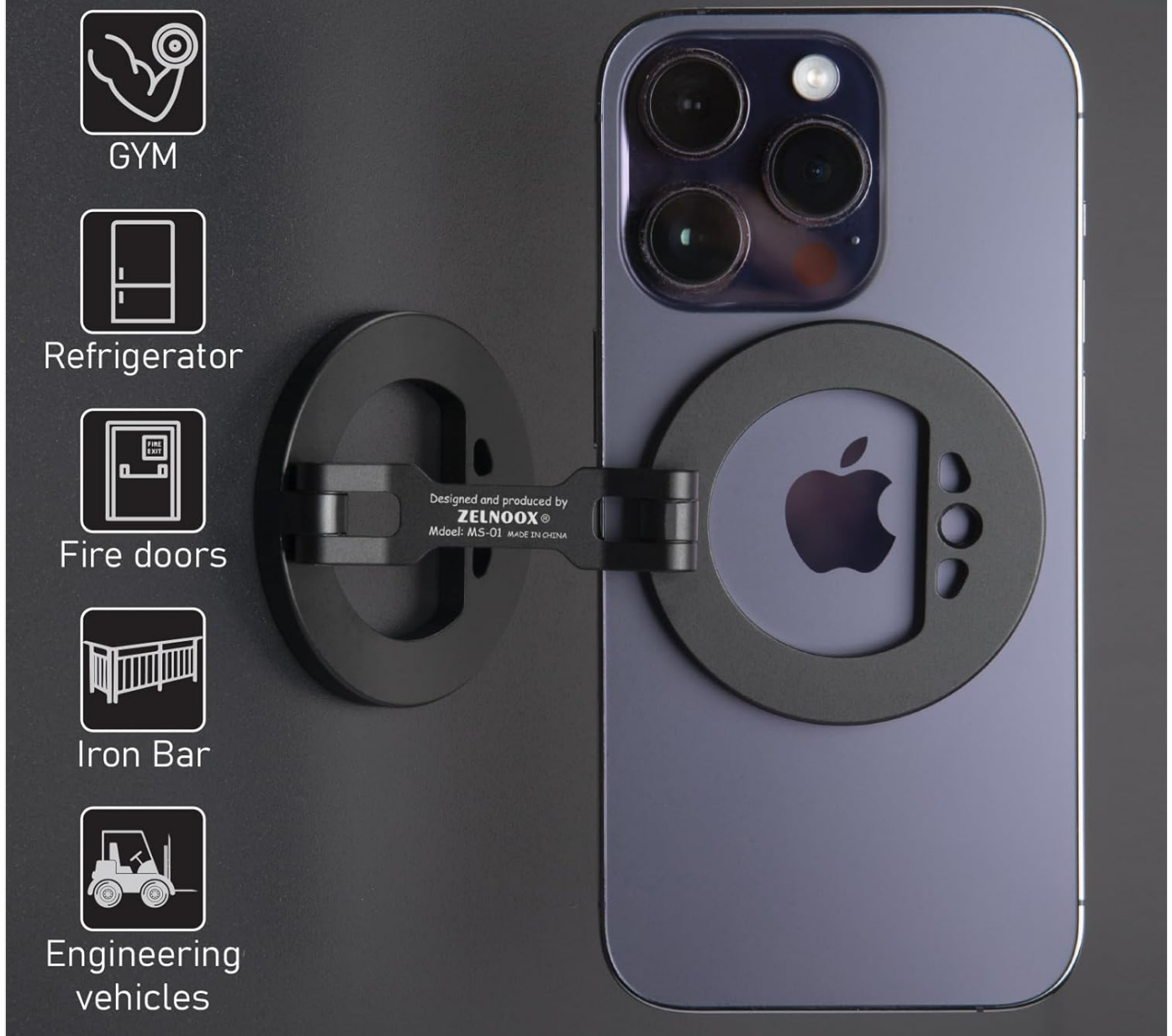
Figure 2: Demonstrating the versatility of the magnetic phone holder for mounting on various ferrous surfaces.