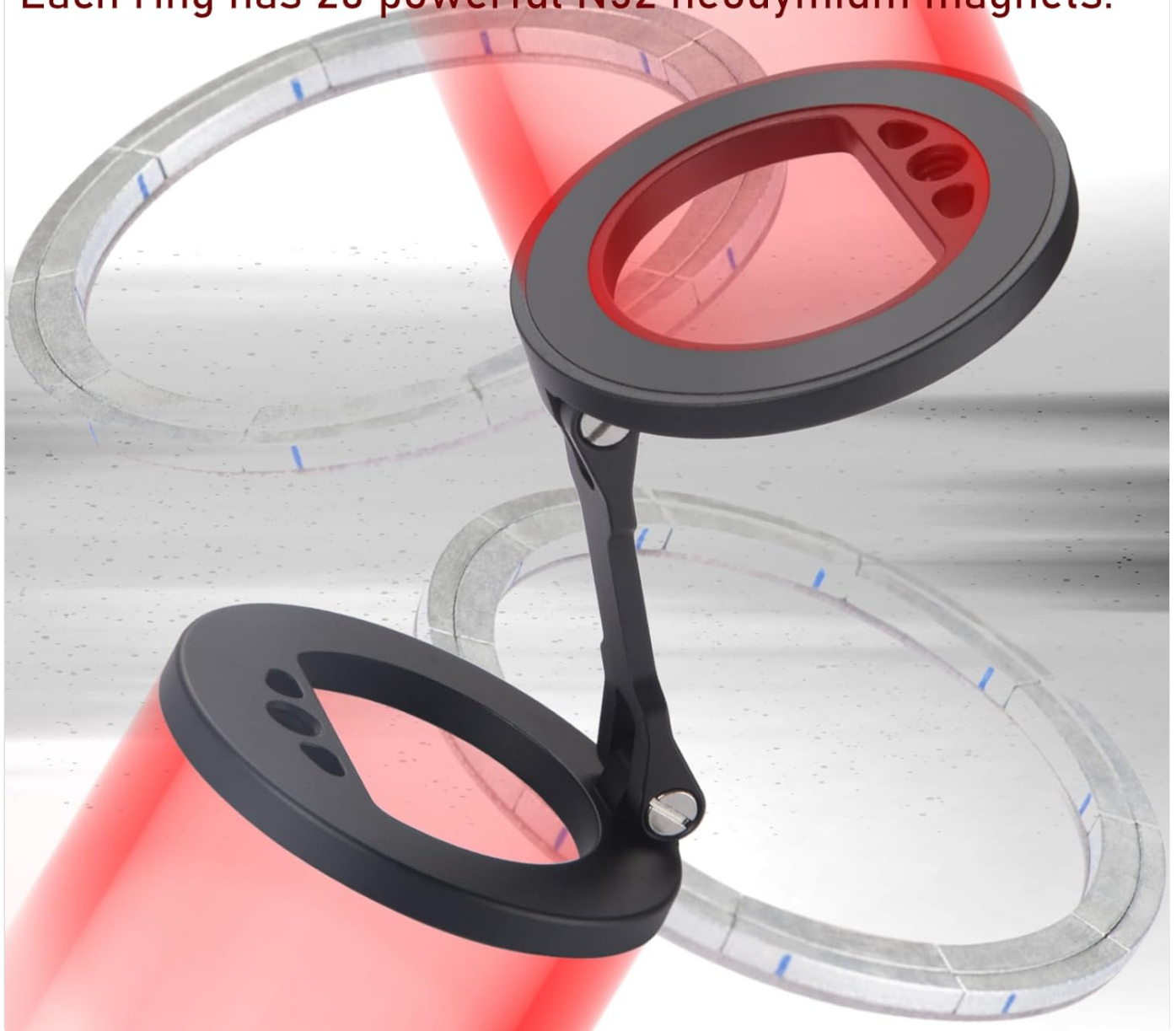
Figure 4: Illustrating the extensive adjustability of the phone stand, enabling users to find the perfect viewing angle.

Each ring has 20 powerful N52 neodymium magnets.