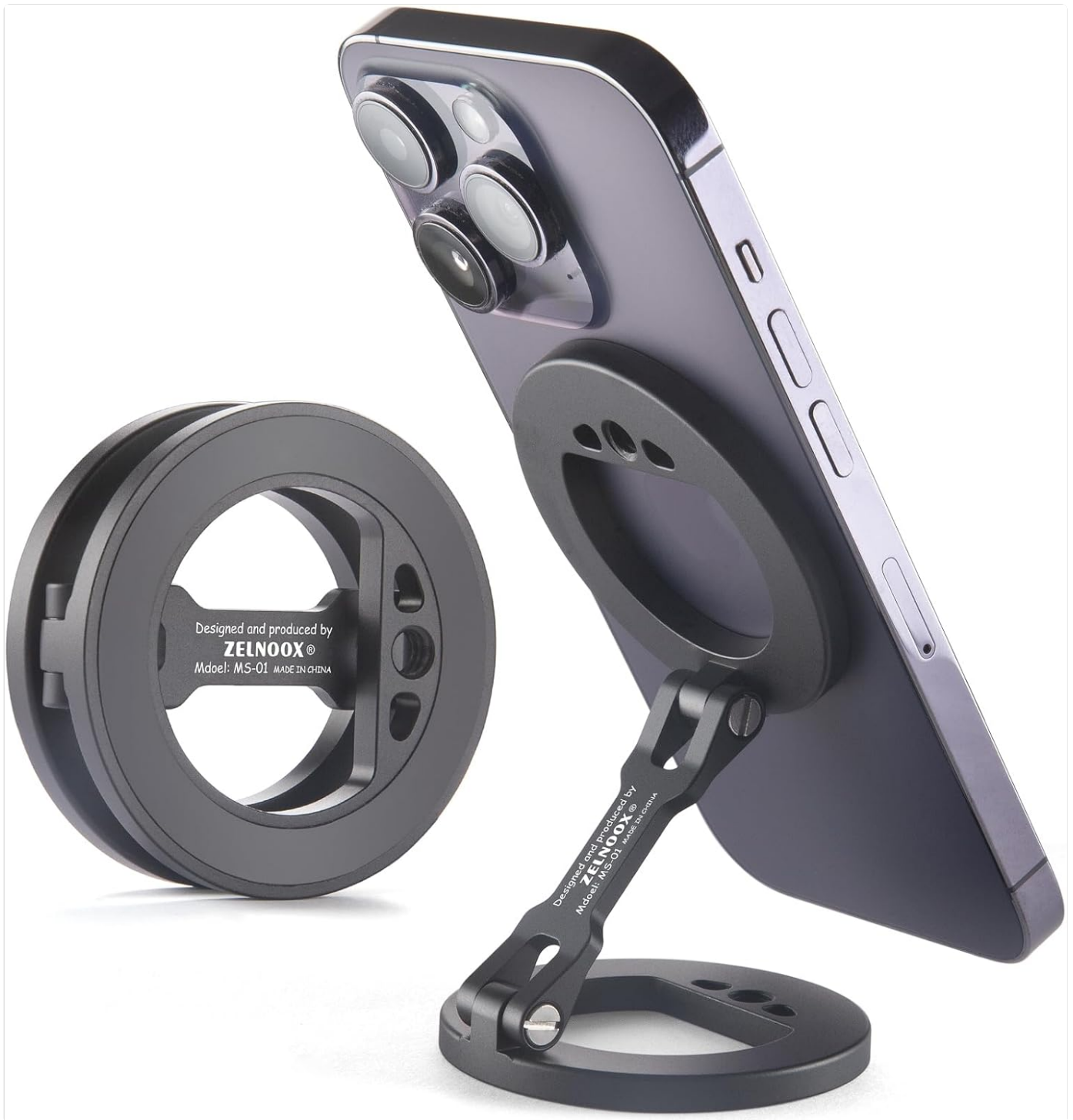
Figure 1: The Zelnoox Double Magnetic Ring Phone Holder, demonstrating its compact folded state and its extended use as a phone stand, securely holding a smartphone.